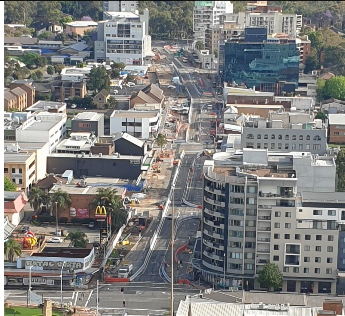
Level 29 Meriton Suites taken 1/11/20

Area 1: Church Street –Victoria Rd to Pennant Hills Rd