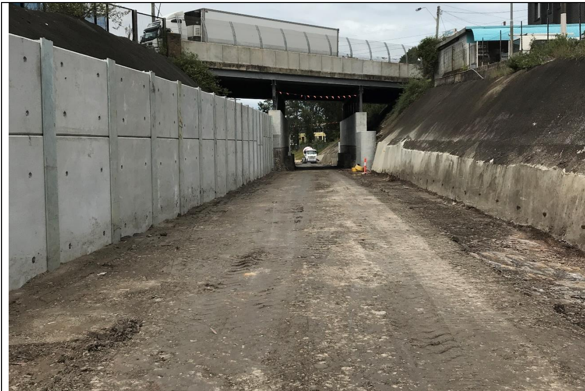
Inspection CPBD054 – 24/11/2020

Area 3 : Pennant Hills Rd, Carlingford – Retaining walls and bridge protection