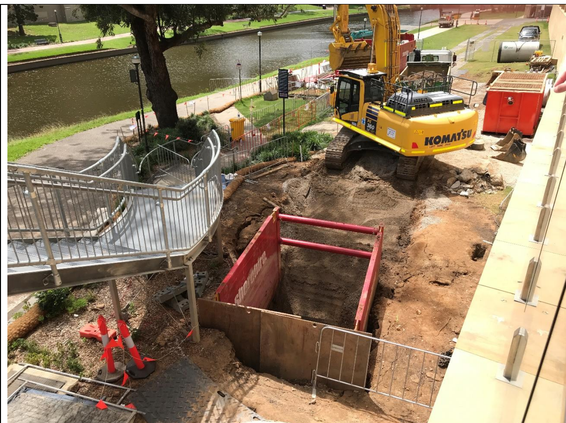
Inspection CPBD053 – 18/11/2020

Area 2 : Parramatta River Foreshore – Microtunnelling works have recommenced