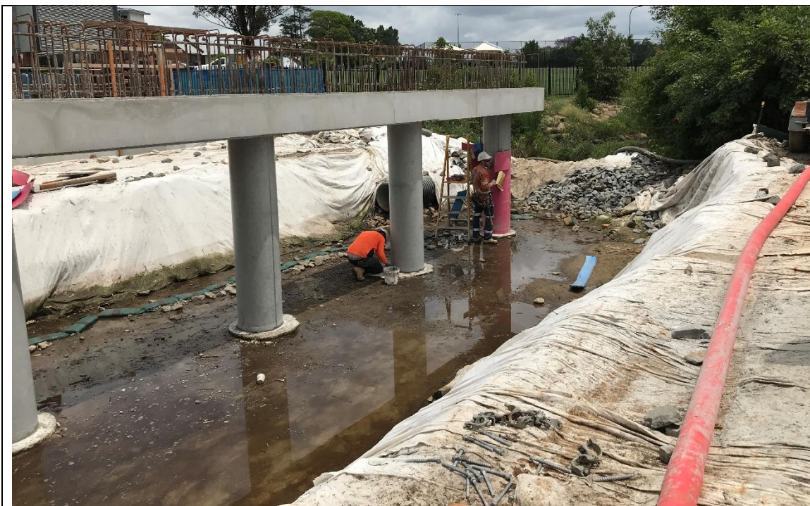
Inspection CPBD054 – 24/11/2020

Area 3 : Pennant Hills Rd, Carlingford – Retaining walls and bridge protection