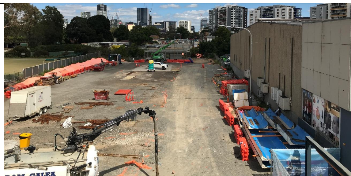
Inspection CPBD052 – 10/11/2020

Area 1: Church Street –Victoria Rd to Pennant Hills Rd