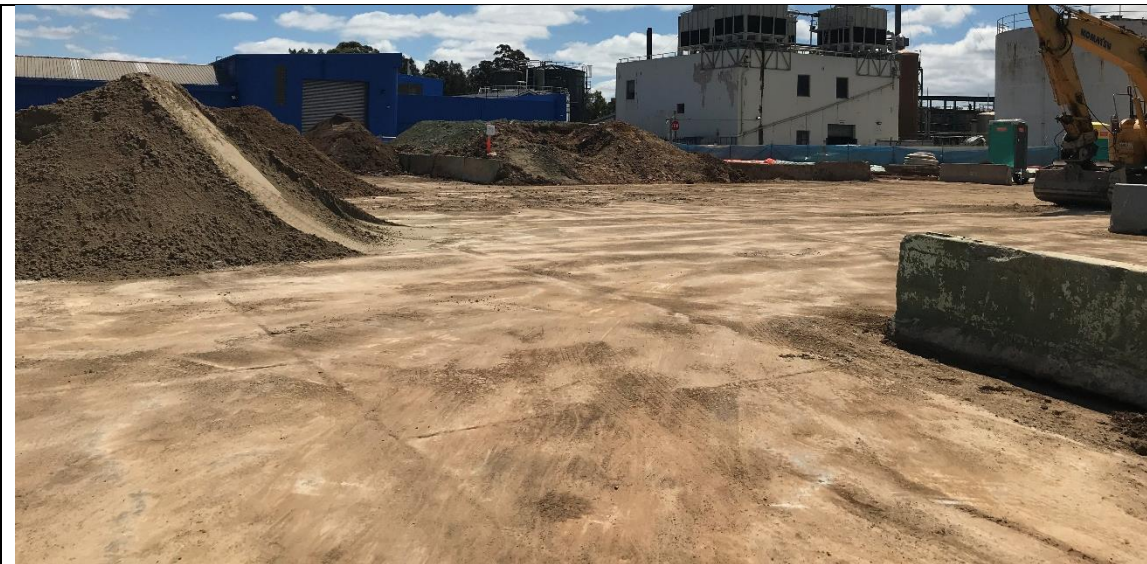
Inspection CPBD052 – 10/11/2020