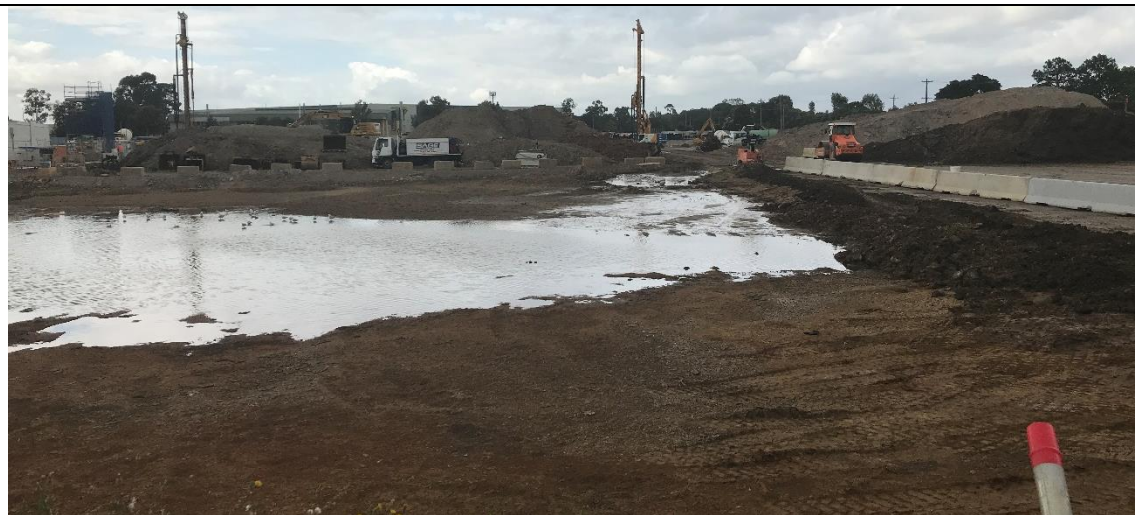
Inspection VNT046 – 24/11/2020

Containment cell capping and liner installation