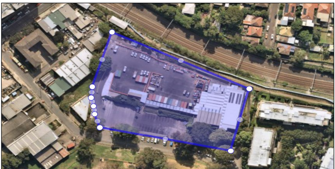
Figure 3. Canterbury Compound (water quality location 8)