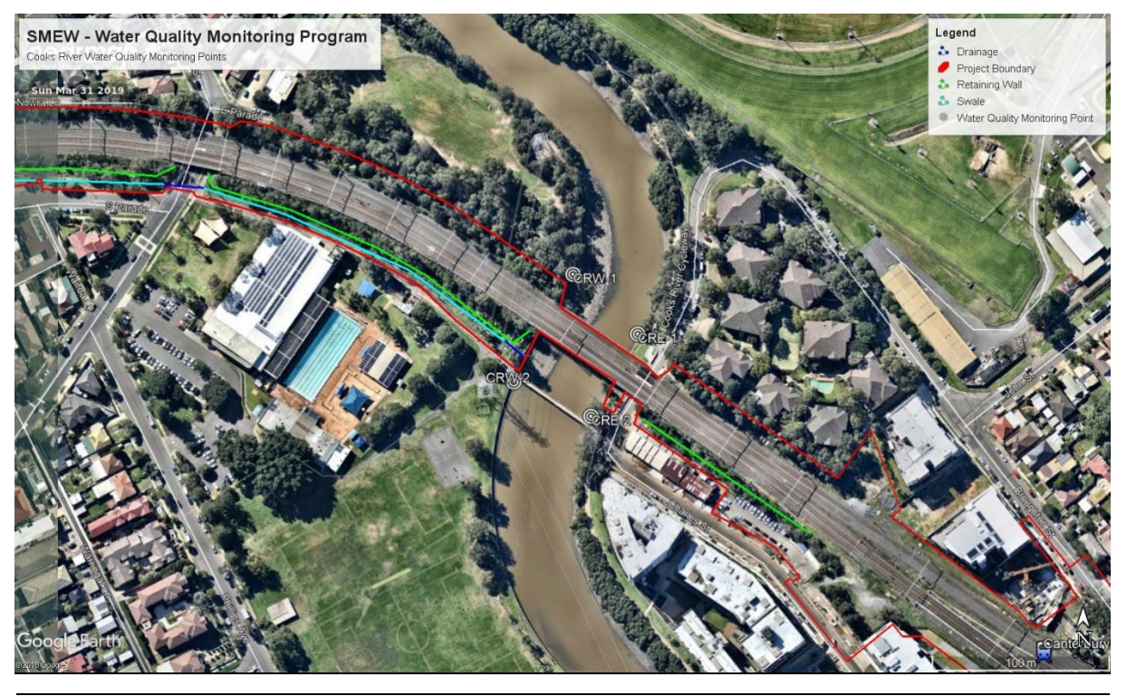
Figure 1 - Surface Water Monitoring Locations

The locations identified for surface water monitoring are the only locations that generally offer safe access. There are several drainage outlets between the upstream and downstream sampling points on both sides of the Cooks River.