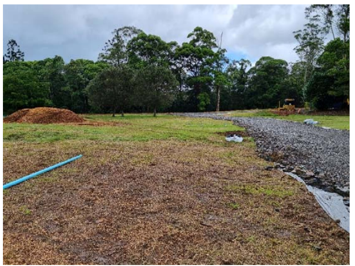
Image 5: Opal Blvd utility relocations (general view of work area)