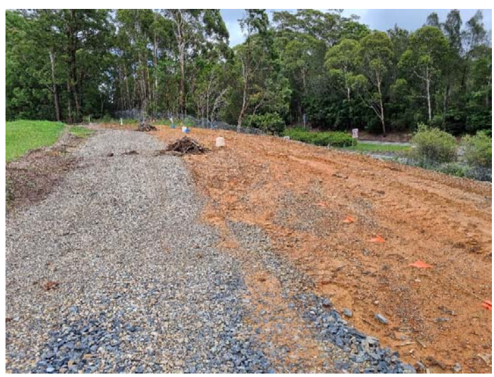
Image 6: Stadium Dr utility relocations – commencement of site clean-up