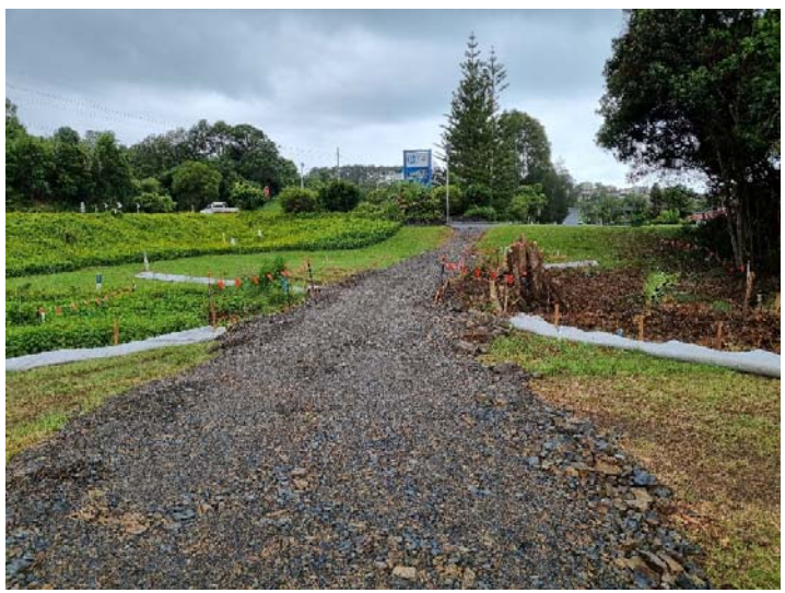
Image 3: Opal Blvd utility relocations (entrance to work area and waterway crossing)