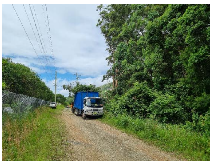
Image 2: Vegetation clearing works in preparation for utilities relocations (Old Coast Rd)