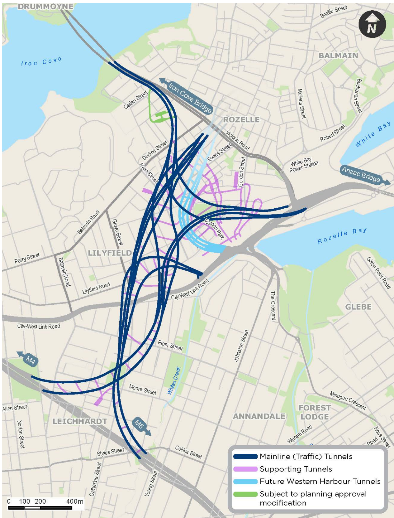
Figure 2 Overview of the Rozelle interchange project (Stage 2)