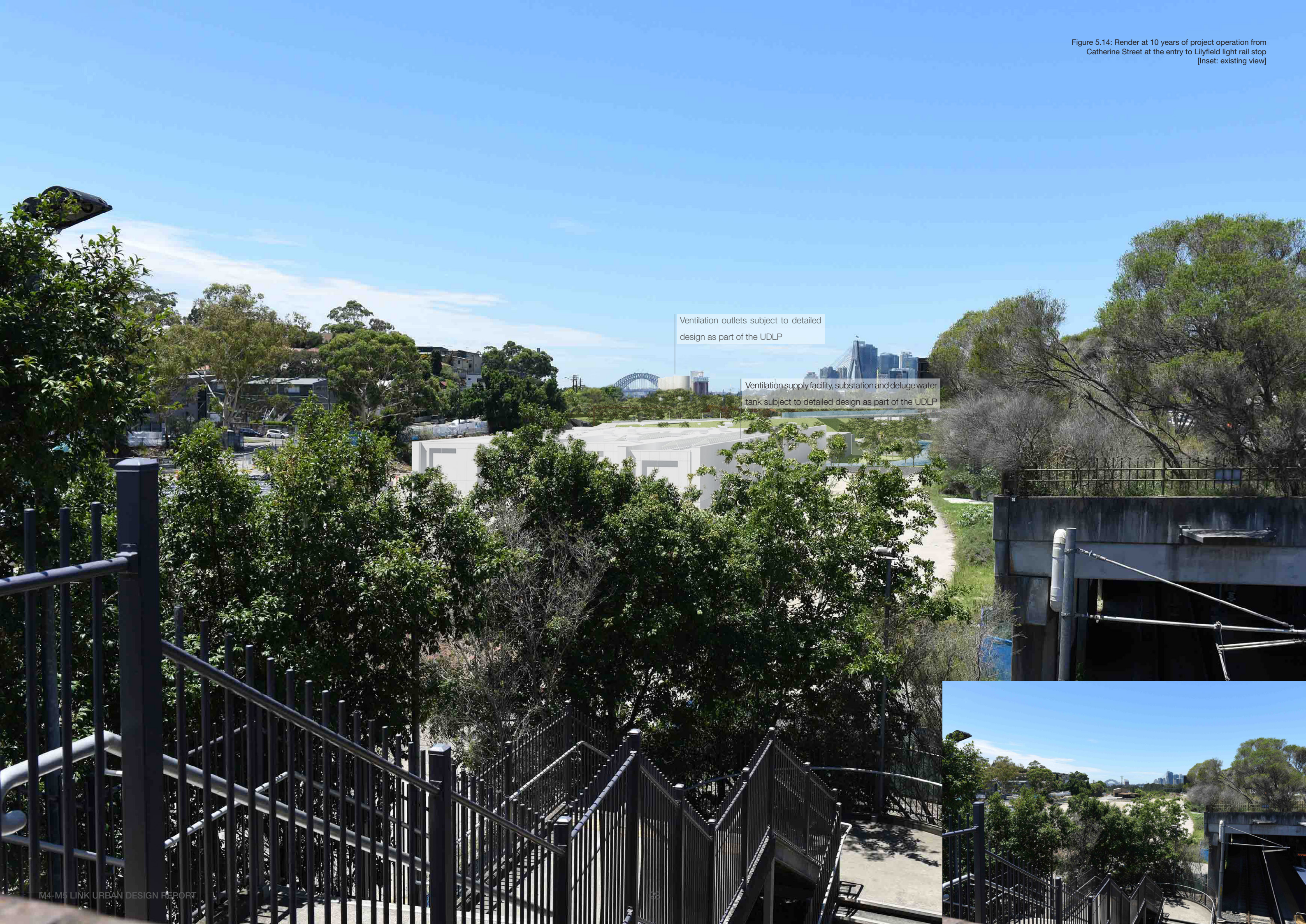
Figure 5.14: Render at 10 years of project operation from Catherine Street at the entry to Lilyfield light rail stop [Inset: existing view]