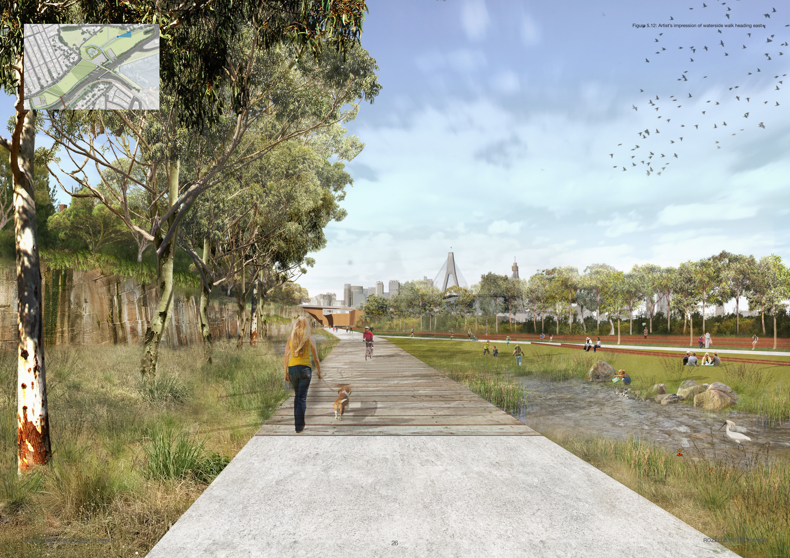
Figure 5.12: Artist's impression of waterside walk heading east