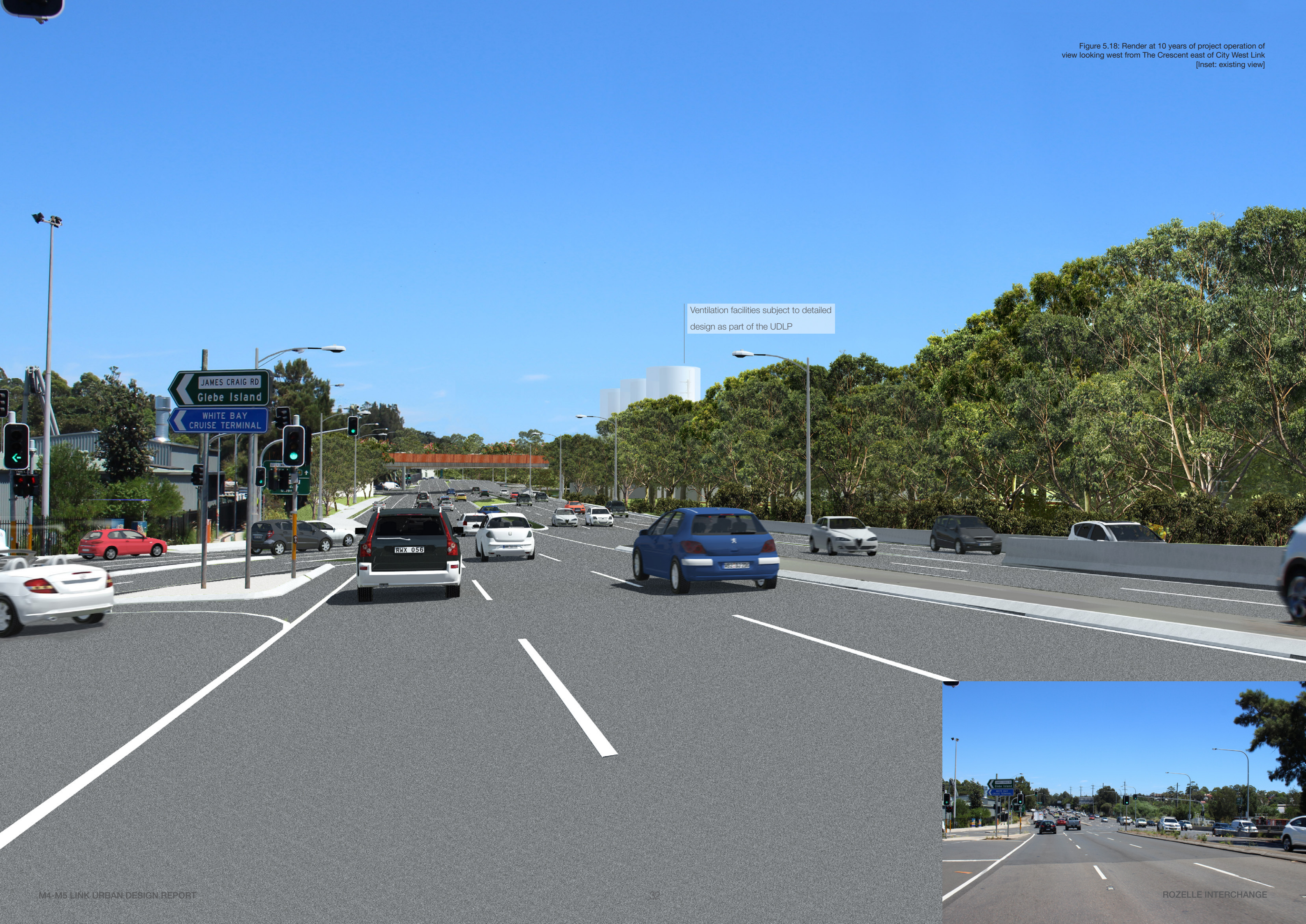
Figure 5.18: Render at 10 years of project operation of view looking west from The Crescent east of City West Link [Inset: existing view]