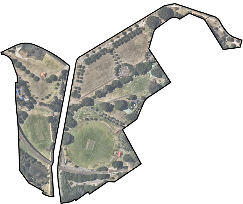
Bicentennial and Federal Park [Glebe] - 5 hectares Jubilee Park [Glebe] - 10 hectares