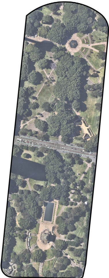
Hyde Park - 16 hectares