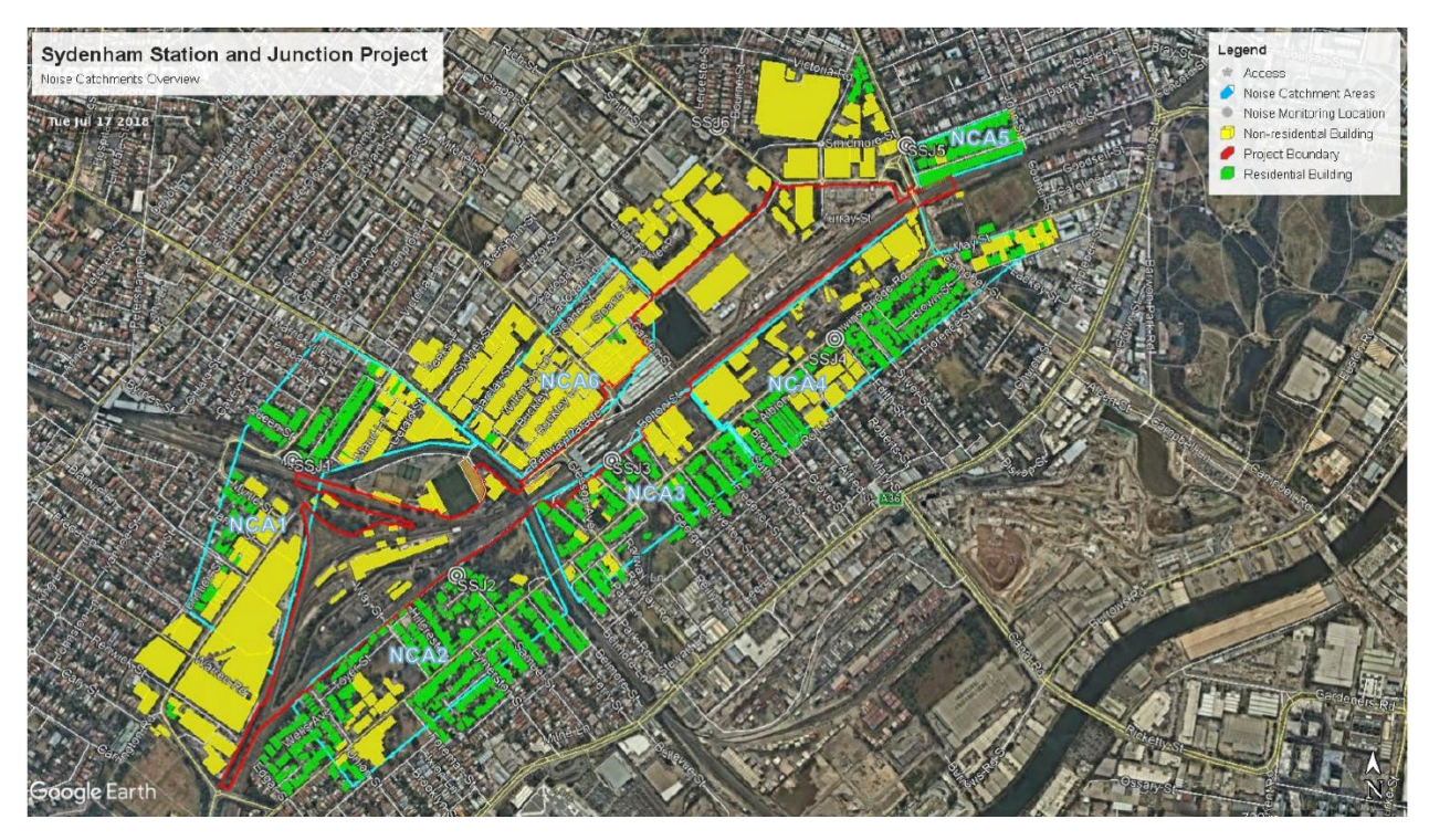
Figure 21 - NCAs and identified residential and non-residential receivers

Monitoring is required to be undertaken during construction activities (including out of hours works) where required in accordance with Section 8 of the CNVIS and for validation purposes. Attended noise monitoring is also undertaken in the event of a noise complaint. Monitoring will be undertaken at the complainant's property, nearest to any work.