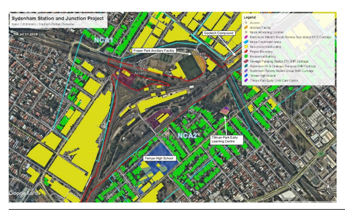
Figure 2 - Surrounding Land-use and Sensitive Non-Residential receivers

Objectives for noise and vibration management on the project are: