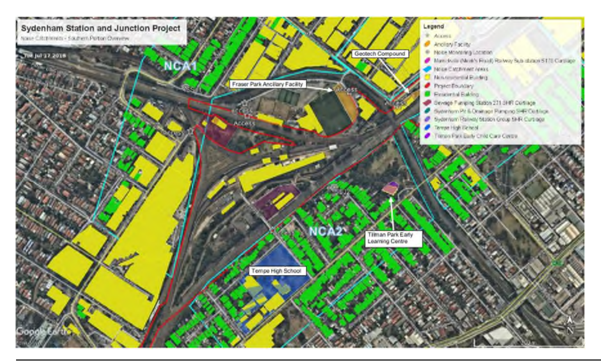
Figure 1 - Surrounding Land-use and Sensitive Non-Residential receivers

In addition, two sensitive non-residential receivers have been identified as potentially being affected by noise in the duration of the project, Tempe High School and Tillman Park Early Learning Centre (both located within NCA2) – see Figure 1. To date, no construction activities have taken place which were identified as significantly affecting these sensitive receivers during their operating hours.