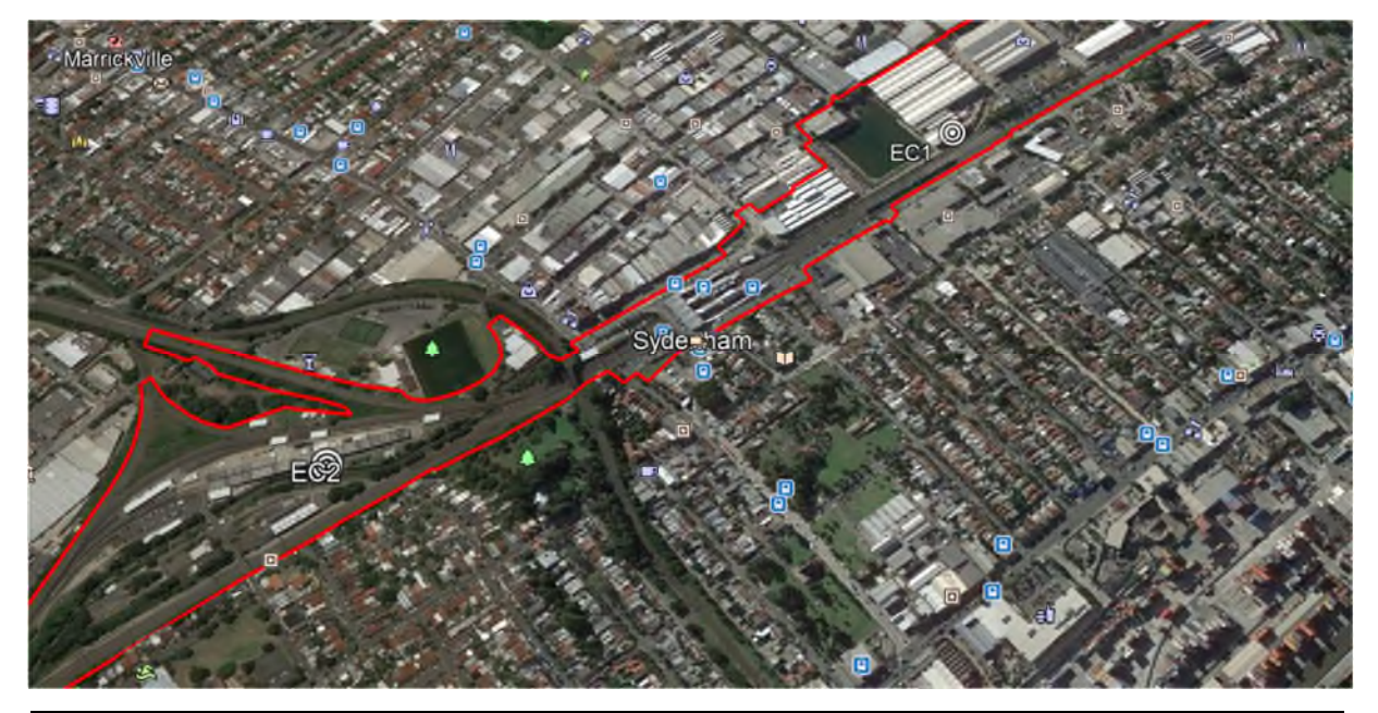
Figure 2 - Surface Water Monitoring Locations

The two locations identified for surface water monitoring are the only locations that offer safe access. There are several other drainage outlets along the length of the Eastern Channel that may convey water into the channel between the upstream and downstream monitoring locations, however gaining access to the channel at these point is not possible due to access and safety reasons.