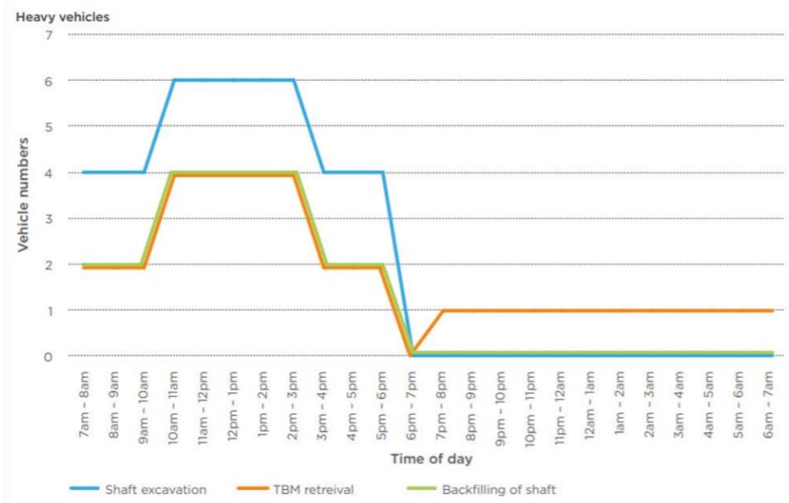
Figure 3 | Blues Point temporary site haulage routes