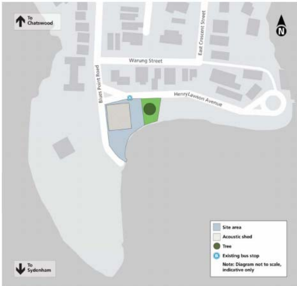
Figure 1 | Blues Point temporary access site