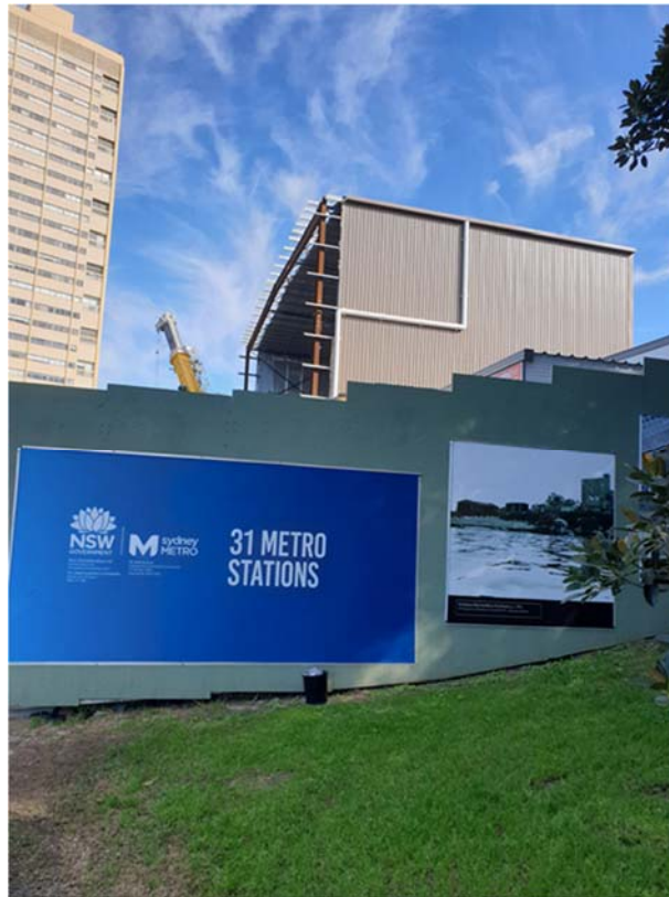
Figure 2 | View of site and acoustic shed from east to west (DPIE Site Visit 6 August 2020)

Following the original approval, a modification (MOD 5) was granted over the site, for work to allow the installation of a temporary acoustic shed ( Figure 2 ) and retrieval of all components of the TBMs from the Chatswood dive site and from Barangaroo through the shaft. The modification was approved on 2 November 2018.