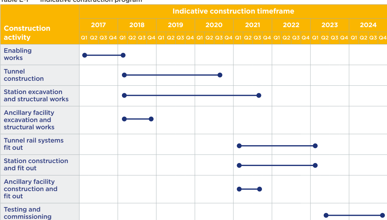
Table E-1 Indicative construction program

Subject to planning approval, construction is expected to start in early 2017 and continue over about six years. This would be followed by testing, commissioning and preparation for operation. Services are expected to start in 2024. An indicative construction program is shown in Table E-1.