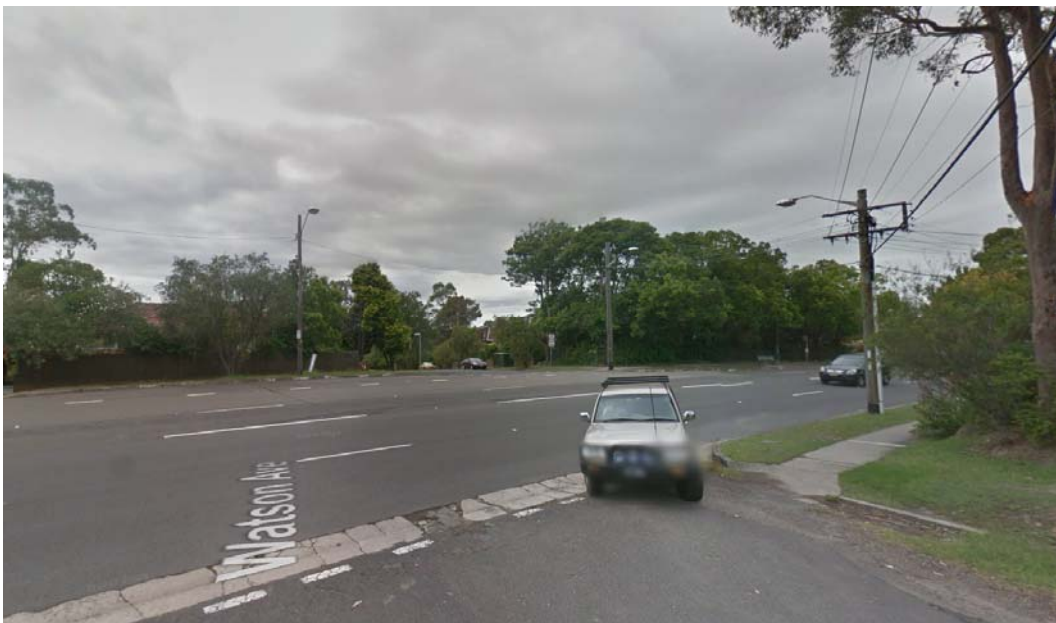
Figure 4 Peats Ferry Road / Watsons Avenue intersection

The two closest intersections providing access to Peats Ferry Road are at Summers Avenue and Watson Avenue. These are both unsignalised intersection which provide for full turning movements. Traffic turning right into Peats Ferry Road must cross two lanes of oncoming traffic (60km/h speed limit). As illustrated in Figure 4, sight lines are partially obstructed for vehicles undertaking this movement. This provides for an unsafe environment. In the opposite direction, vehicles turning right into either of these streets would impact the flow of through traffic on Peats Ferry Road.