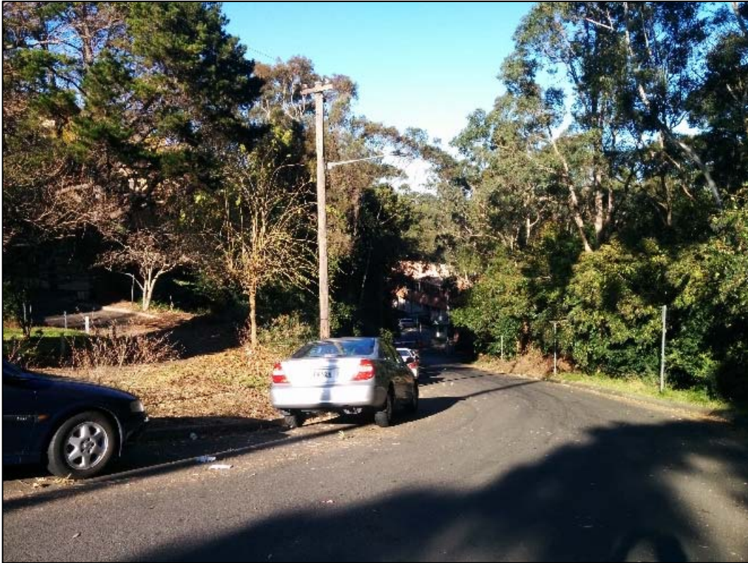
Figure 3 Bridge Road south of Roper Lane