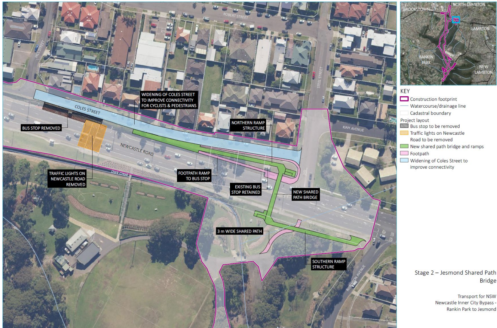
Figure 1-1 Stage 2 Jesmond Shared Path Bridge