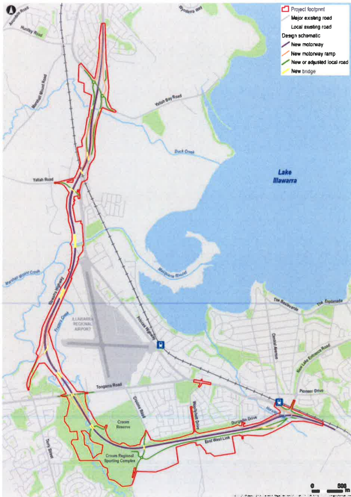
Figure 1 | Approved Project