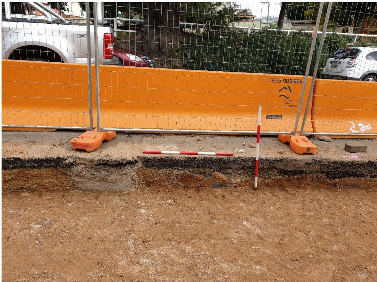
Figure 3 East facing view showing the section below the current alignment of Bridge Street.

As a result of the archaeological works undertaken in parts of Area 1 and Area 2 which lie below Old Bridge Street, it has since been identified that construction of the Bridge Street cutting resulted in a greater degree of impact than had been expected (Figure 3).