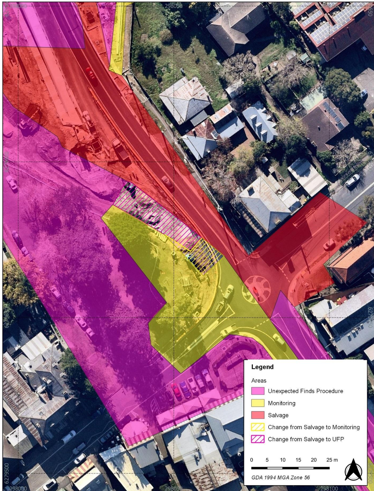
Figure 4 Location of parts of the site proposed to be changed from salvage to monitoring or UFP.