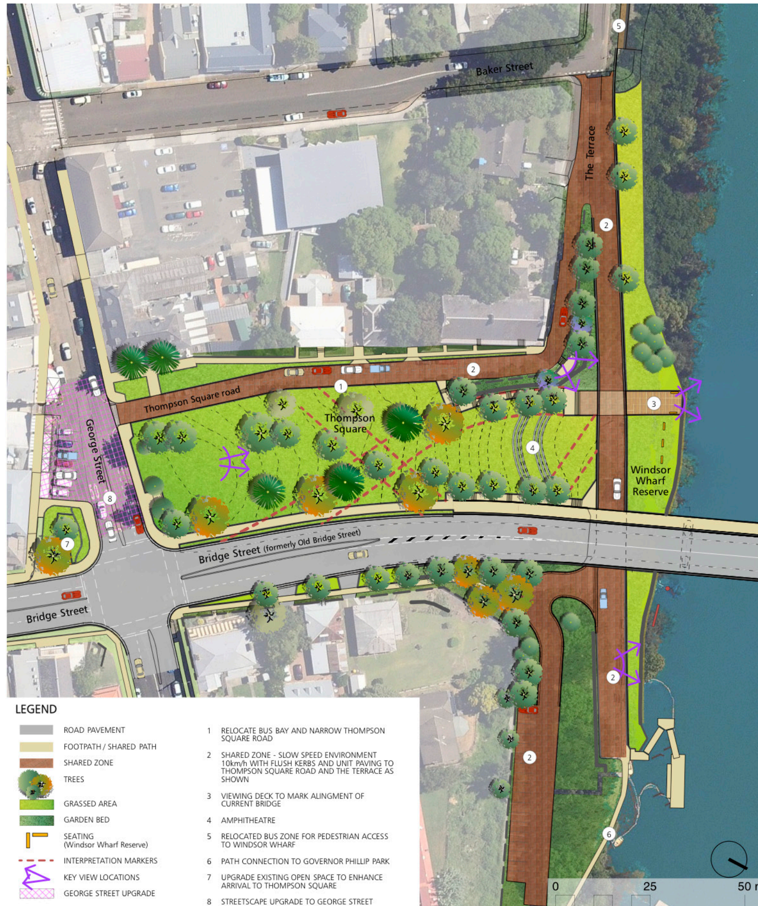
Figure 8.1: Opportunities for further investigation -Thompson Square, river foreshore and adjoining areas.