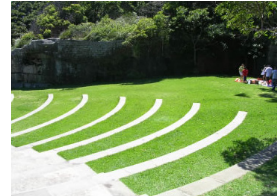
Plate 8.1: Example of grassed amphitheatre and stairs, Bradley's Head, Mosman NSW. This treatment could be utilised in the lower half of Thompson Square providing access down to The Terrace as well as providing for a performance area adjacent to the river.