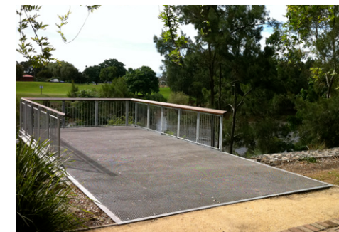
Plate 8.2: Example of viewing deck on the Hawkesbury River (near Kable Street, Windsor). A similar viewing deck could be utilised to mark the alignment of the existing Windsor bridge and provide a location for interpretation of the heritage of the area.