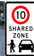
Plate 8.3: The Terrace adjoining Thompson Square road could become a shared pedestrian and slow vehicle speed zone. A similar viewing deck could be utilised to mark the alignment of the existing Windsor bridge and provide a location for interpretation of the heritage of the area.