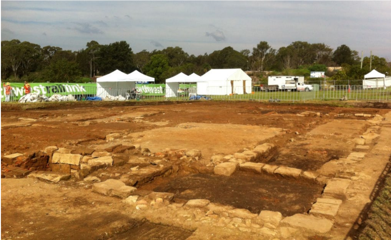
Figure 5 White Hart Inn Excavation Site