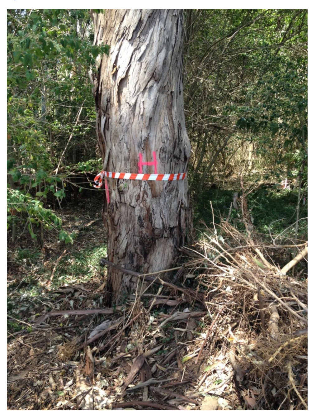
Figure 6 Demarcation of Retained Flora