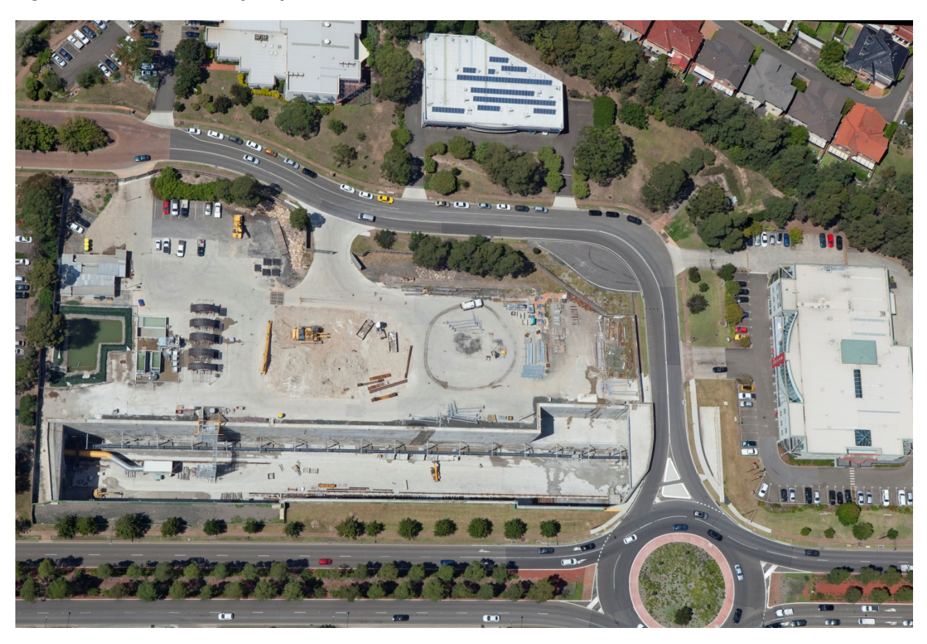
Figure 2 Aerial View of the Sydney Metro Northwest Station Site