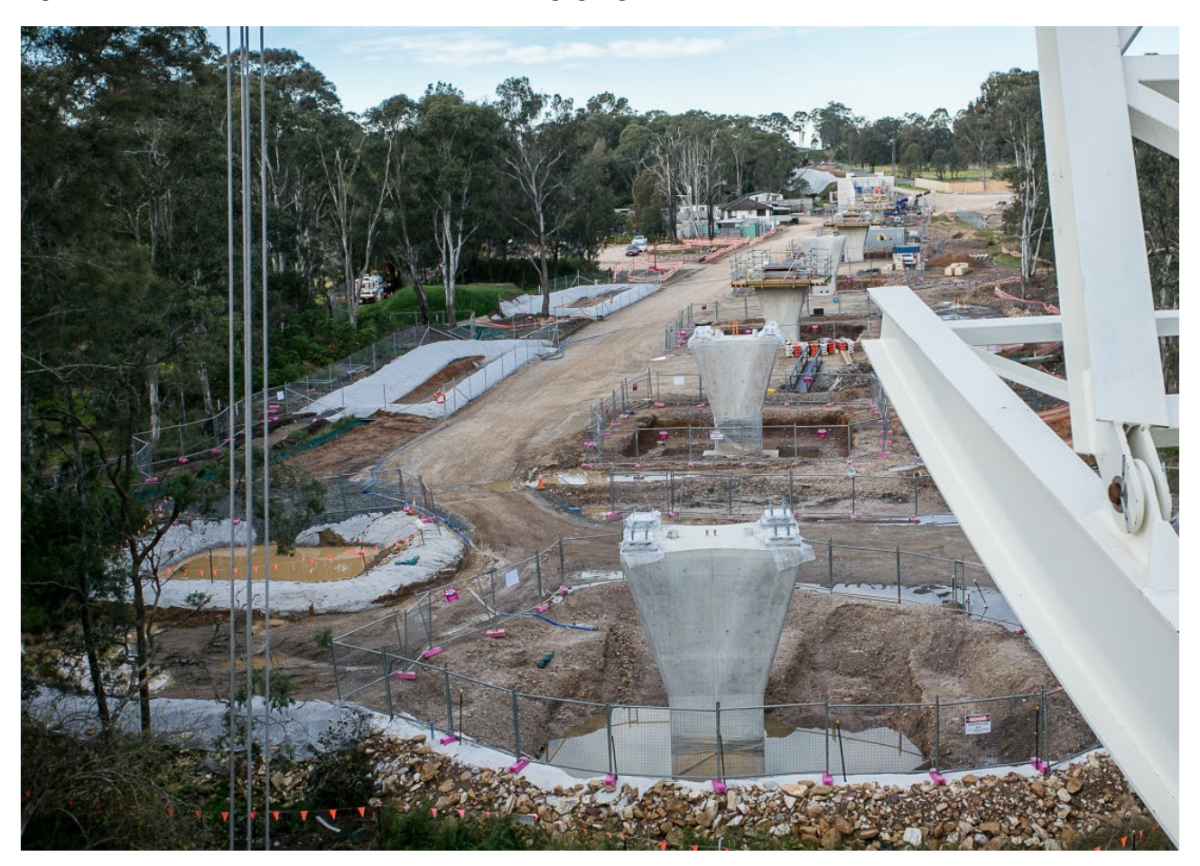
Figure 7 Erosion and Sediment Controls at the Cudgegong Road Site