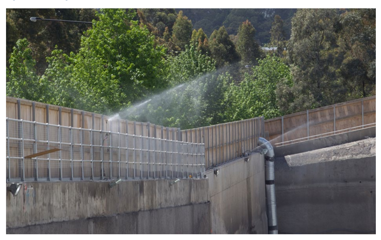
Figure 8 Dust Mitigation at Northwest Station Site