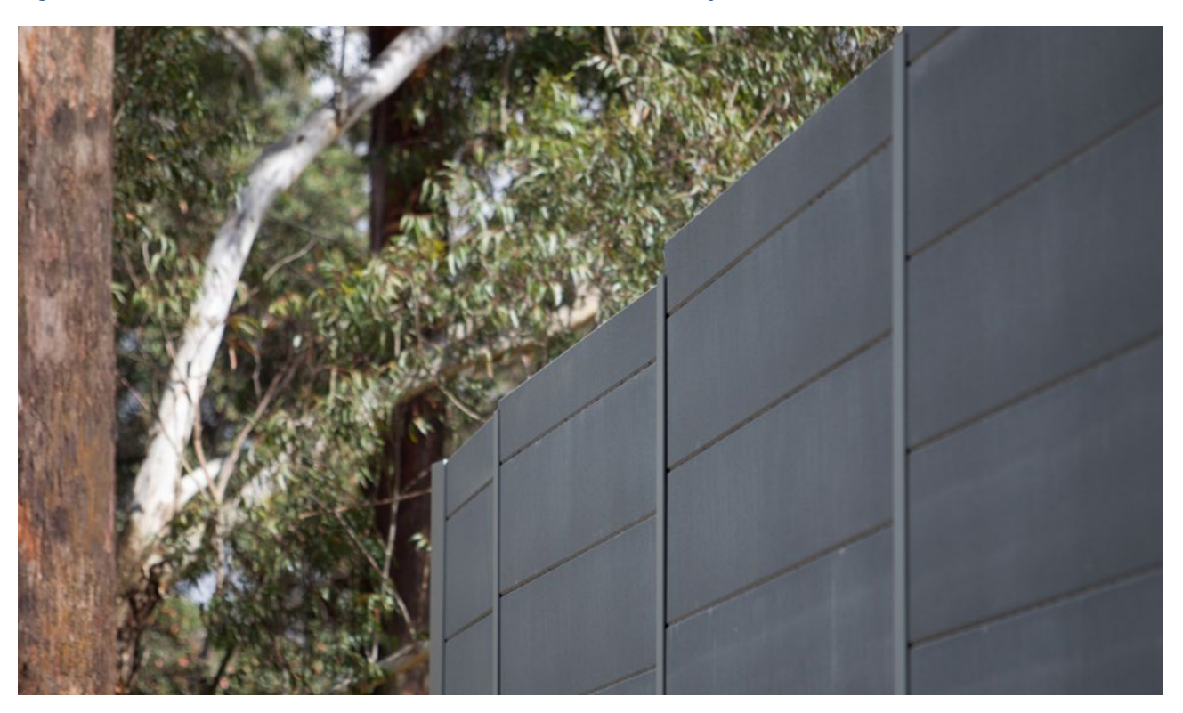
Figure 4 Hebel Wall Noise Barrier at the Cheltenham Services Facility Site