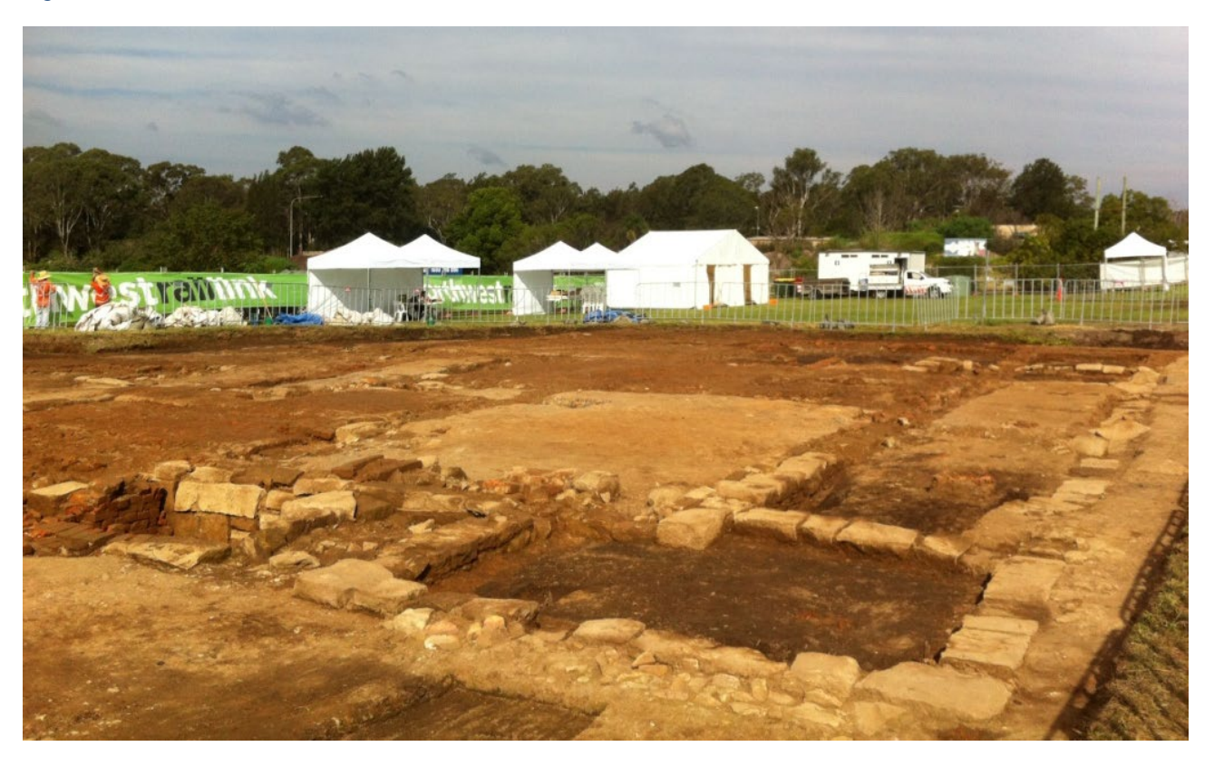
Figure 5 White Hart Inn Excavation Site