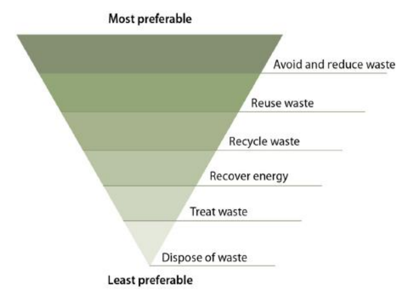
Figure 2 Waste Hierarchy