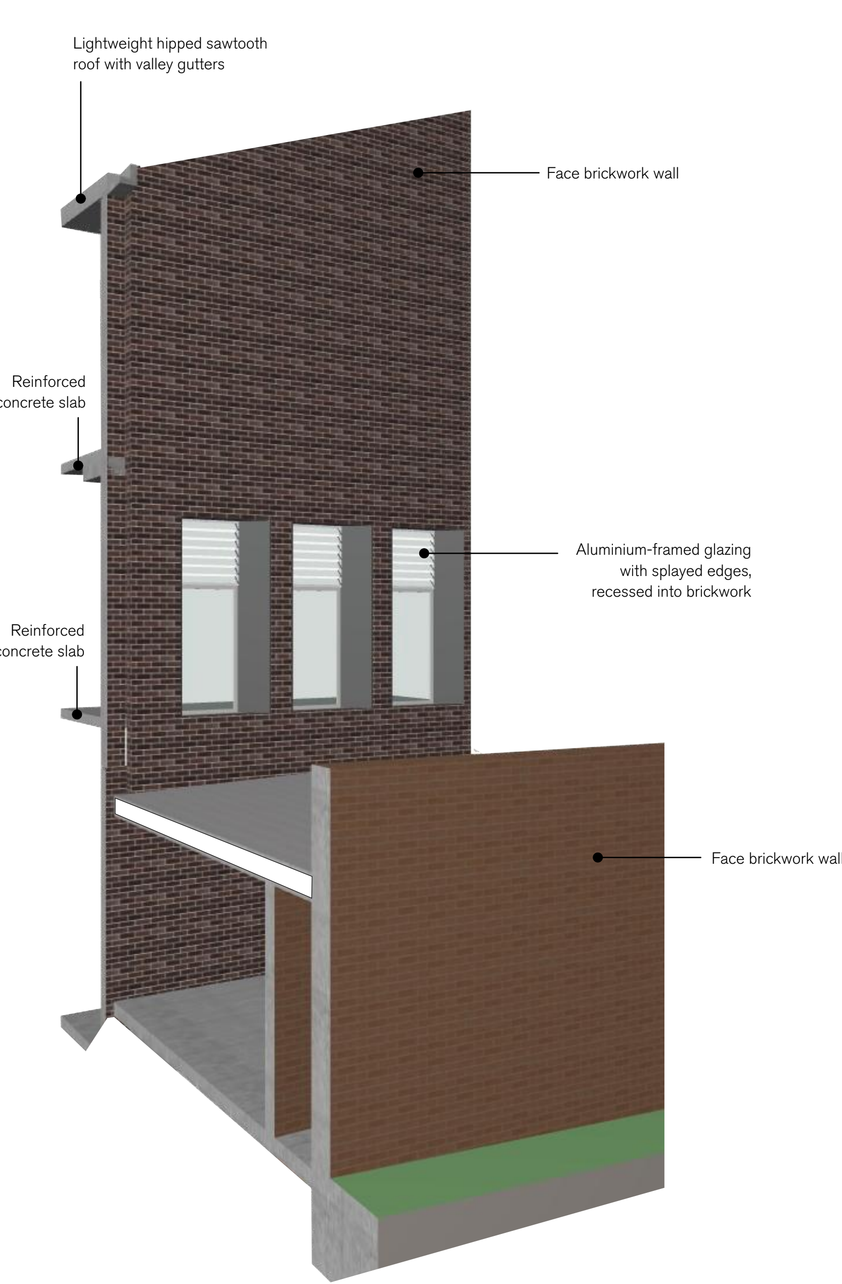
12 Perspective Cutaway FT01, FT02 NTS