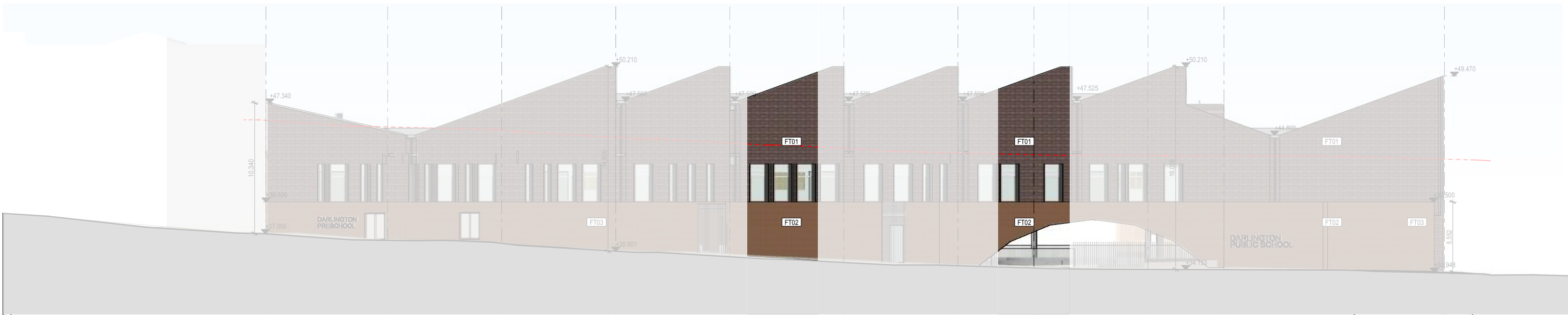
1 ELEVATION Golden Grove St Elevation 1:200 NTS