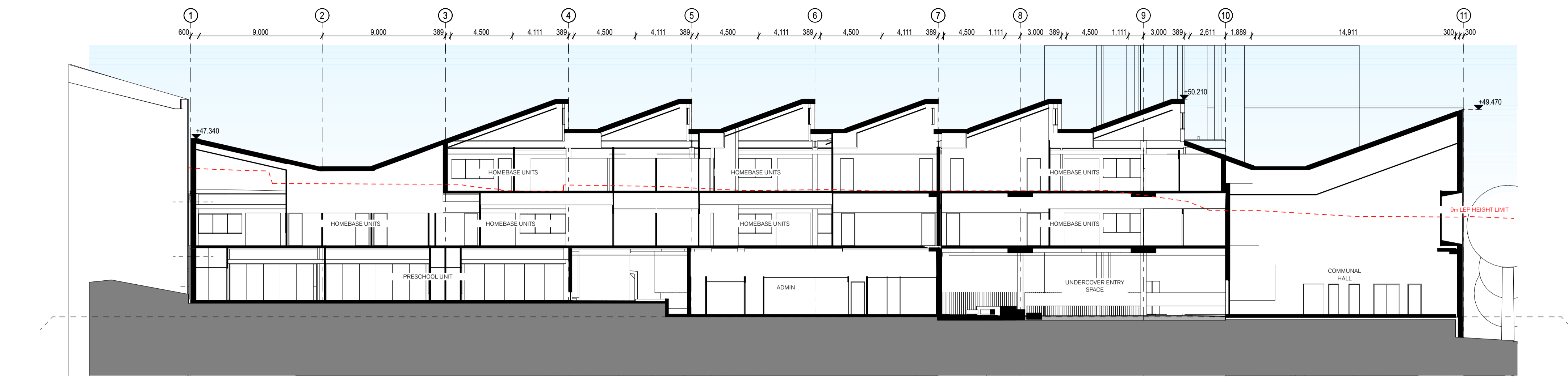
1 SECTION Long Section - Golden Grove St 1:200