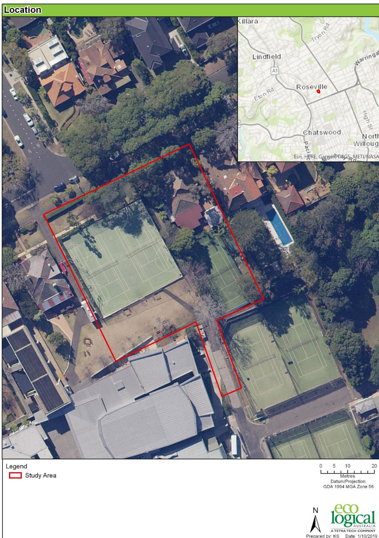
Figure 1: Location of study area.