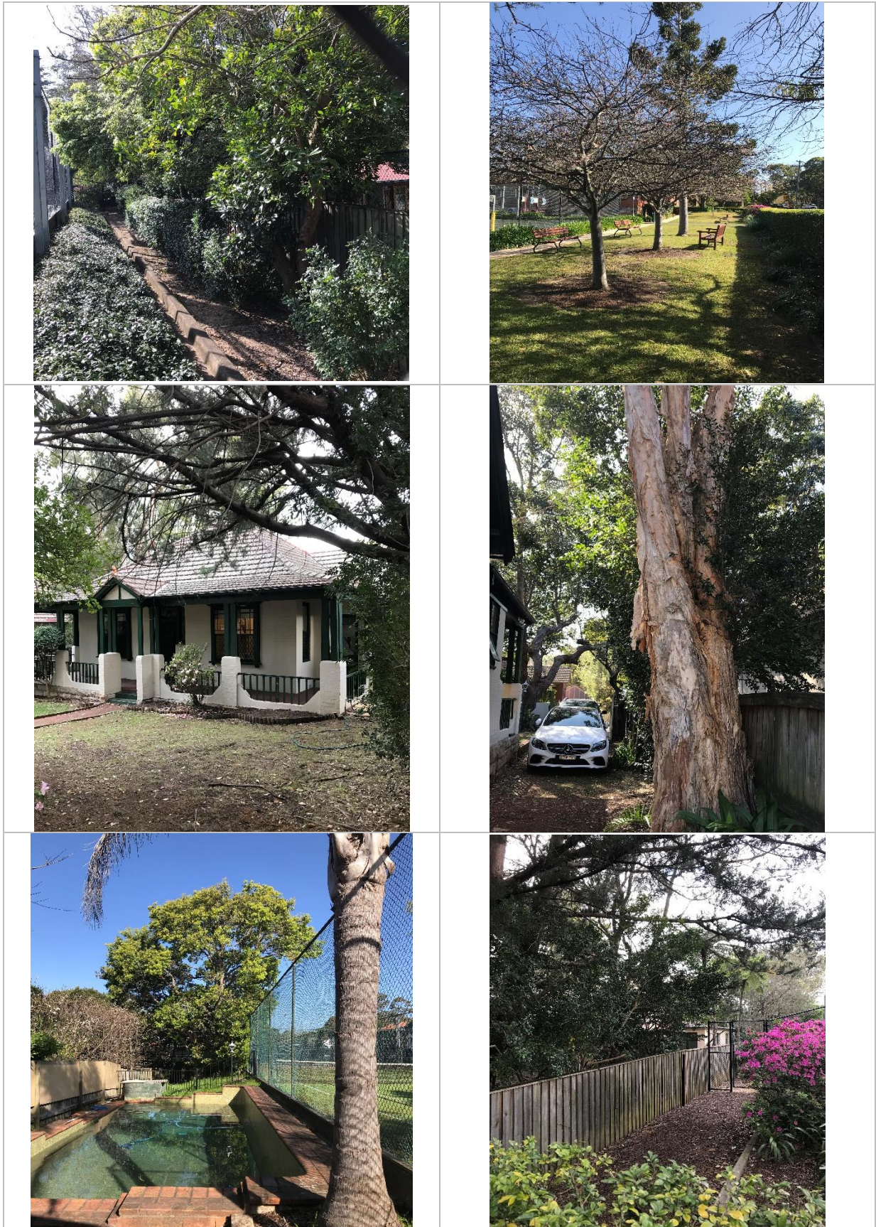
Figure 3: Study area photos