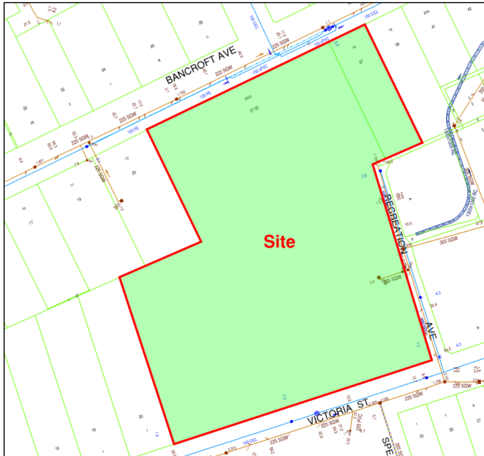
Figure 4 – Sydney Water - Water Mains

The College has Sydney Water water mains available in Victoria Street, Recreation Avenue and Bancroft Avenue as indicated on the Sydney Water information below.