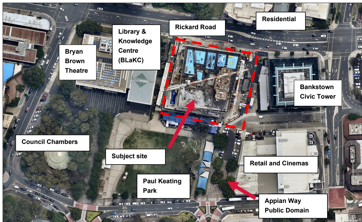
Figure 1 | Local context map

The site has an area of 3,678sqm and has frontages to Rickard Road to the north and The Appian Way to the east ( Figure 1 ). The eastern part of the site includes a right-of-way and serves as an extension of The Appian Way public domain.