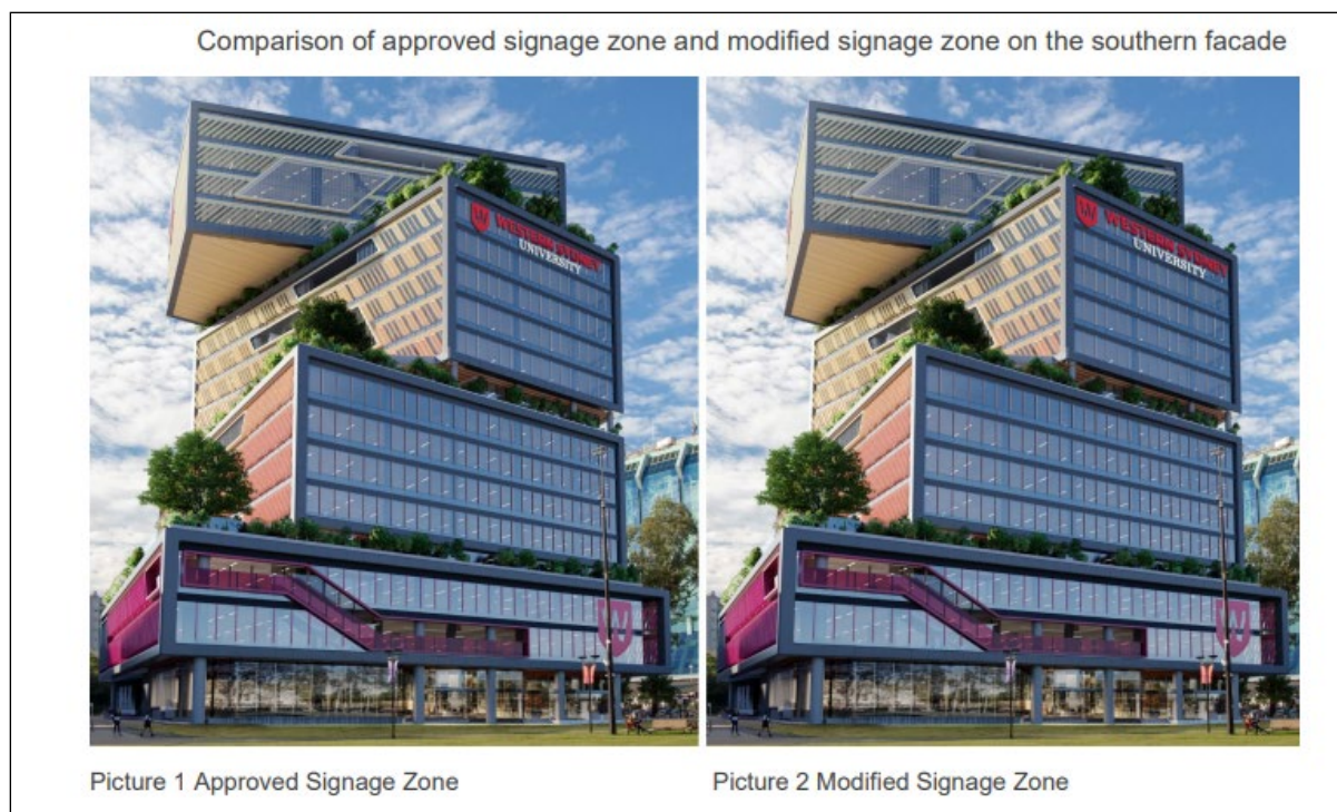
Figure 4 | Indicative southern elevation signage (Source: SSD-9831-Mod-2)

While Council questioned the need for this increase, given the building would be highly visible in the Bankstown CBD when completed, the Applicant has provided a number of the photomontages which satisfactorily demonstrate that the signage increase will not result in excessive visual impacts. Despite the size increase, Figure 4 demonstrates that the increase will not result in future signage that will be significantly different from the original approval when taking into account the existing vistas to the building and the scale of the approved WSU building. The proposed enlarged signage zone remains consistent with the original design and visual impact analysis conducted as a part of the original SSD application, which was supported by the Department. The application remains compliant with the Schedule 5 (assessment criteria for signage) of State Environmental Planning Policy (Industry and Employment) 2021 and does not result in additional visual impact.