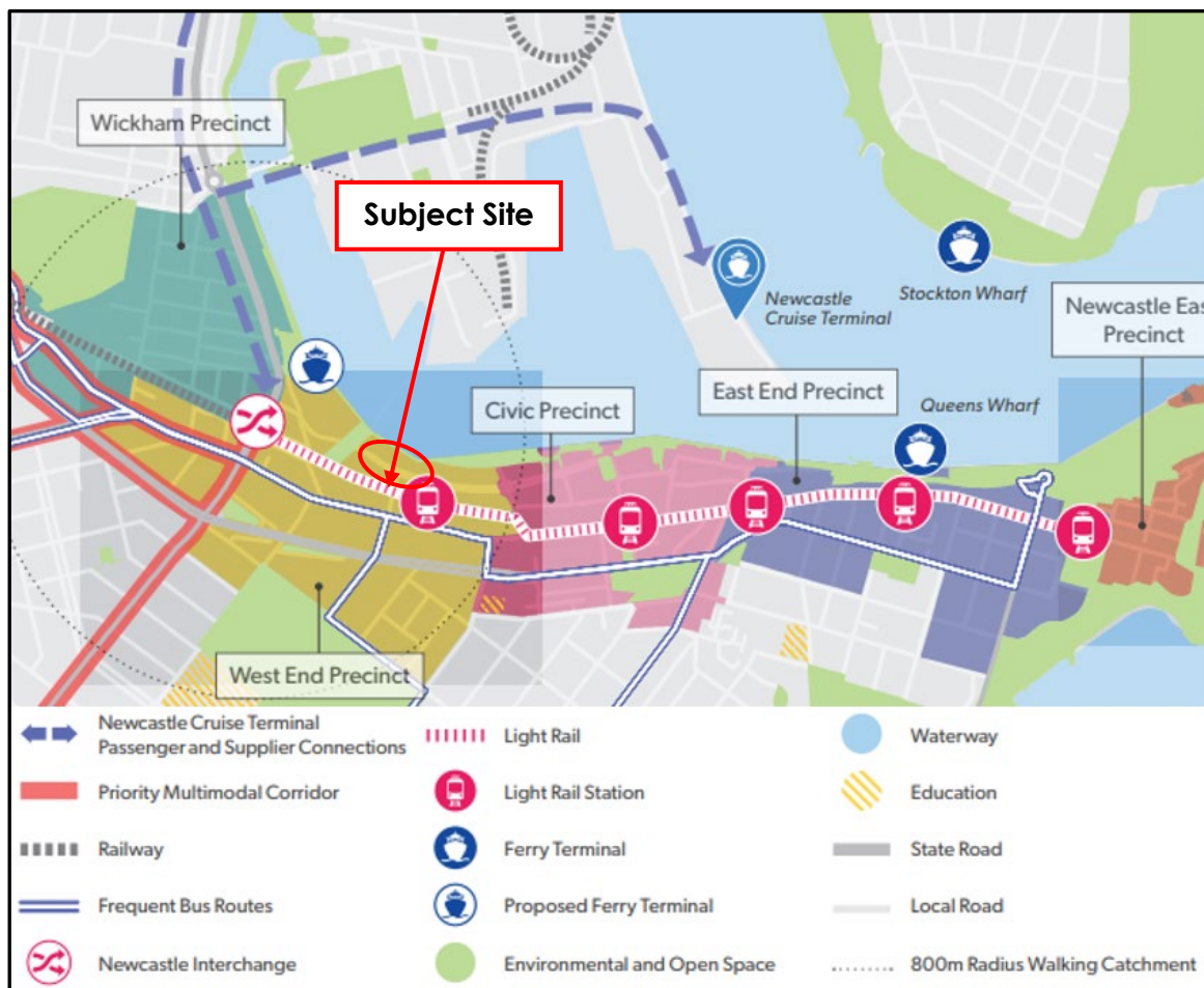
Figure 2: Extract from the Greater Newcastle Metropolitan Plan 2036.

The approved development is consistent with the relevant strategies and actions detailed in the GNMP and the proposed modification will further enhance the overall development.