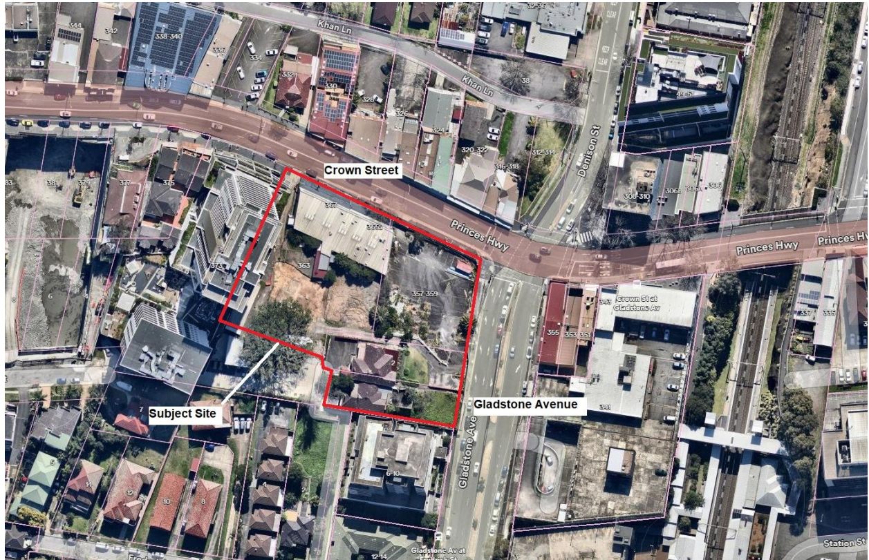
Figure 1 Aerial image showing site and surrounding area

An aerial of the site is provided in Figure 1 .