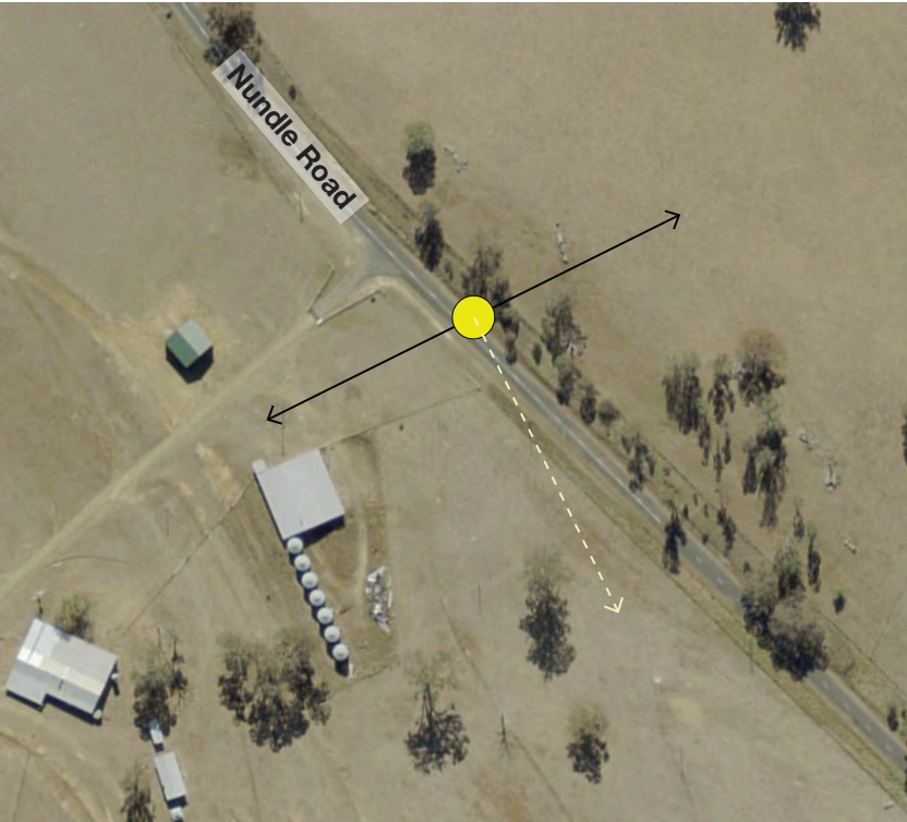
Figure D1A Photomontage 01 (HOG22) Location and Viewing Direction