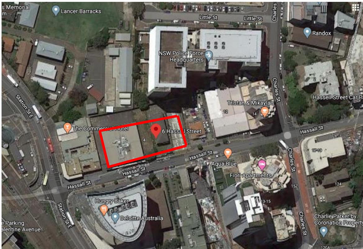
Figure 1 Site Location & Aerial Photograph

The project is located at 2-6 Hassall Street Parramatta, is bounded by commercial properties (east and west), Hassall St (south) and NSW Police Force Headquarters (north) shown in red in Figure 1.