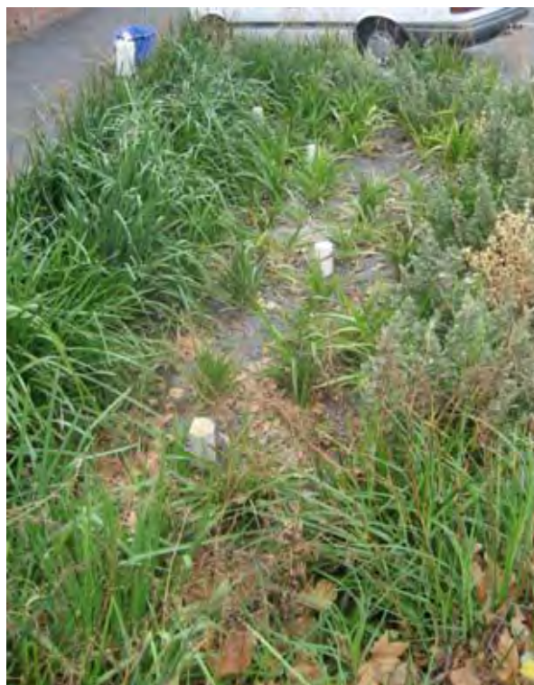
Figure 1. Spatially distributed monitoring points

For bioretention systems with a surface area less than 50 m 2 , in situ hydraulic conductivity testing should be conducted at three points that are spatially distributed (Figure 1). For systems with a surface area greater than 50 m 2 , an extra monitoring point should be added for every additional 100 m 2 . It is essential that the monitoring point is flat and level. Vegetation should not be included in monitoring points.