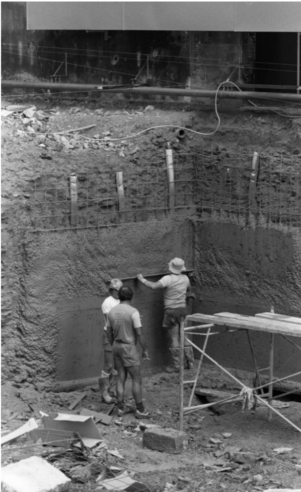
Figure 5. Photo from construction of the Still Addition basement in 1988, showing deep excavation of the concrete shell of the basement into existing sandstone bedrock.