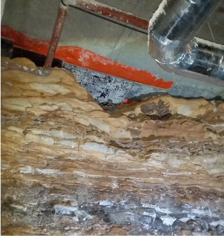
Figure 4. Photo from the site inspection of 16/1/19 from the plant room adjacent and below the current Still Additional basement, showing that the basement concrete slab (top of frame) currently rests on cut sandstone bedrock.