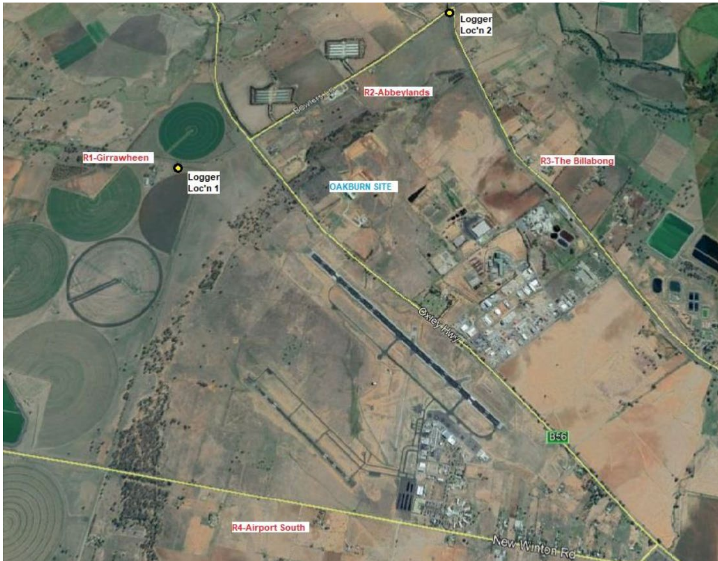
Figure 2: Sensitive receivers