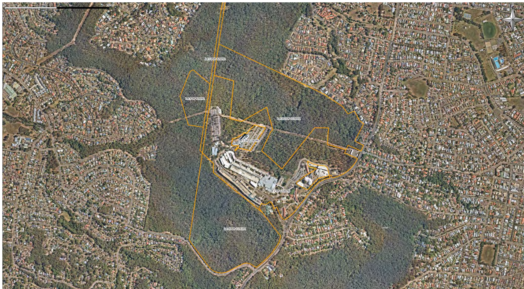
Figure 1 Lot boundaries relevant to the proposed works.