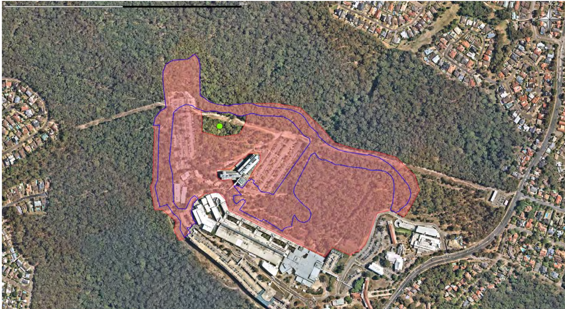
Figure 2 The current proposed works footprint is shown in blue (subject to change). Shown in red is the maximum area that may be subject to impact through changes to the proposed works footprint. The approximate location of the Yallarwah memorial is shown by the green marker, with a minimum 25 metre buffer to be established around this marker to ensure no disturbance occurs during the project.