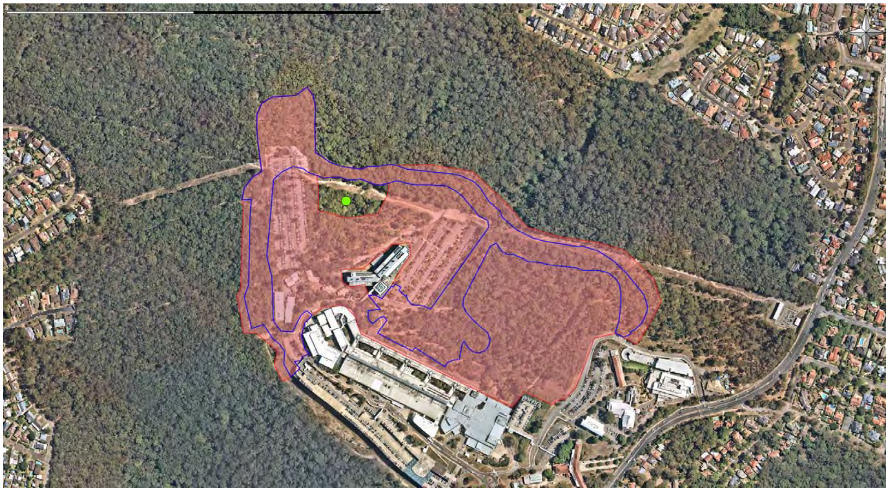
Figure 2 The current proposed works footprint is shown in blue (subject to change). Shown in red is the maximum area that may be subject to impact through changes to the proposed works footprint. The approximate location of the Yallarwah memorial is shown by the green marker, with a minimum 25 metre buffer to be established around this marker to ensure no disturbance occurs during the project.