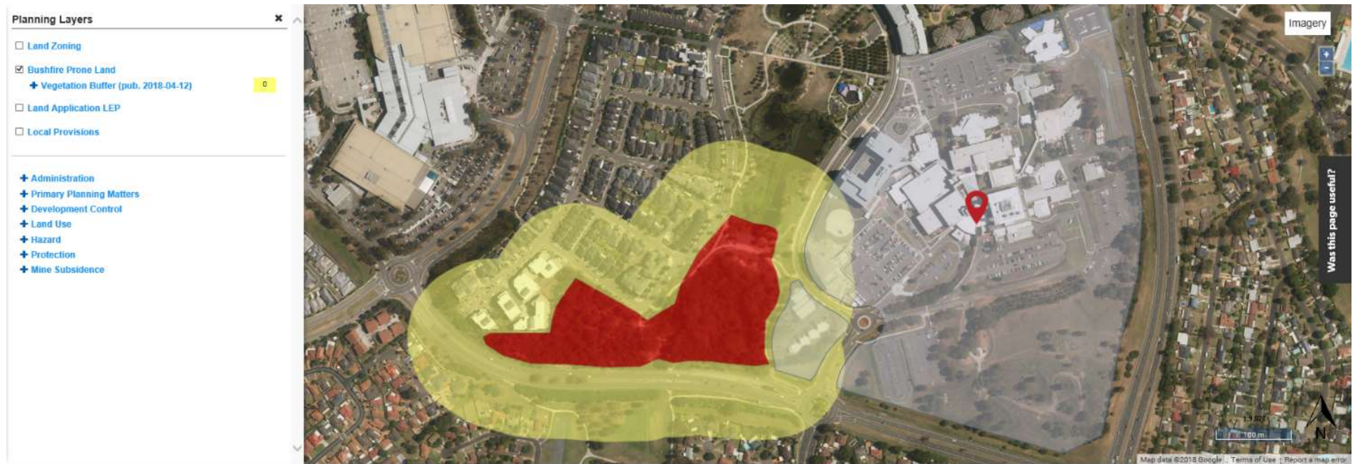
Figure 2 Bush Fire Prone Land Map (pub:12/4/2018) – Lot 6: DP1058047 – Therry Road Campbelltown 2560