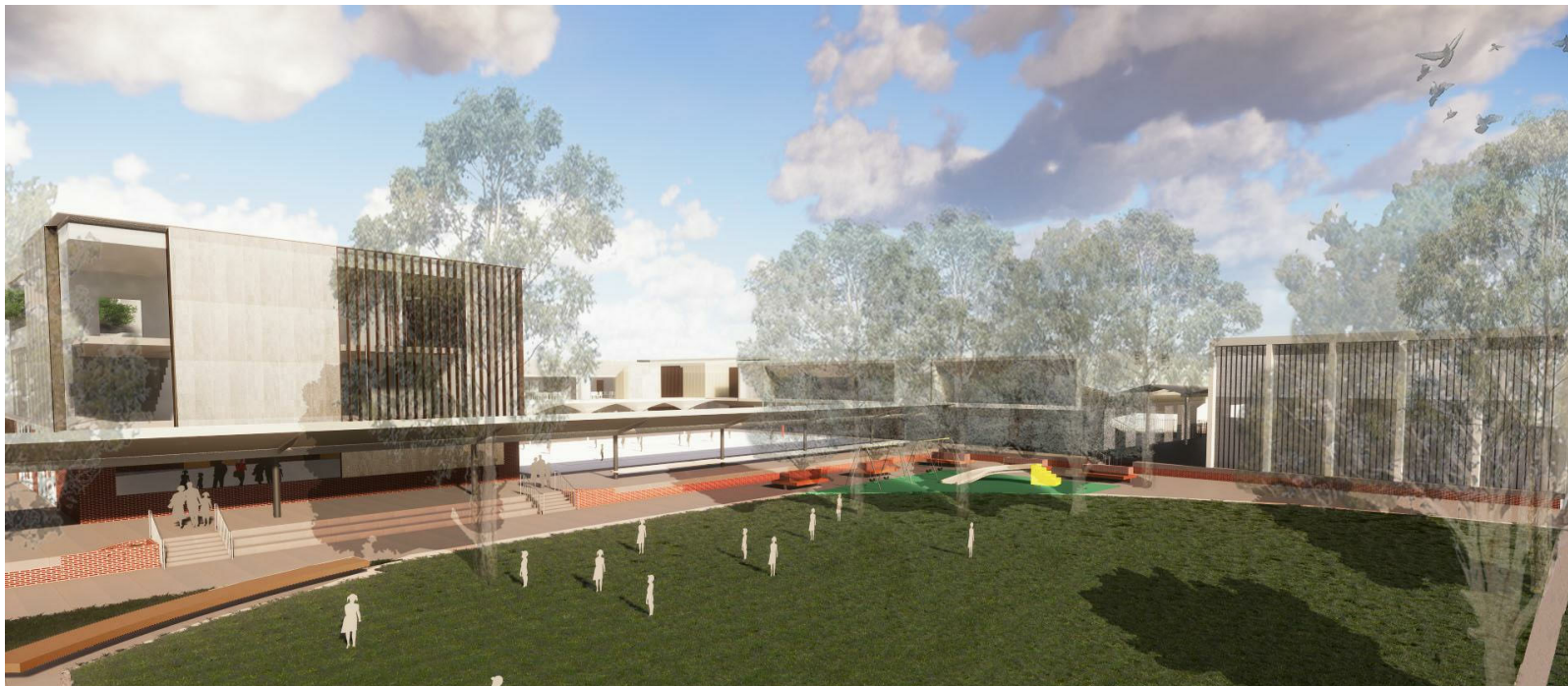
2 PLAY FIELD LOOKING SOUTH DA - 900 NTS