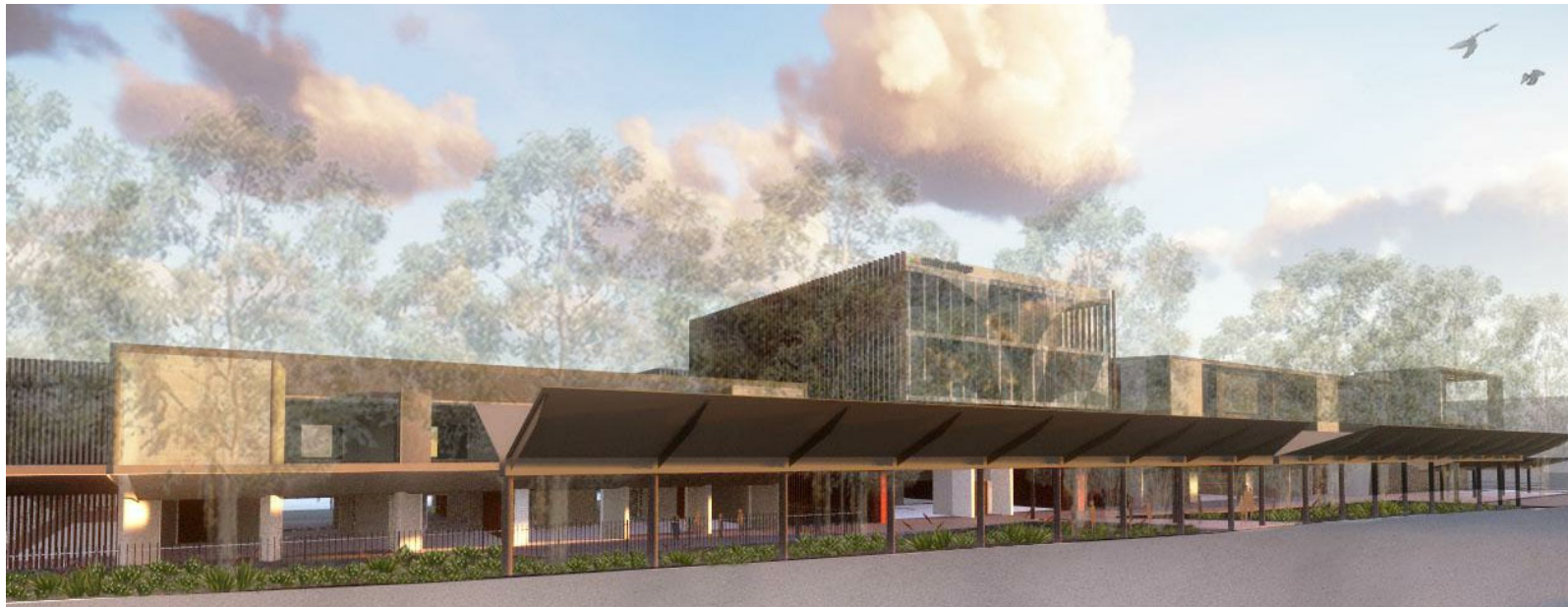
1 BYRON ROAD LOOKING NORTH DA - 900 NTS