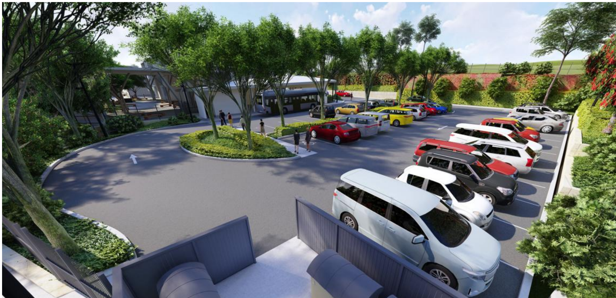
Perspective View of Staff Car Park