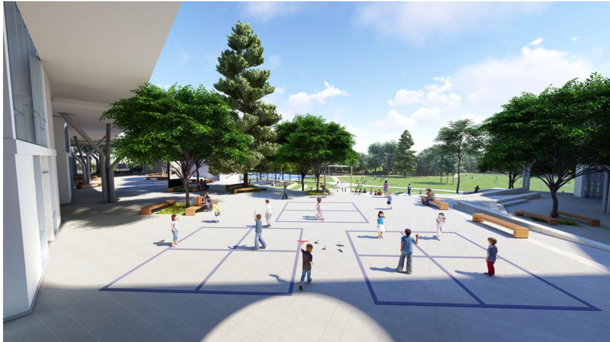
Perspective View of Civic Heart Looking West