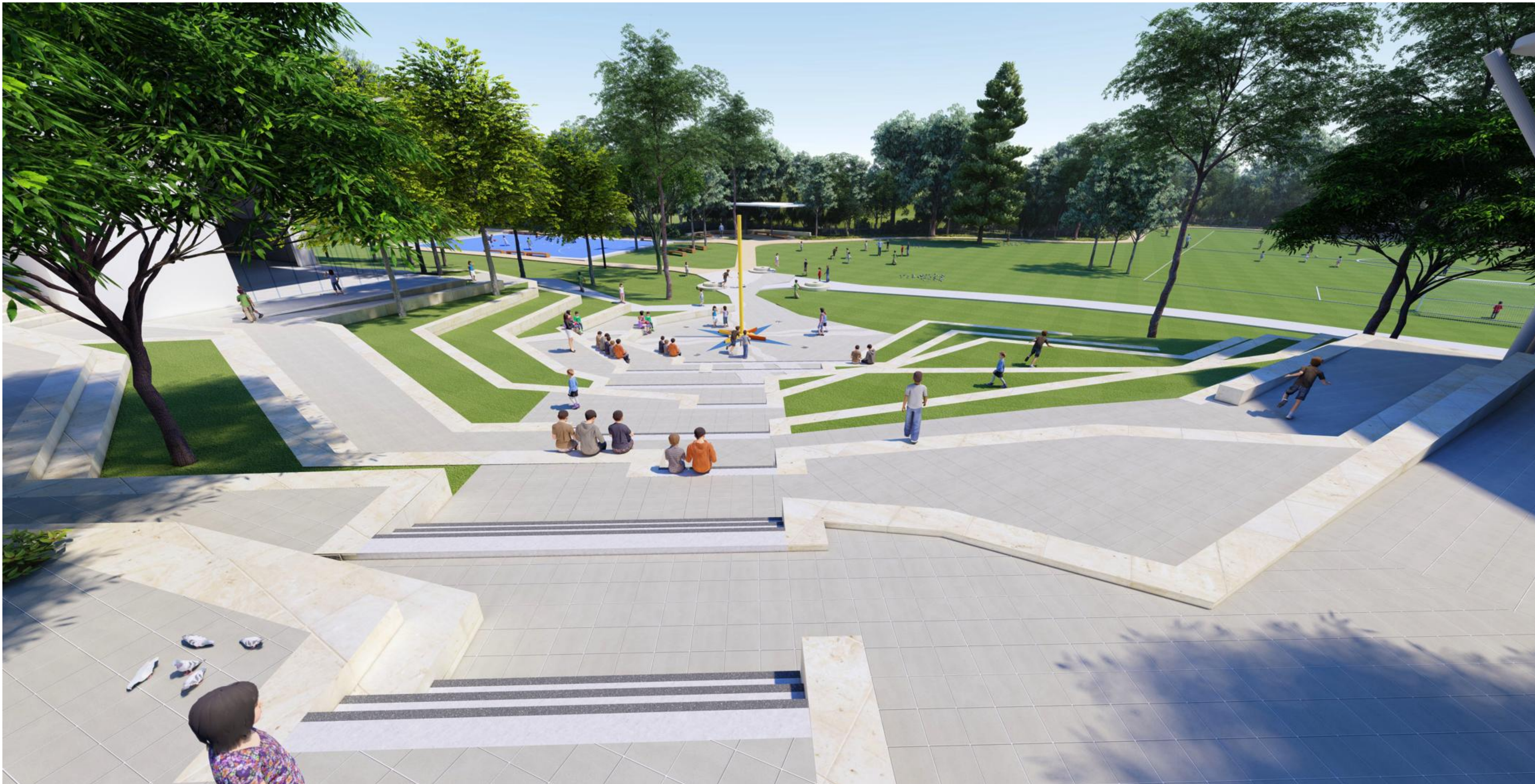
Perspective View of Sundial Plaza and Civic Heart