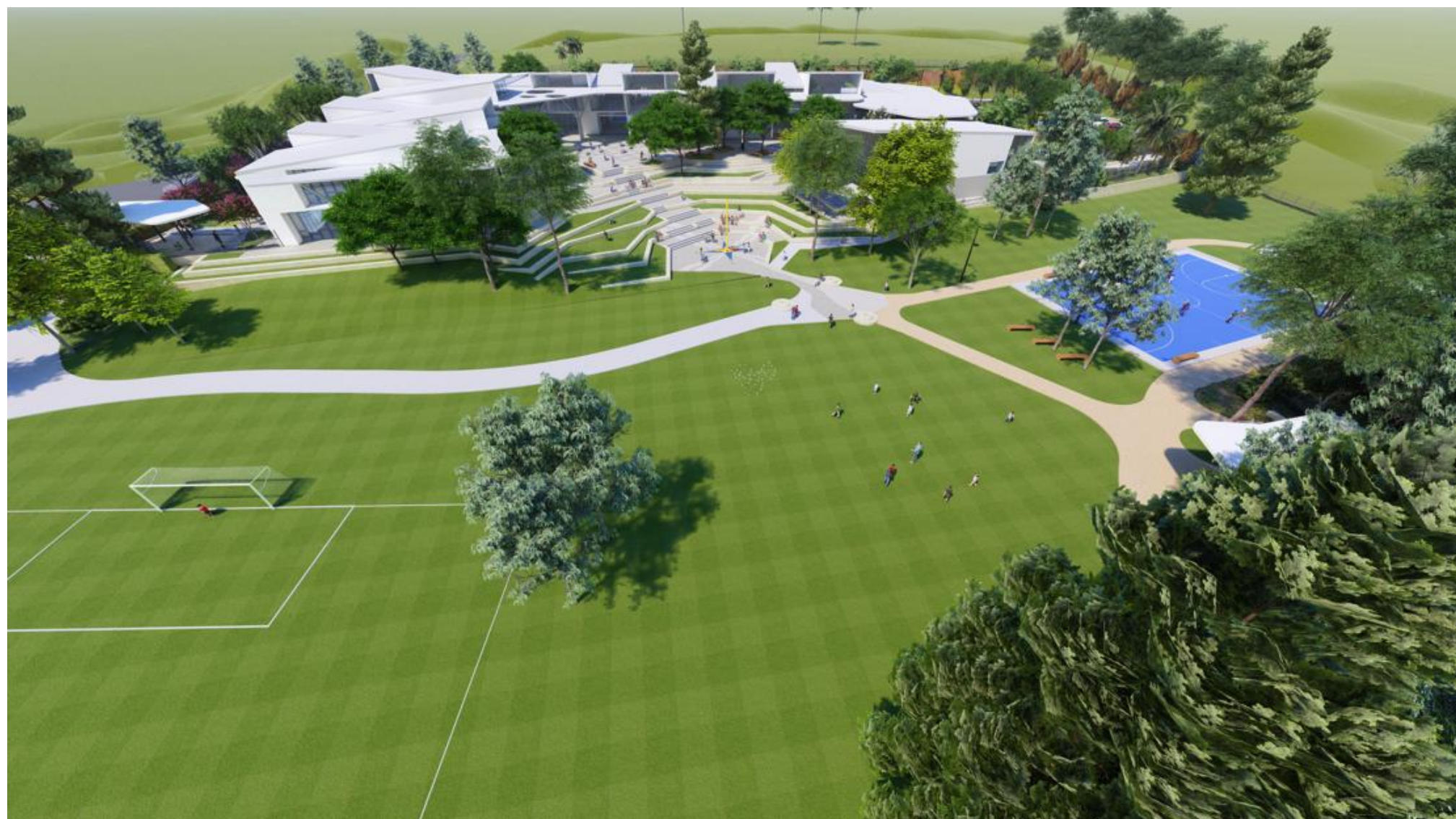
Perspective Overview of Sundial Plaza and Civic Heart