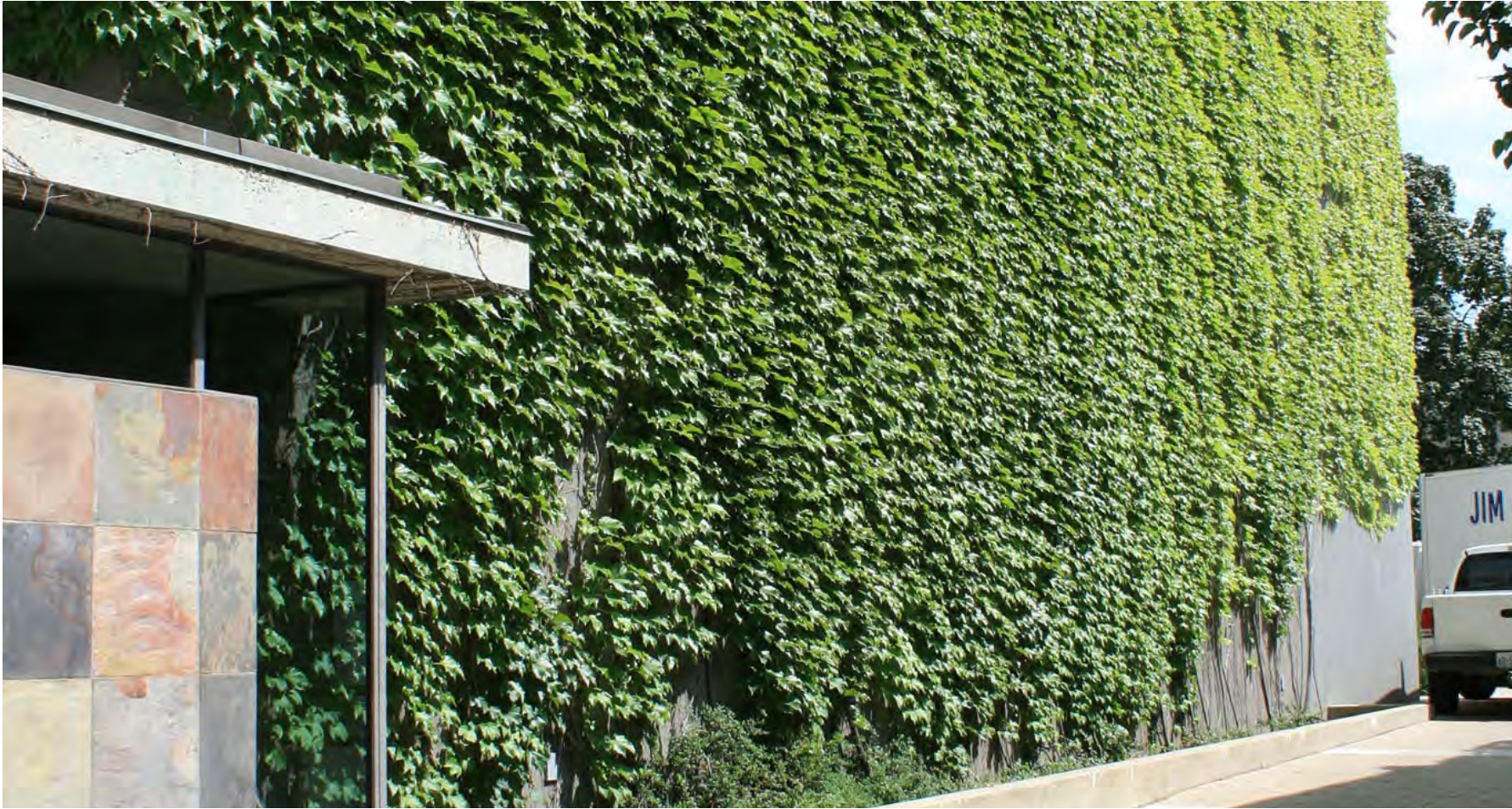
Character of vine covered vertical wall, as proposed for the driveway walling