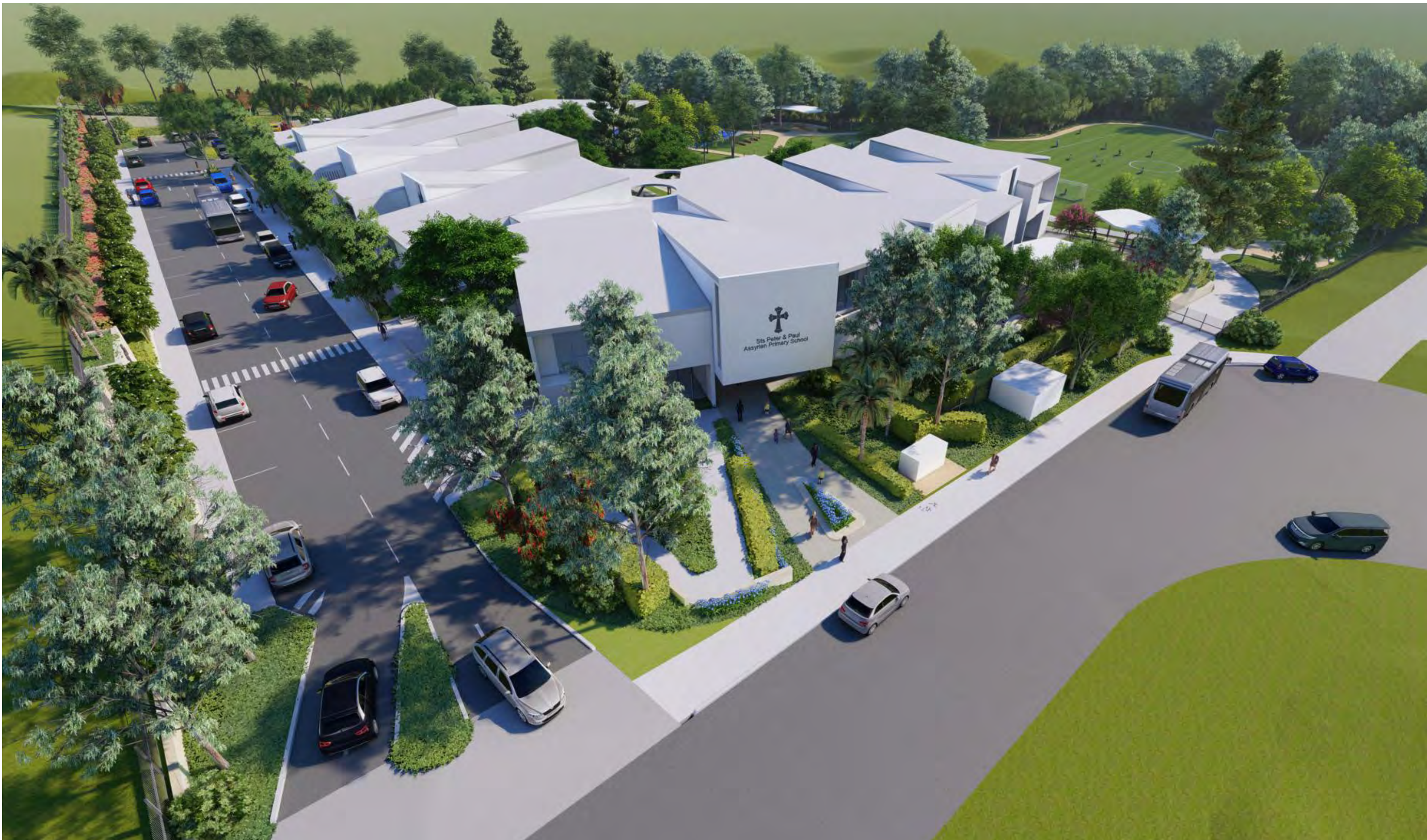
Perspective Overview of School from Kosovich Place