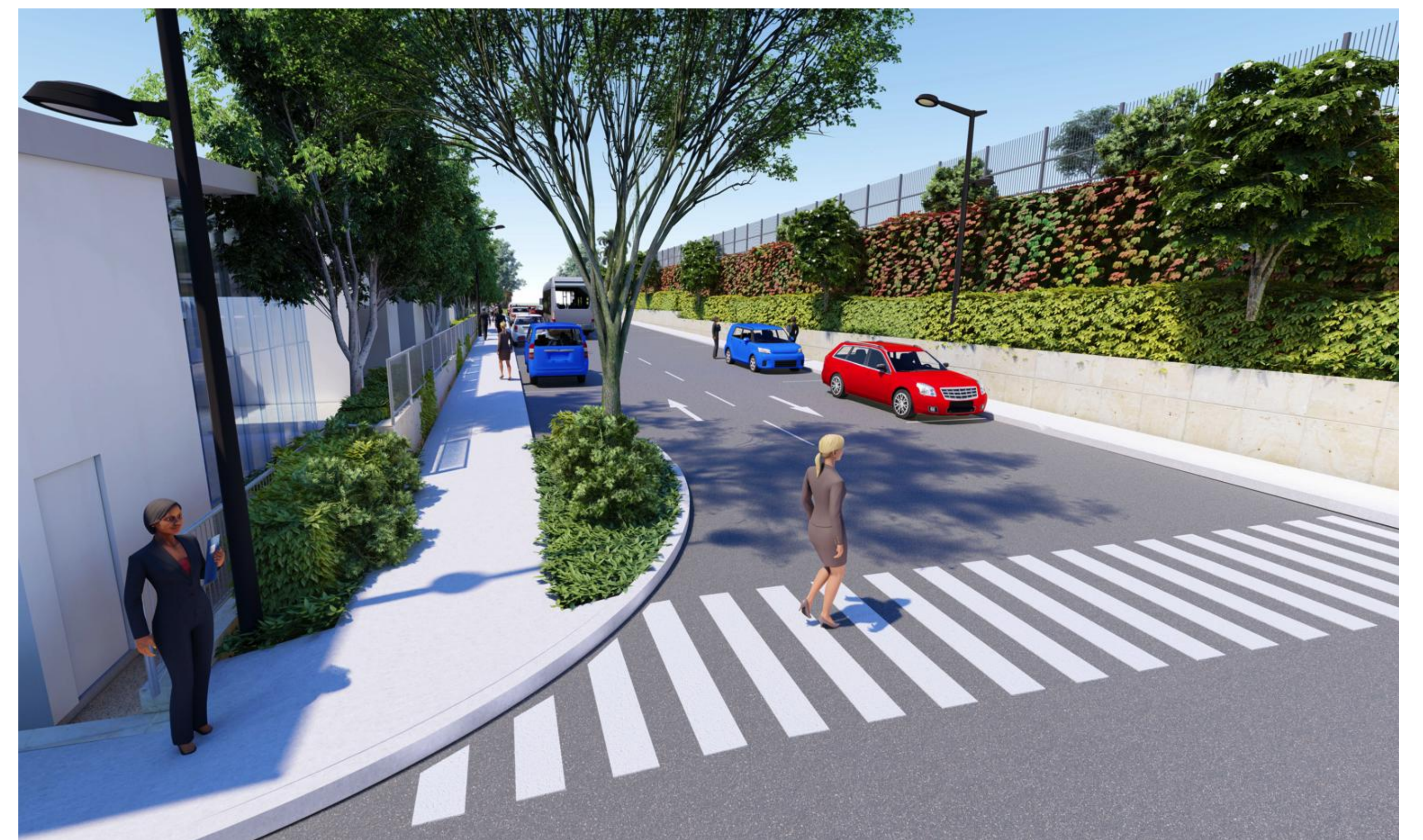
Perspective View Along Driveway Looking North From Staff Carpark