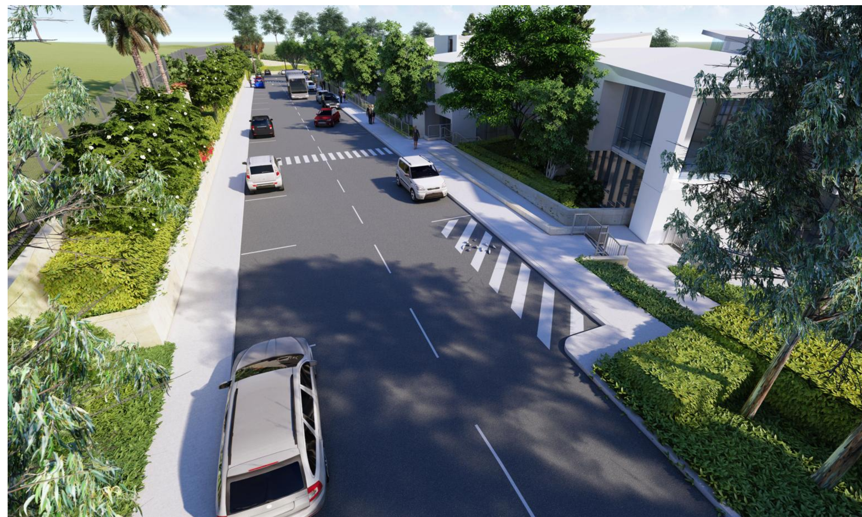
Perspective View Along Driveway Looking South