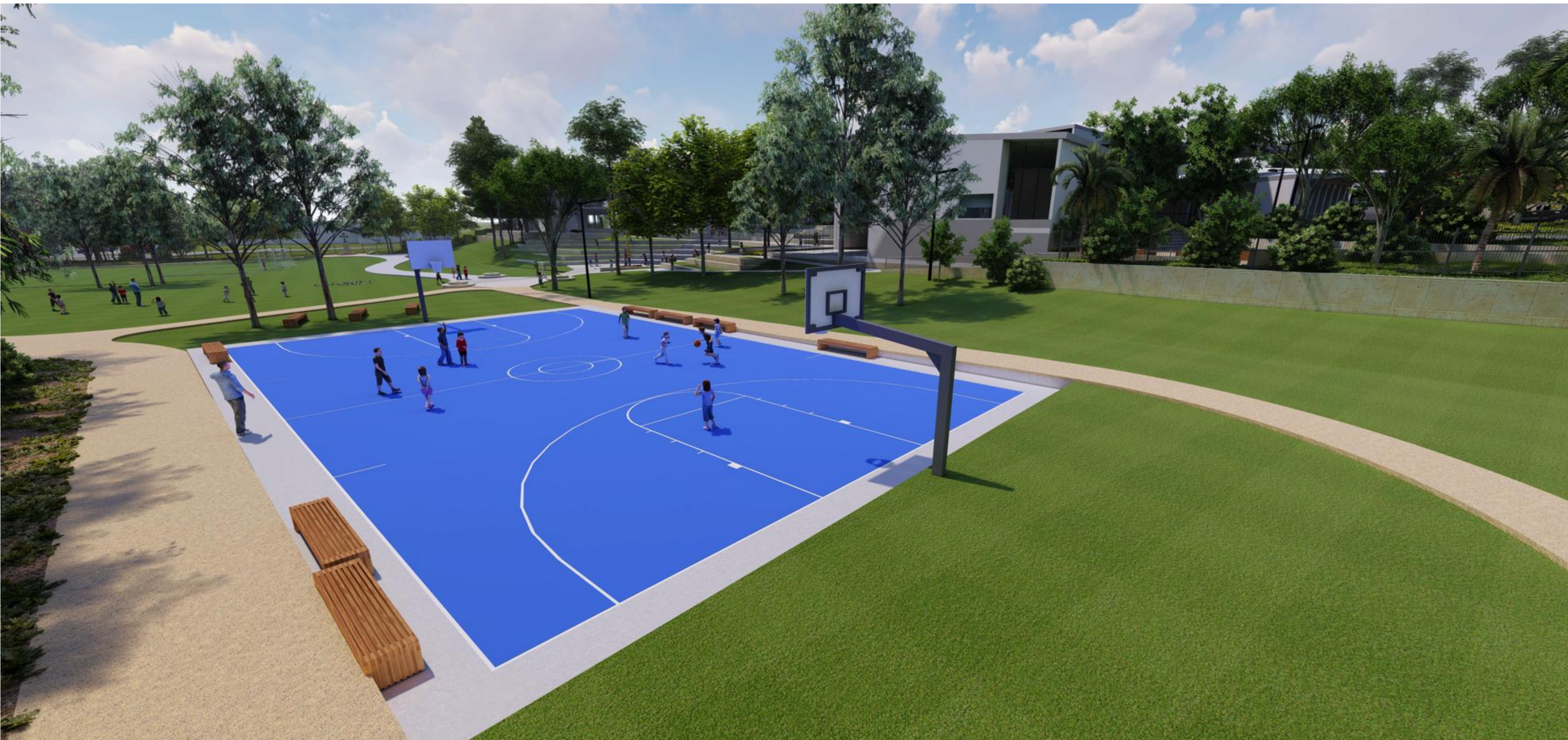
Perspective View From Southern Lower Play Area