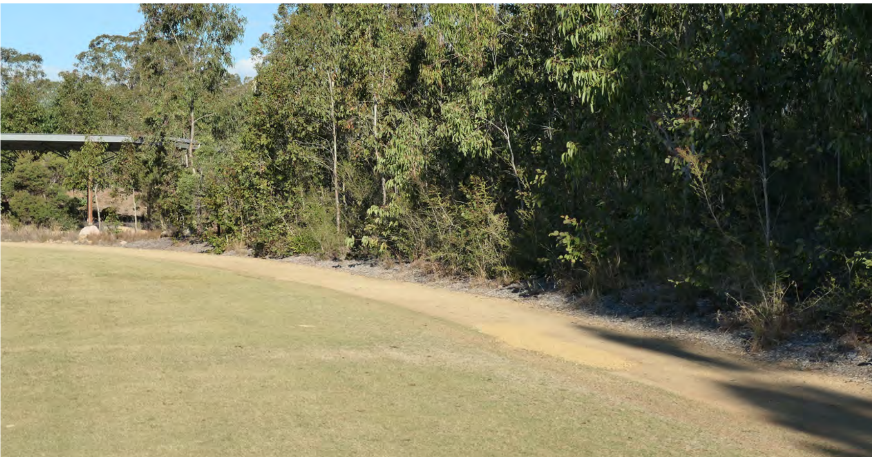
Character of lower oval to revegetation area using decomposed granite pathway delineation