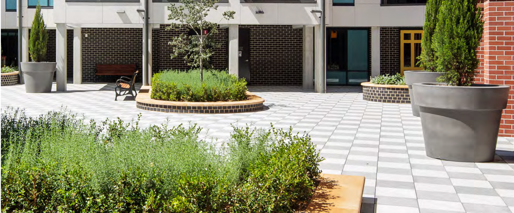
Character of unit paving to Civic Heart