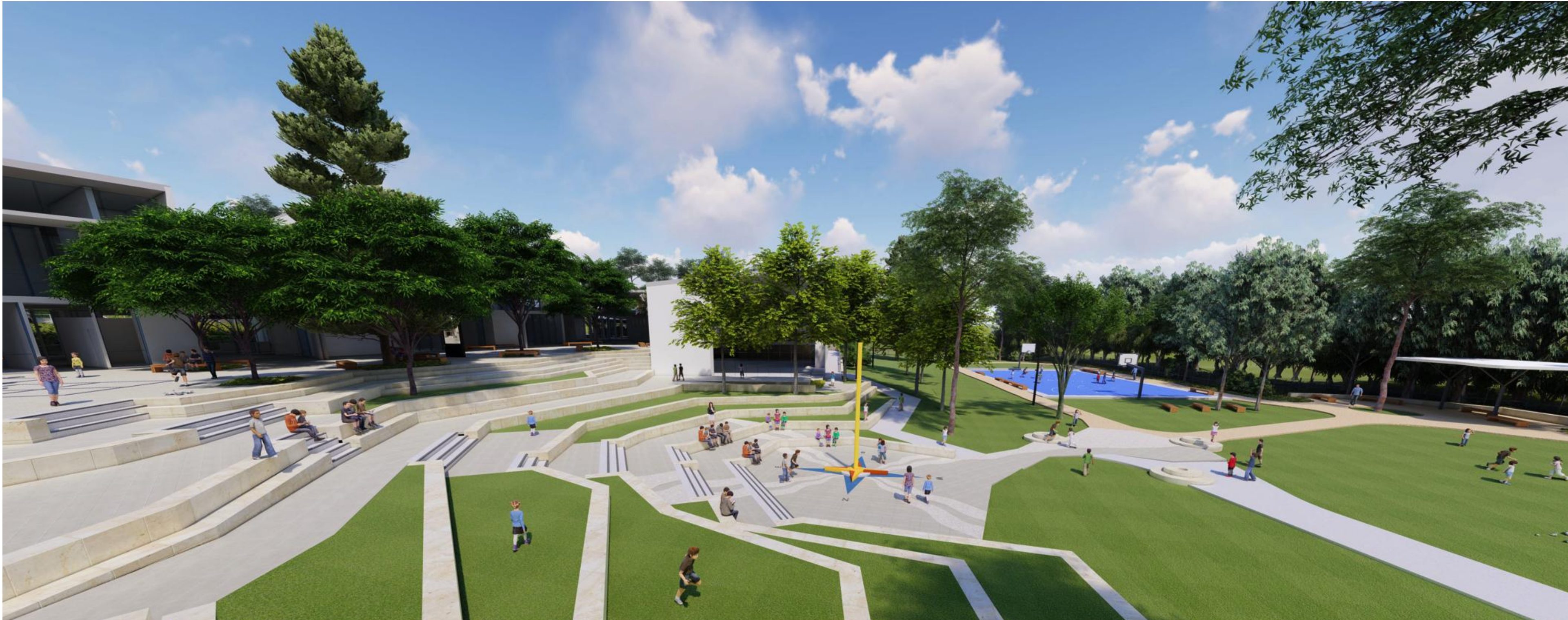
Perspective View of Sundial Plaza and Civic Heart Looking South Towards Hall