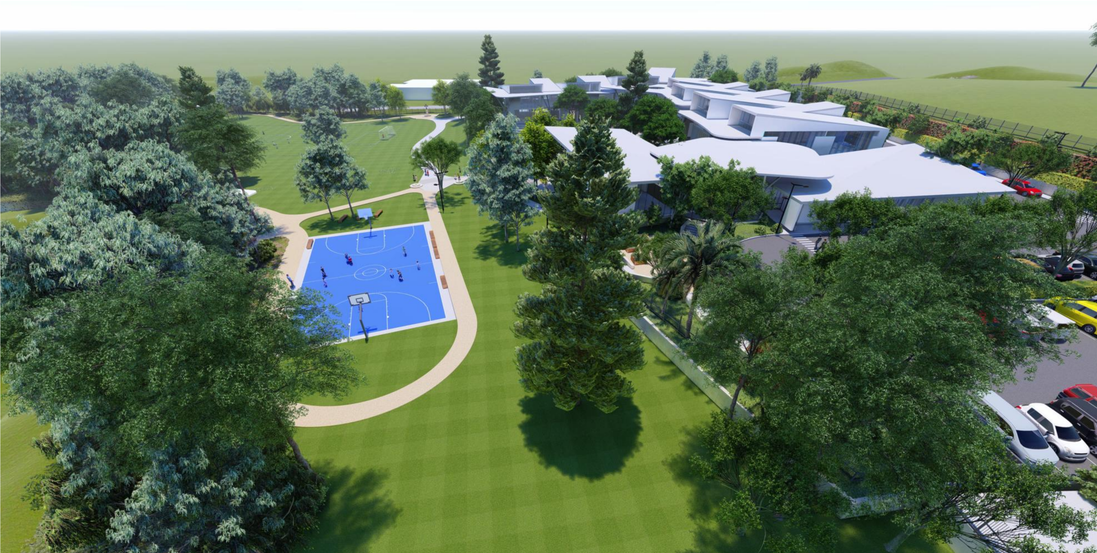
Perspective Overview of School from South