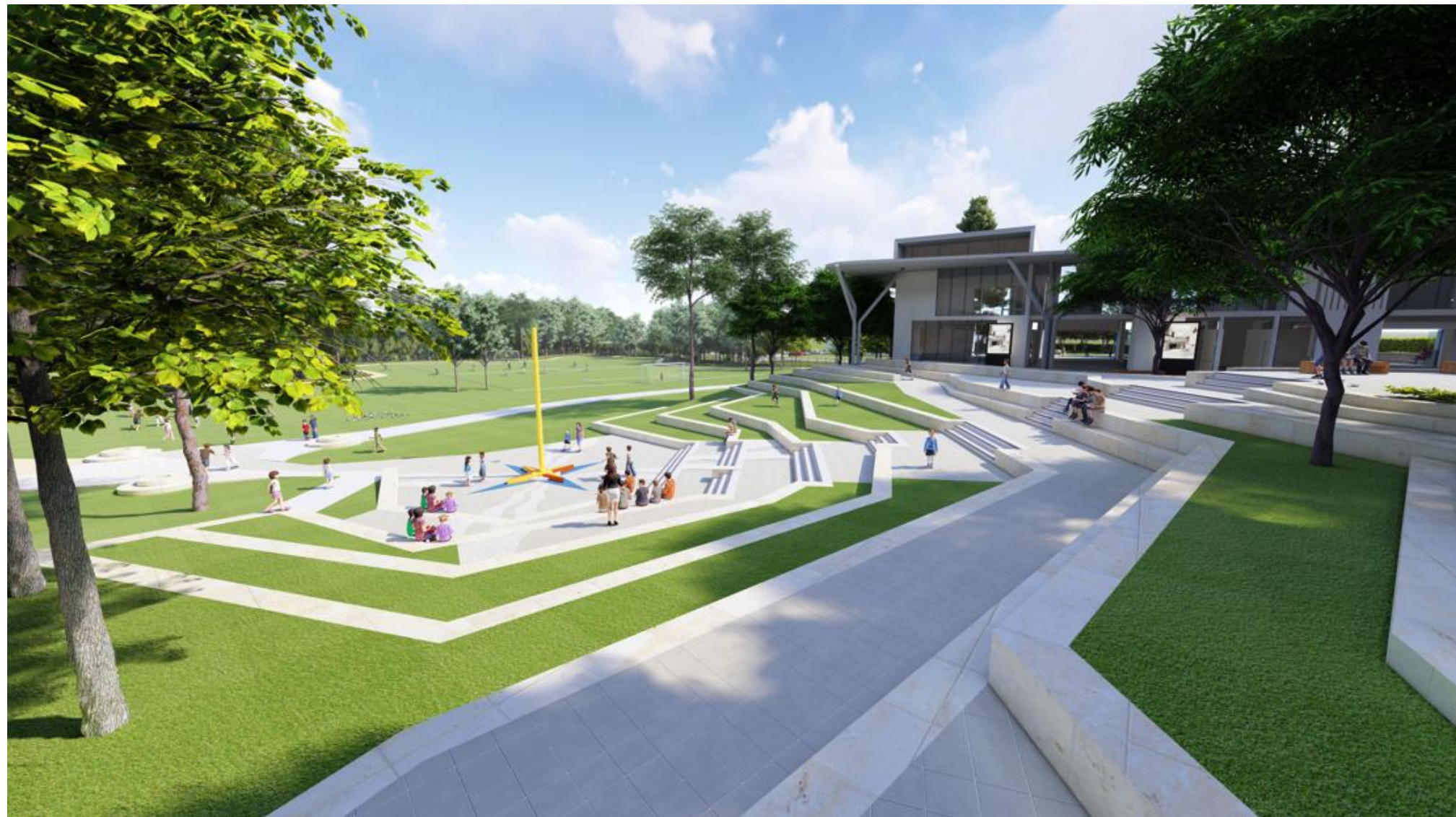
Perspective Overview of Sundial Plaza and Terraces Looking North