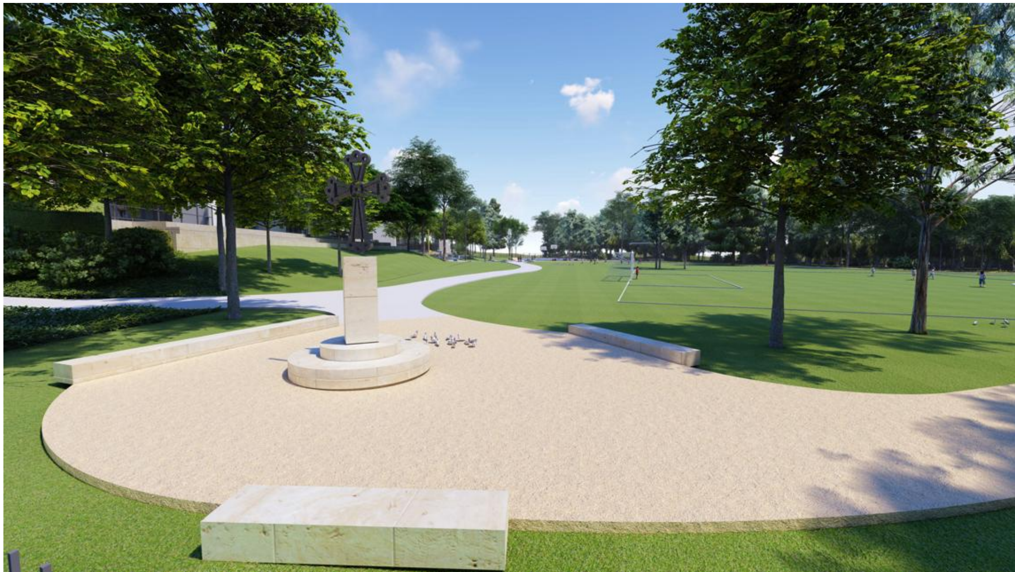
Perspective View of Church Focal Seating Area Looking South