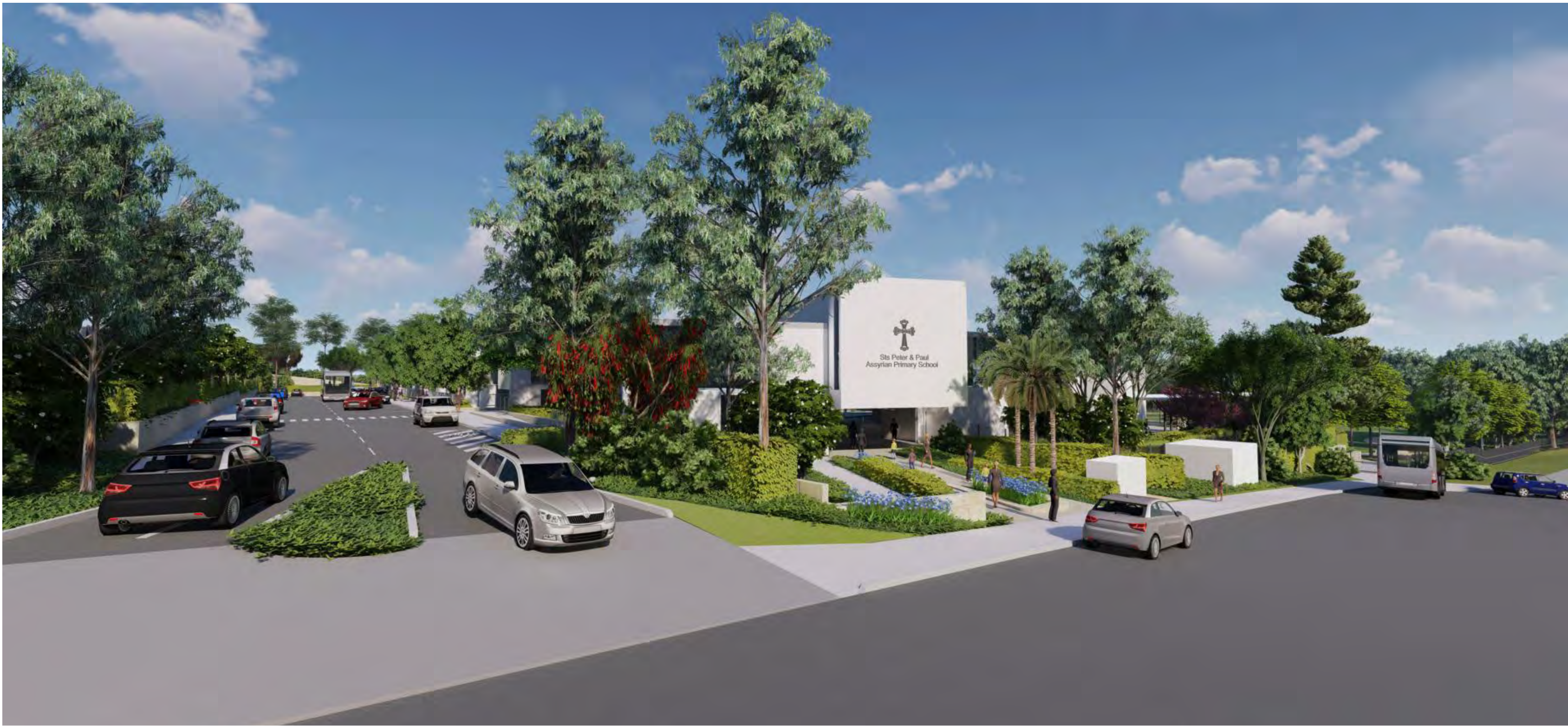
Eyelevel Perspective of School From Kosovich Place