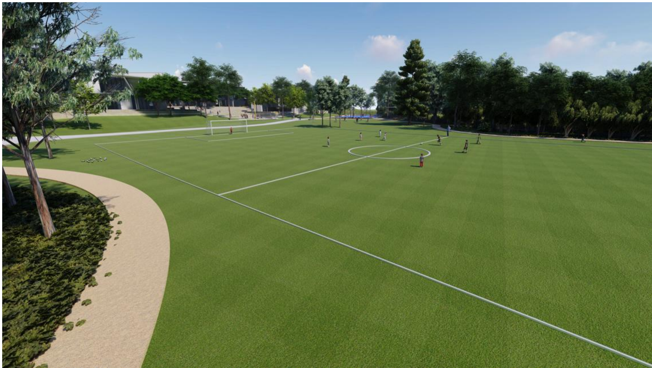
Perspective View from Lower General Play Area