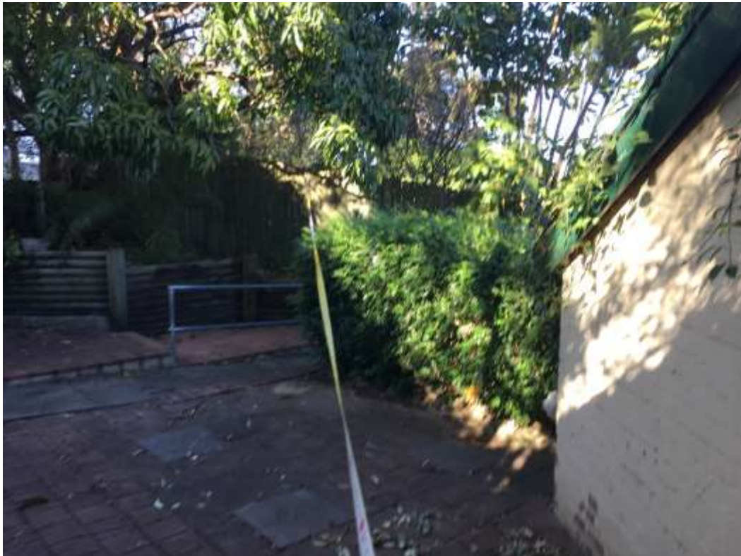
Plate 2: Plot 1 transect end