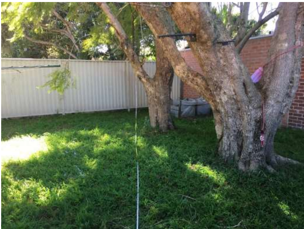
Plate 4: Plot 2 transect end