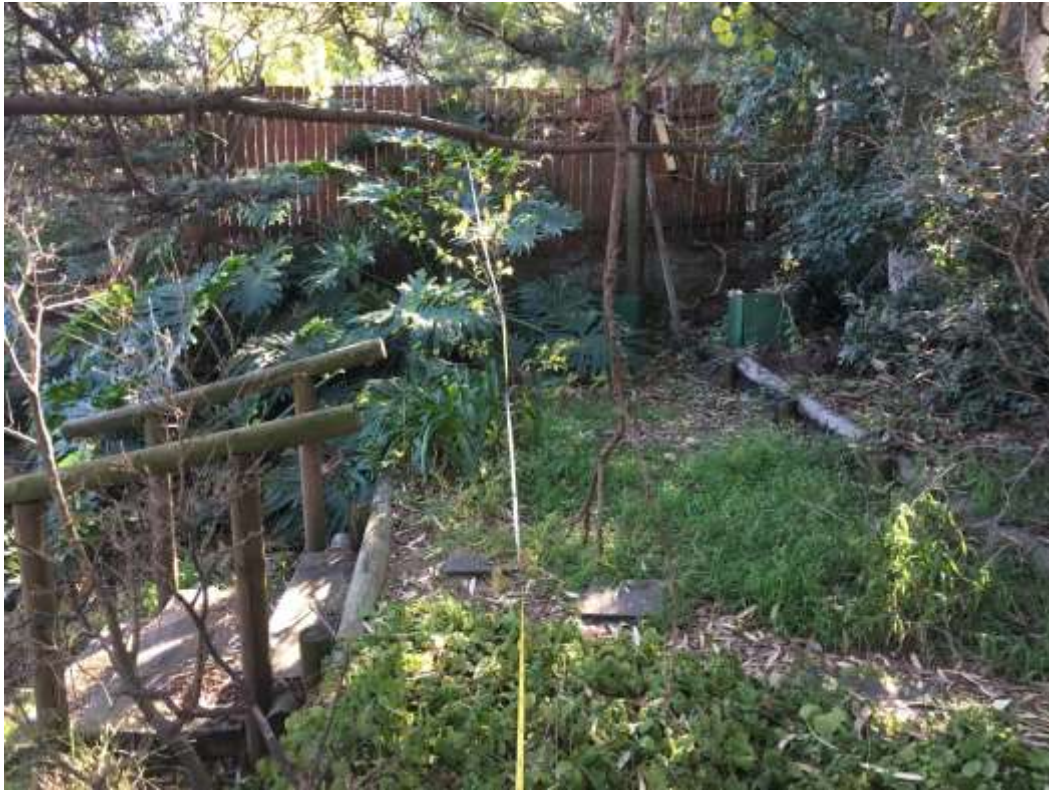
Plate 1: Plot 1 transect start