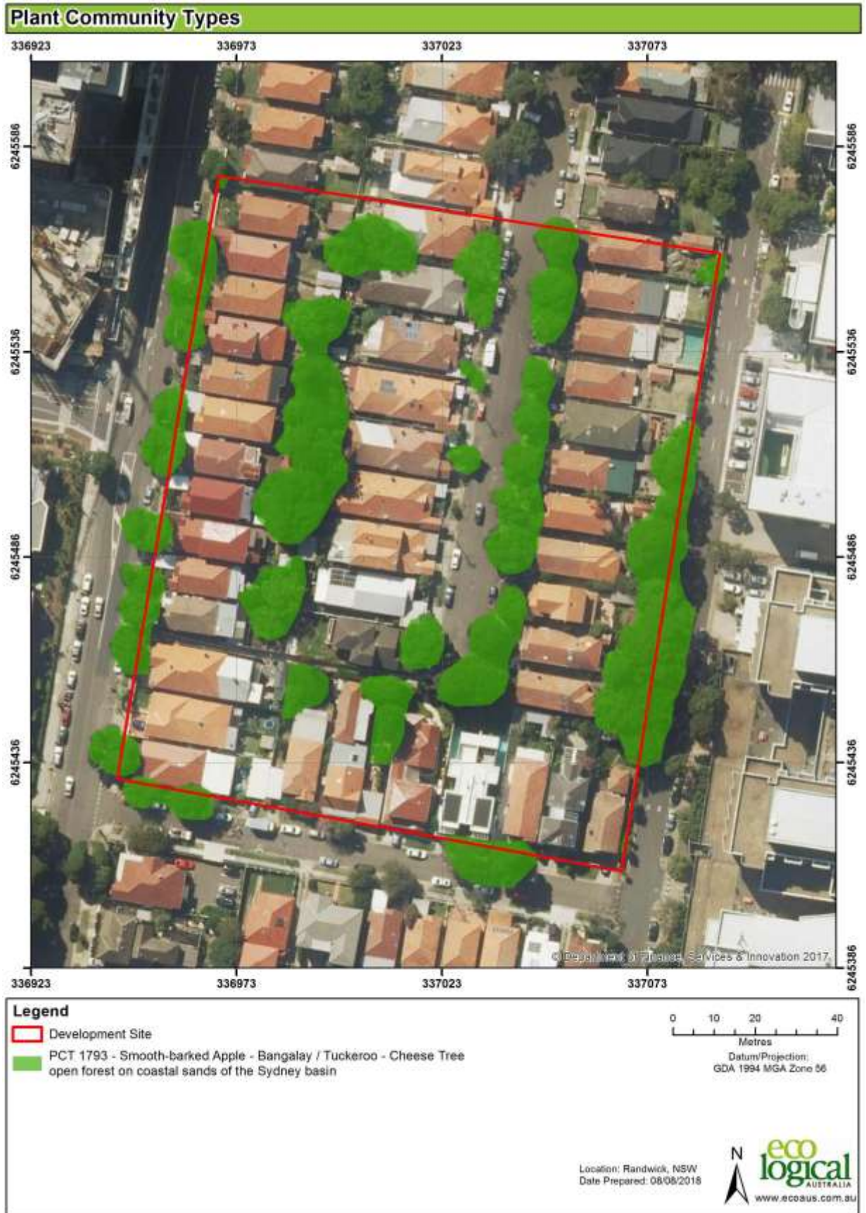
Figure 3: Plant Community Type