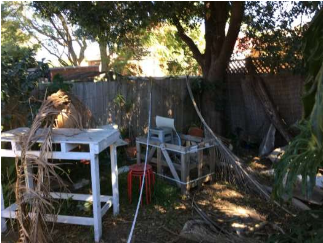
Plate 3: Plot 2 transect start