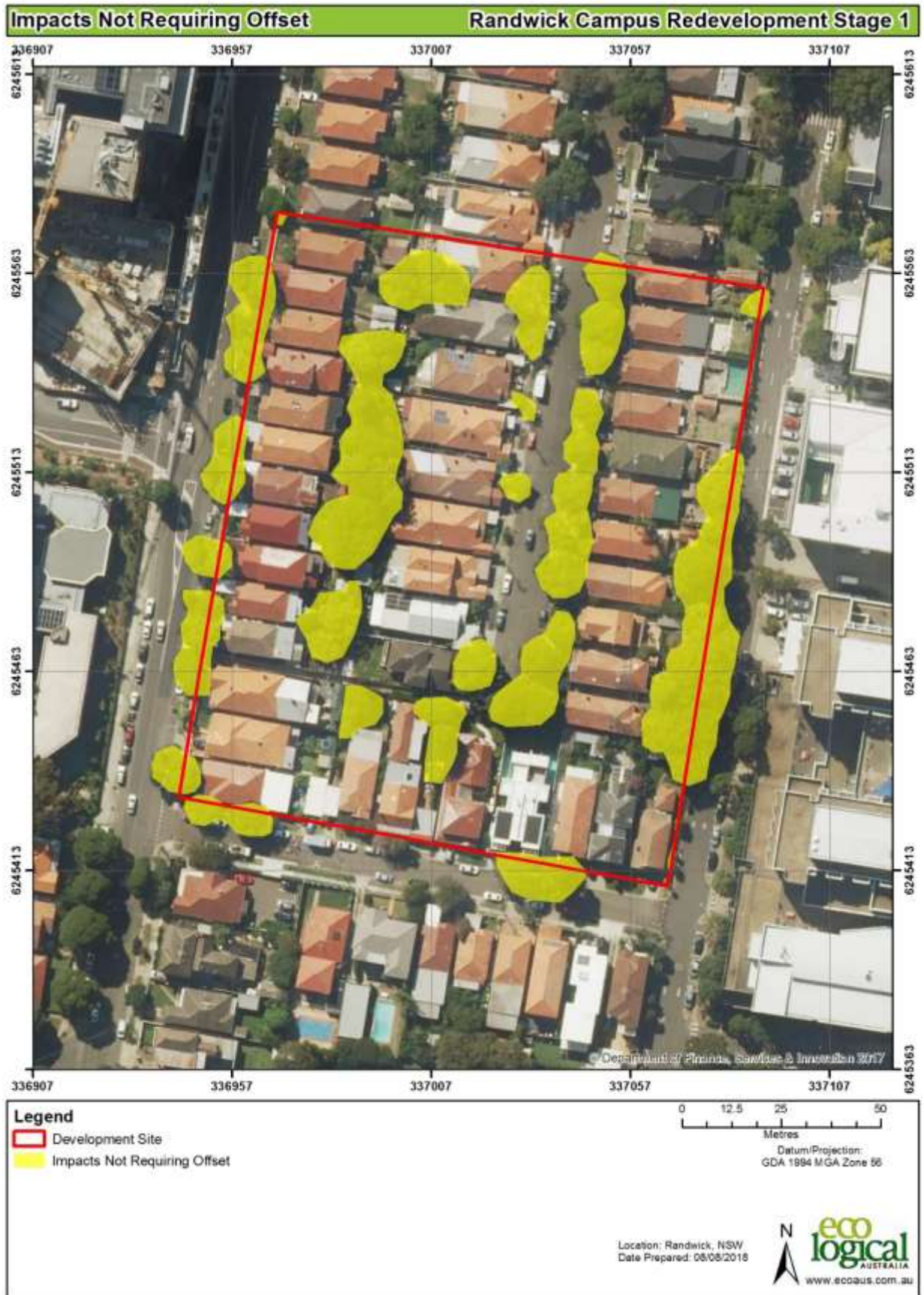
Figure 5: Areas not requiring offset