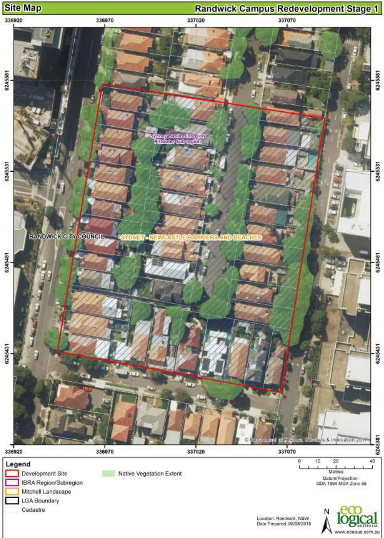
Figure 1: Site Map