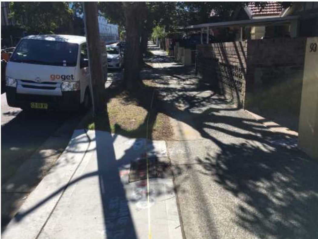
Plate 6: Plot 3 transect end