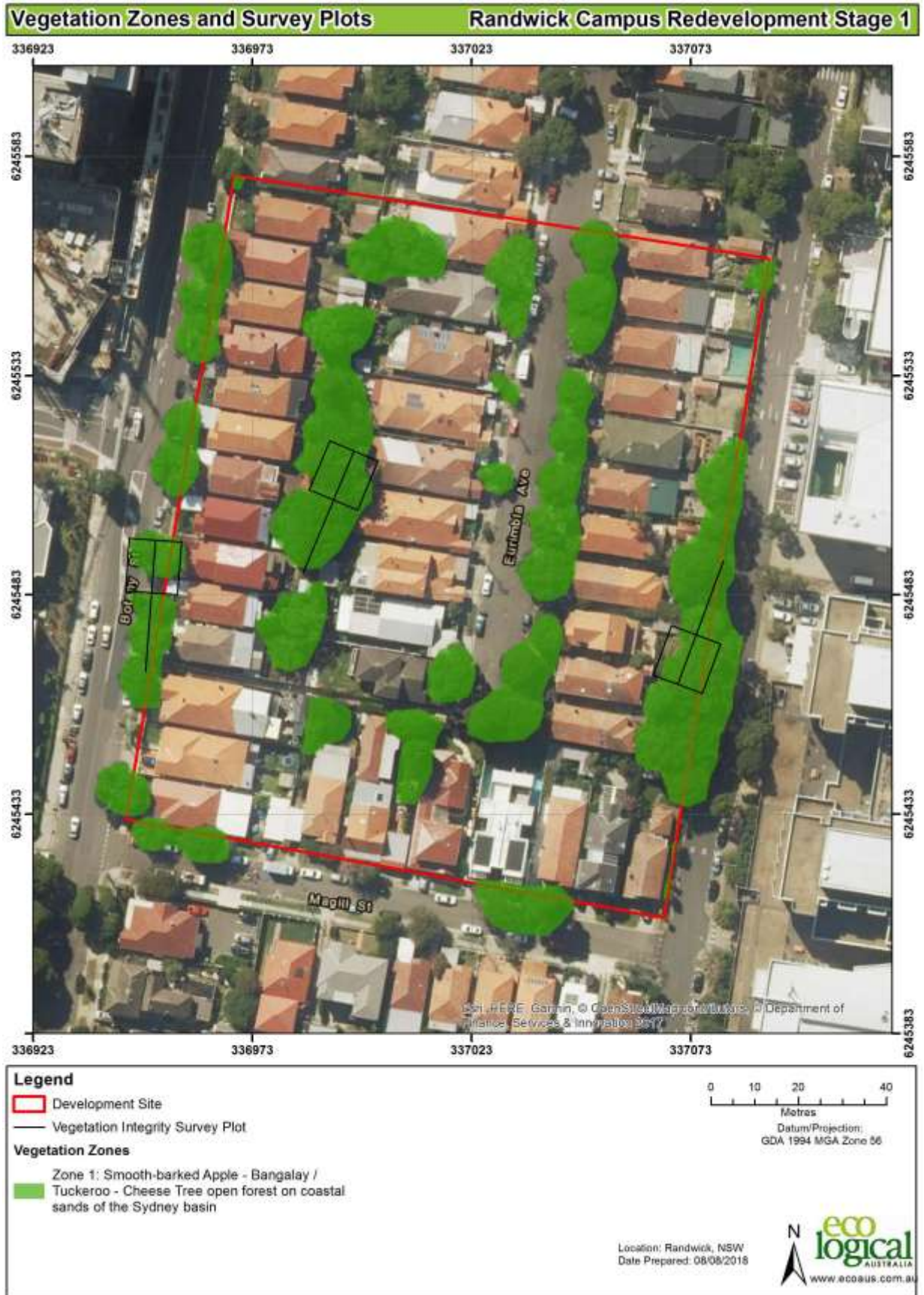
Figure 4: Vegetation Zone and BAM Plots