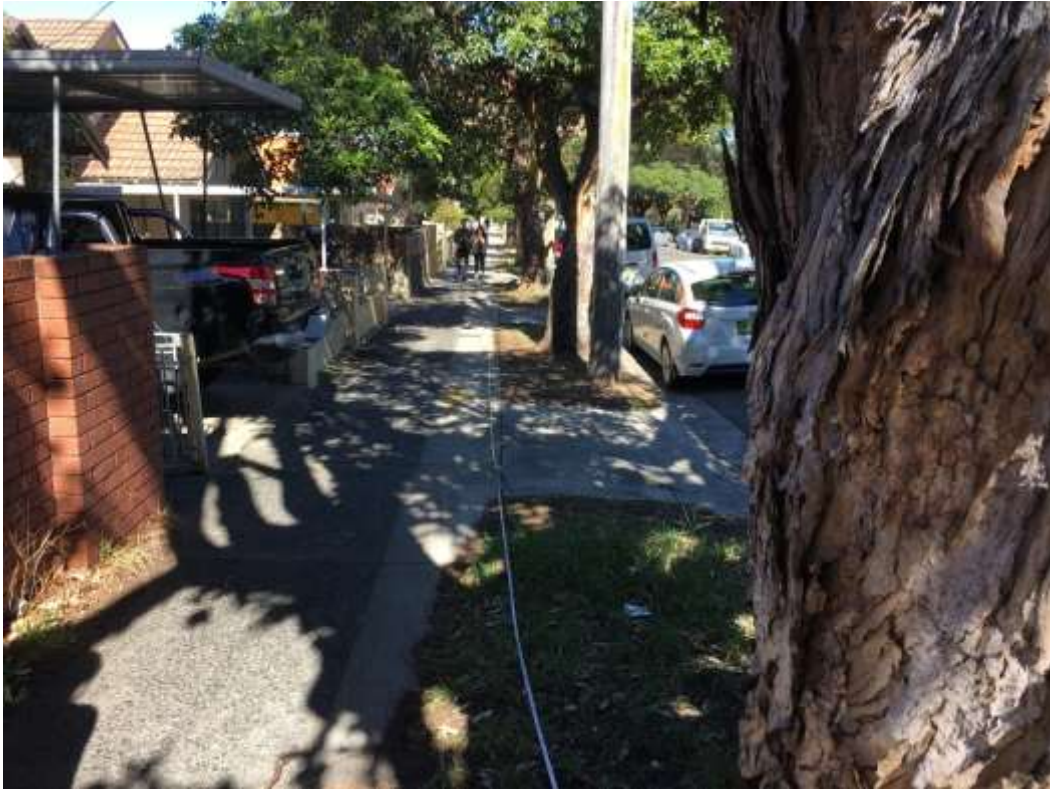
Plate 5: Plot 3 transect start