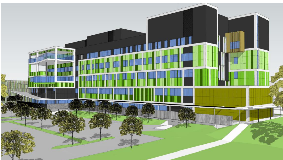
Figure 2 WWBH Stage 3 Ambulatory Care Building