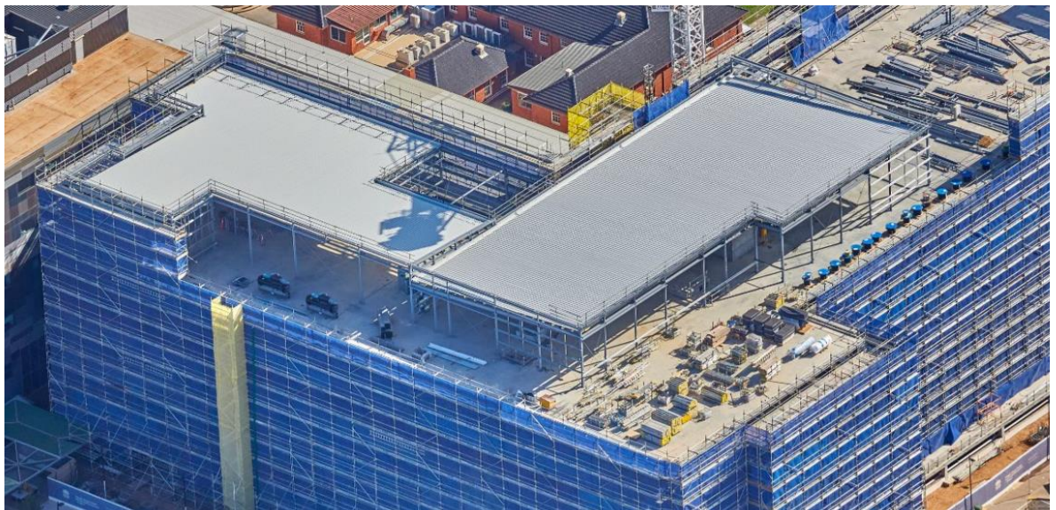
Figure 5 March Aerial Photographs