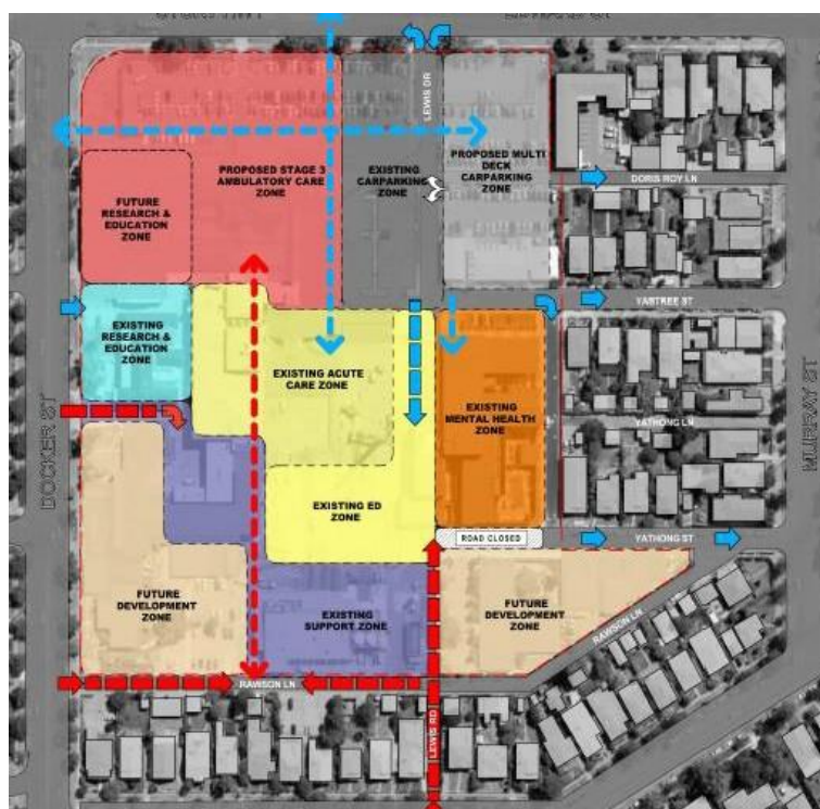
Figure 4 WWBH Masterplan