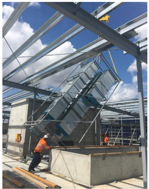
Figure 6 Prefabricated Module Installation