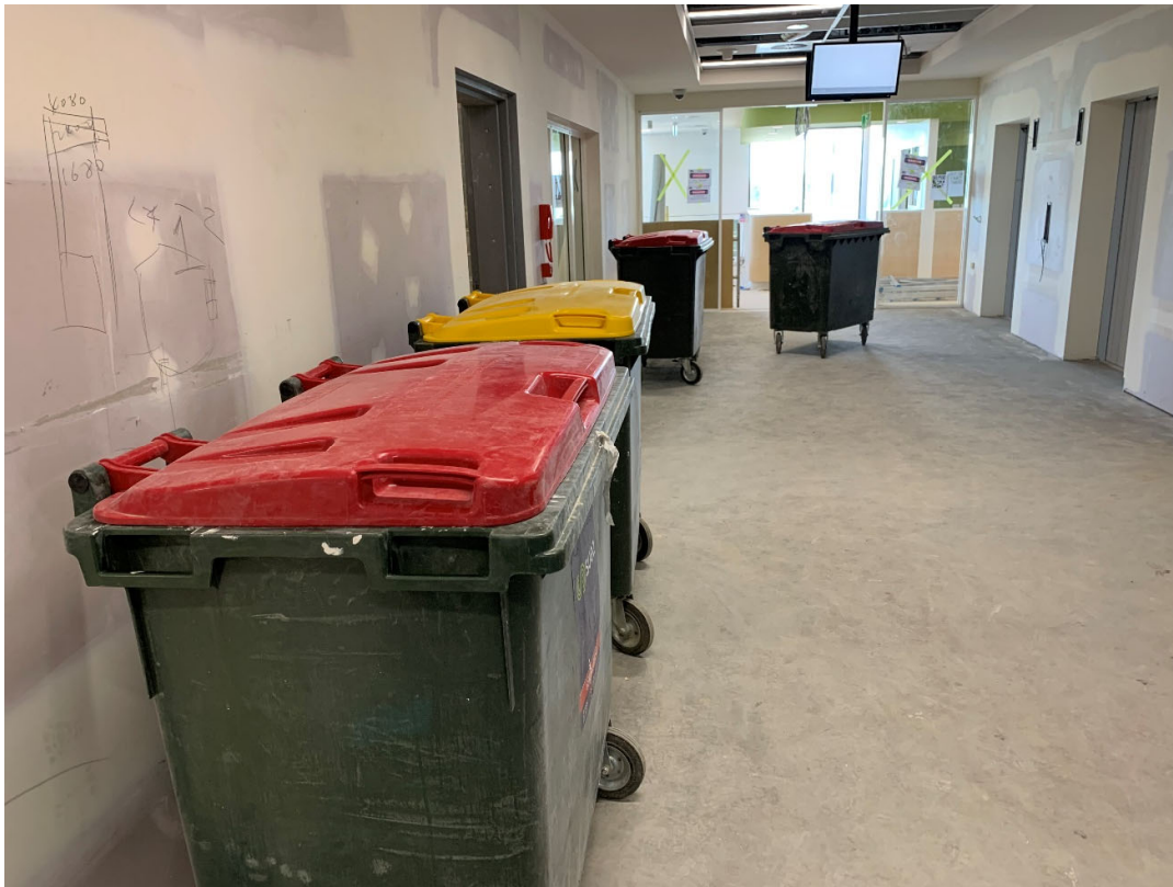
Waste management in indoor work area