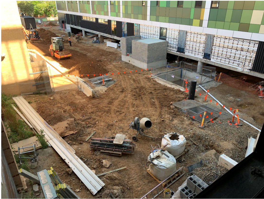
External work area