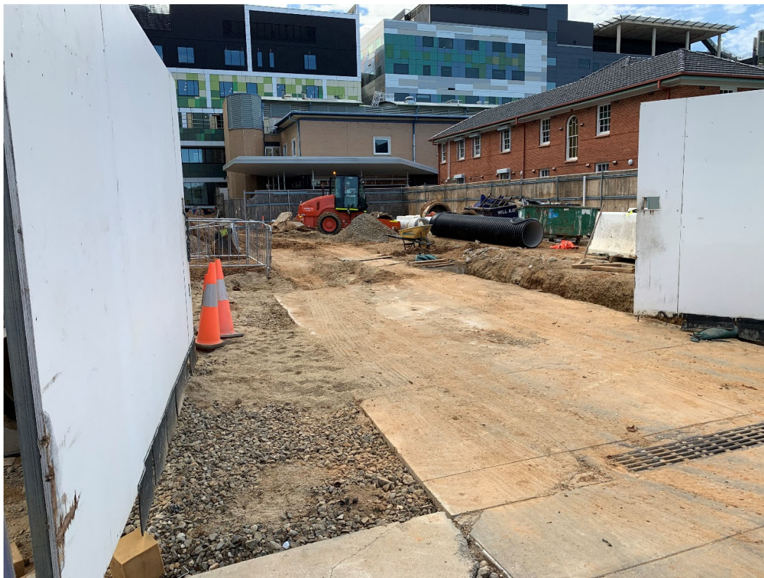
Western entrance gate. Note the concrete apron has been removed in preparation for landscaping.