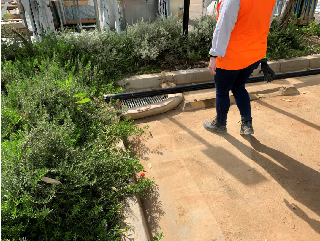
Sediment control at pit