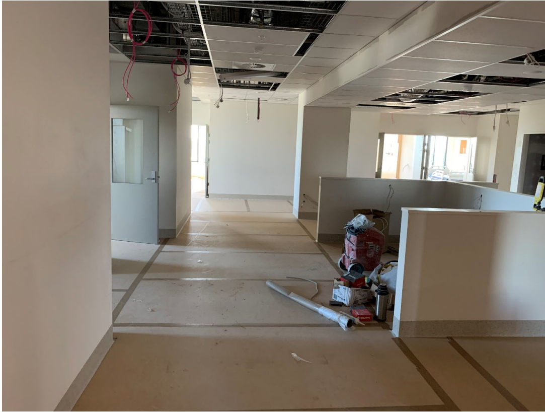
Fitout works nearing completion