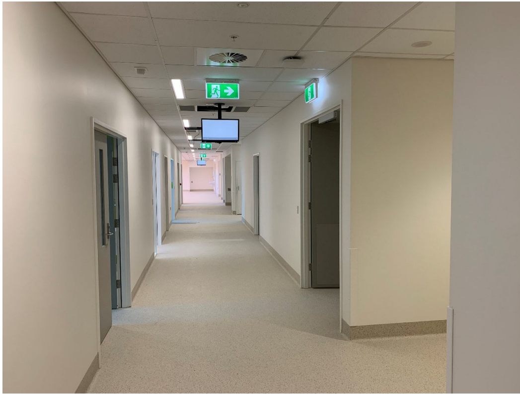
Completed part of the hospital