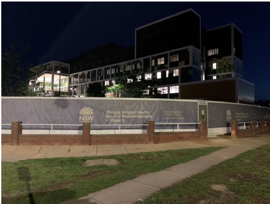
Evening view of the new building. Note hoarding in place