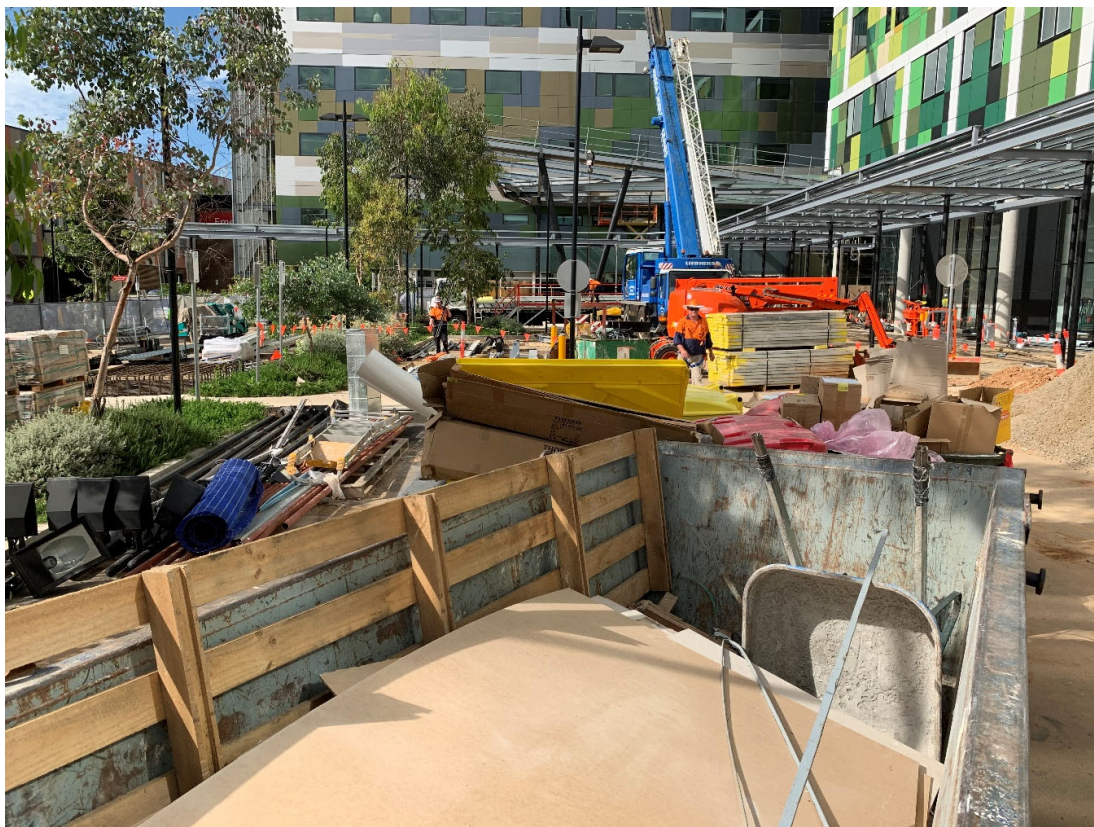
Eastern gate and material storage area