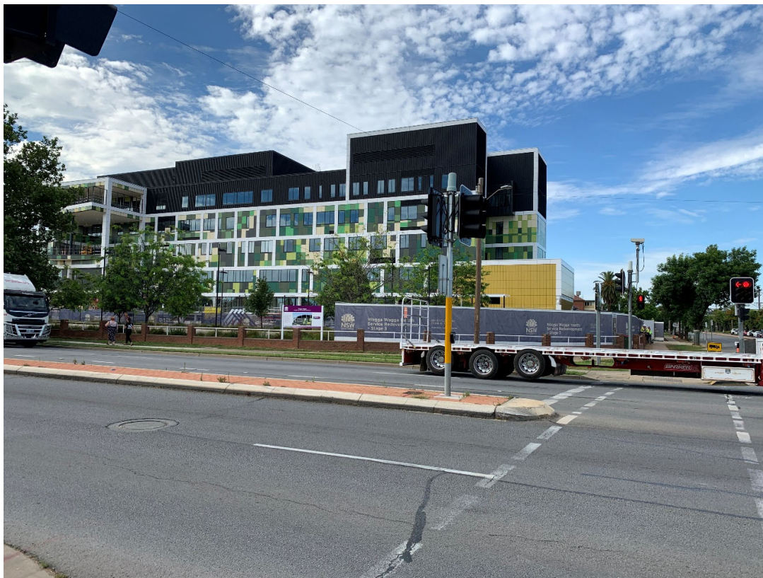
Daytime view of northern facade