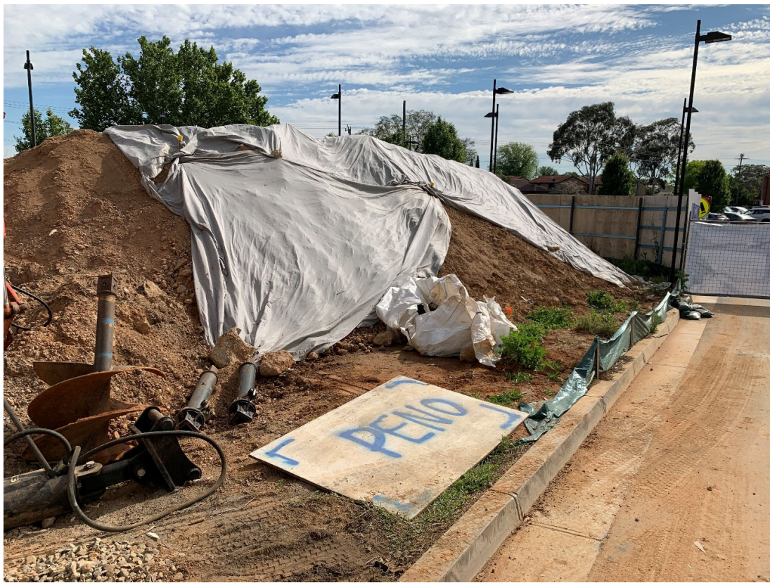
Stockpile in north east corner