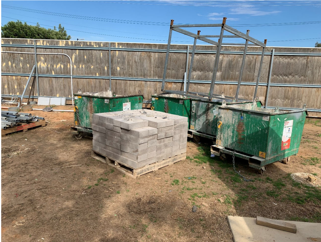
Waste management in outdoor work area

Sediment controls along new northern boudary. Note hoarding has been replaced with temporary fencing