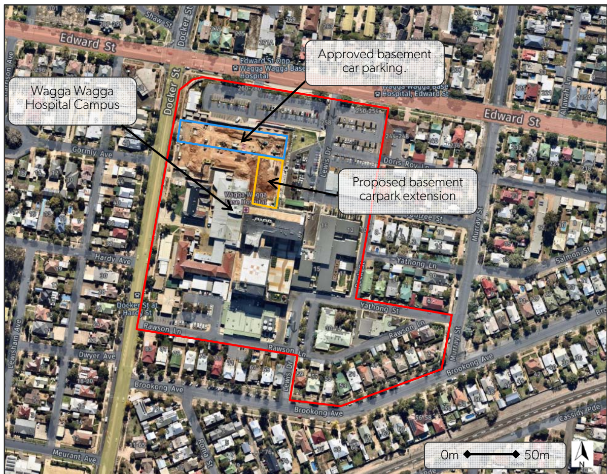
Figure 1 | Site Location

Wagga Wagga Base Hospital is located on the corner of Edward Street and Docker Street and legally described as Lot 334 DP 1190643 in the Wagga Wagga local government area. The Wagga Wagga base hospital consists of: a six storey Ambulatory Care Building (ACB) which includes a rooftop mechanical plant room and 40 basement car spaces; ground level retail space; 60 at grade car parking spaces; and bridge connections between the ACB and the main hospital building. The hospital site including stage 3 development are depicted in Figure 1 .