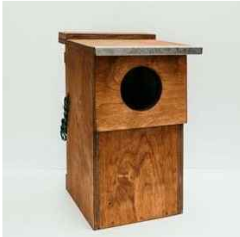
'Large' box (bush-tail and ringtail possums, Woodducks and parrots)