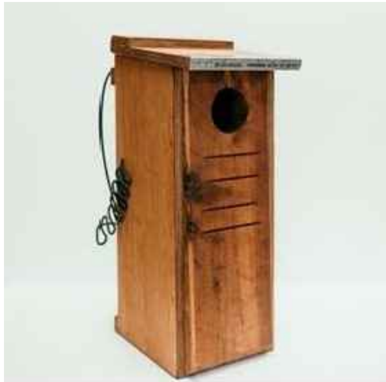
'Medium' box (targeted to rosellas and lorikeets and nocturnal animals)