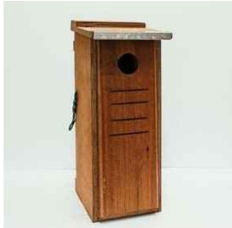
'Small' box (targeted to sugar and squirrel gliders, tree creepers and scaly breasted lorikeets)

Nest Boxes are specified as per Hollow Log Homes - to be purchased to compensate for the loss of any hollows. As per advice from Eco Logical