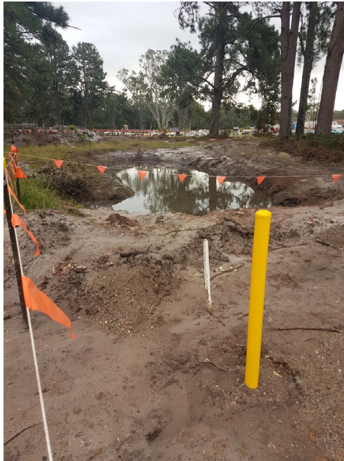
Sediment basins and stormwater controls