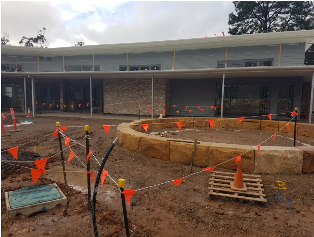
Q-Block, with landscaping commencing.