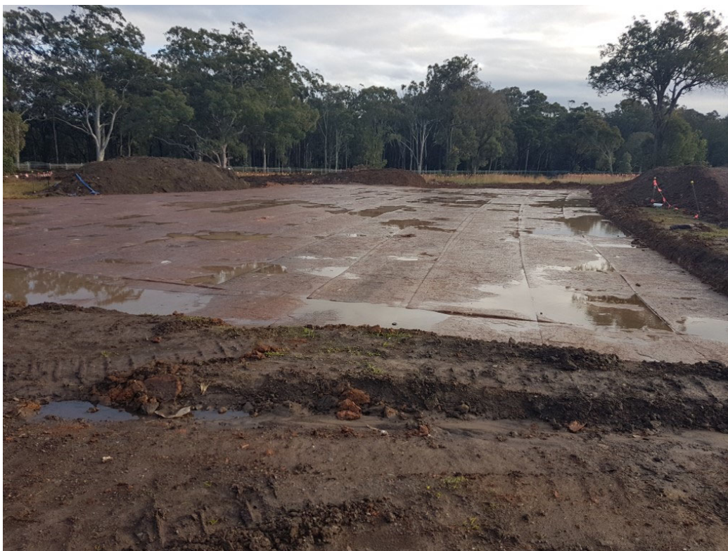
Clay capping over remediation cell