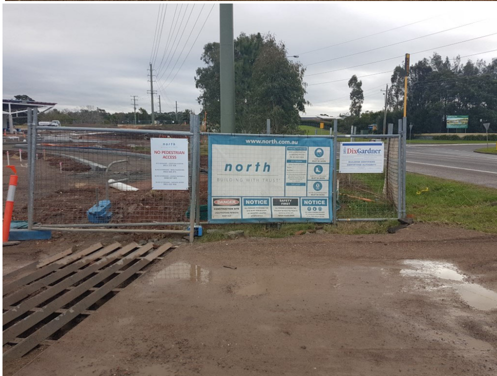
Site noticeboards at entry