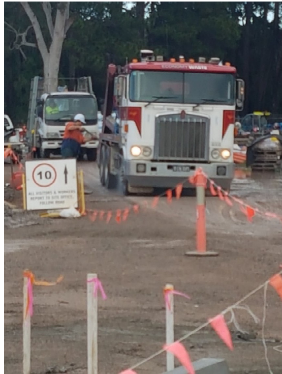
Shaker grid and wheel washing bay