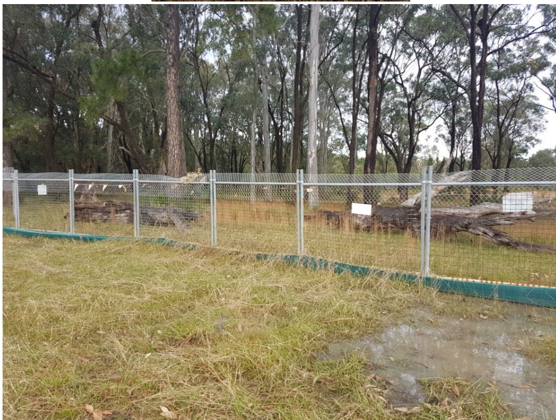
Vegetation and fauna management measures