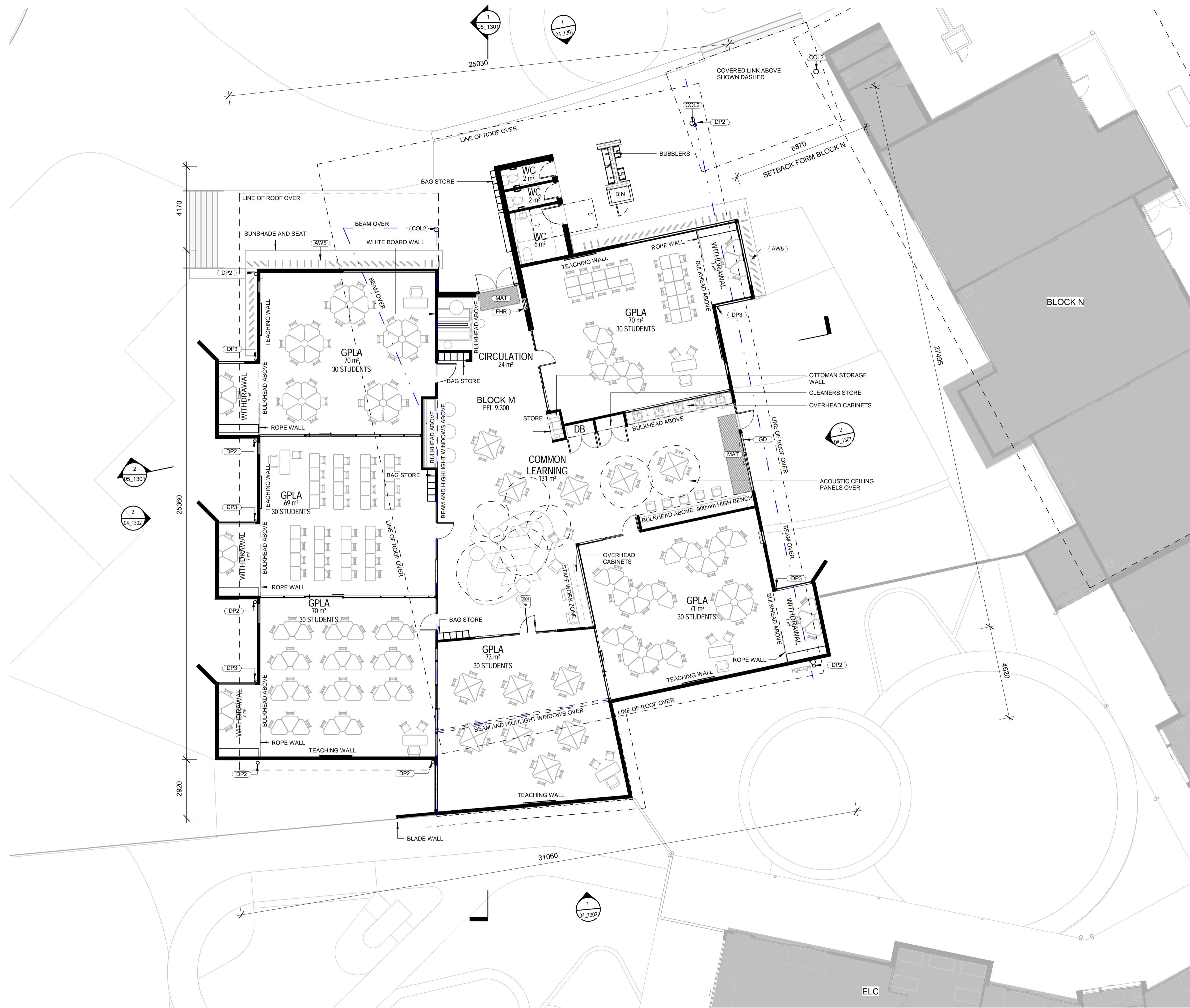
1 FLOOR PLAN - BLOCK M SCALE 1:100