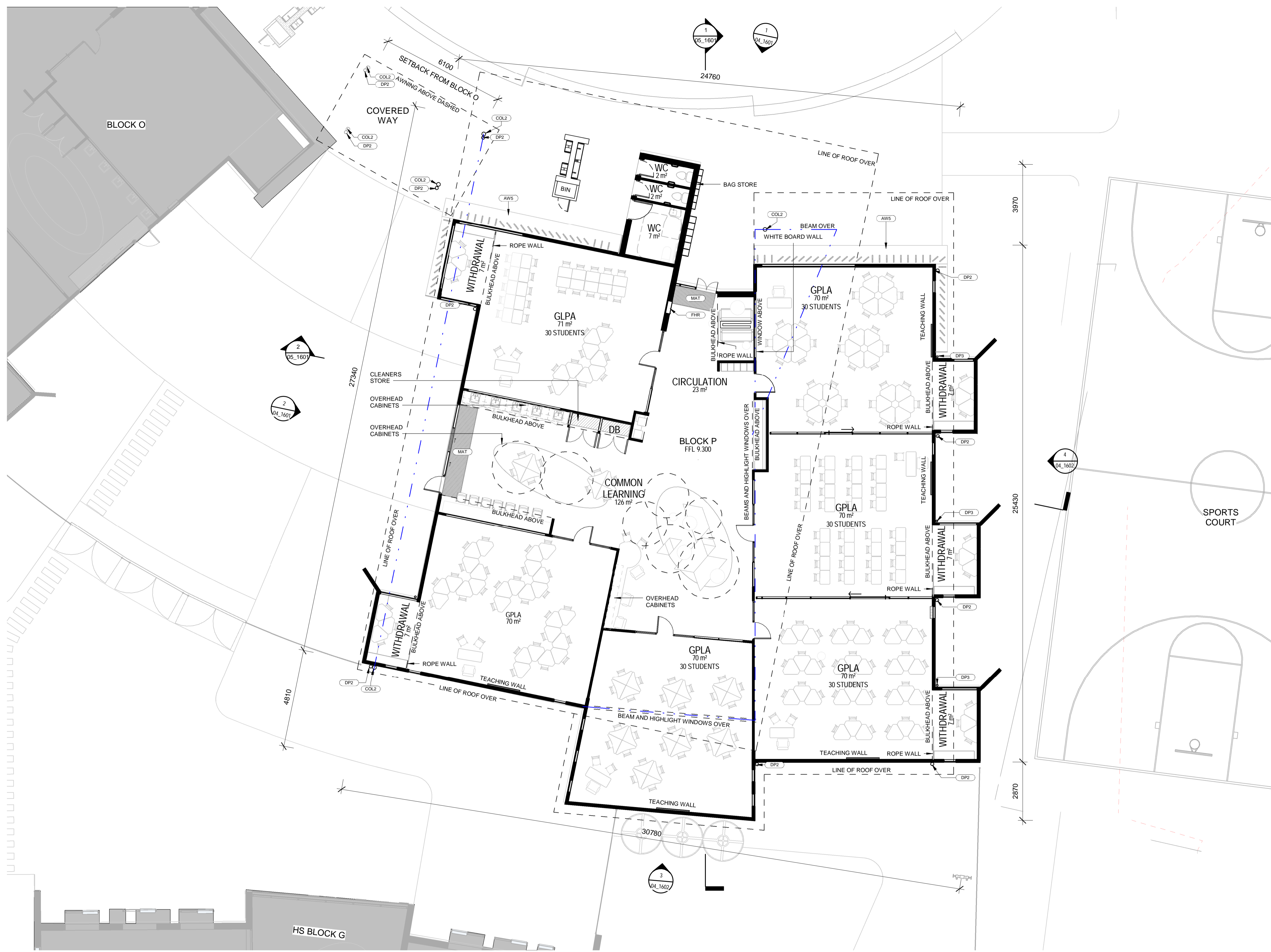
1 FLOOR PLAN - BLOCK P 04_1601 SCALE 1:100