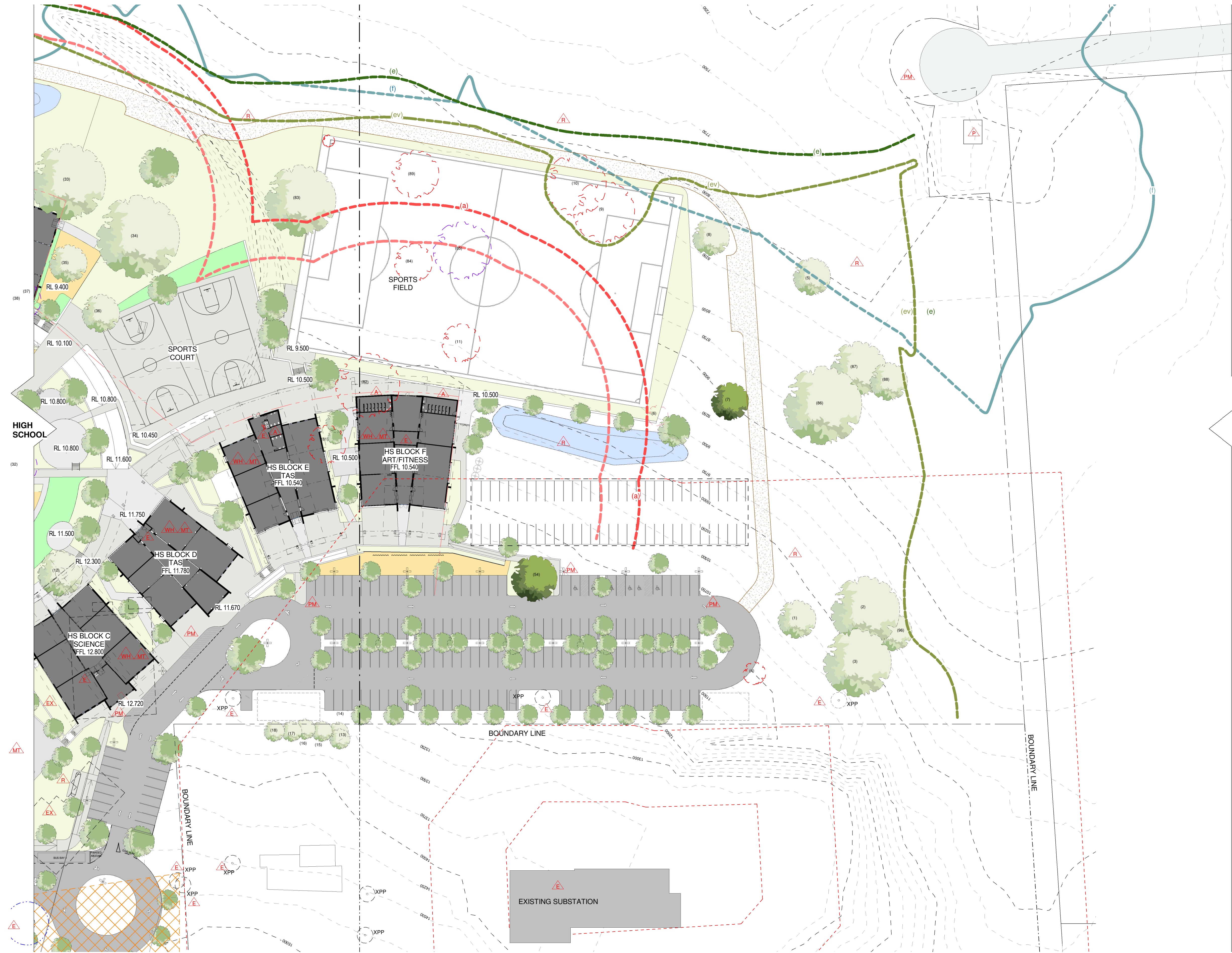
1 SITE PLAN - NORTH SCALE 1:500