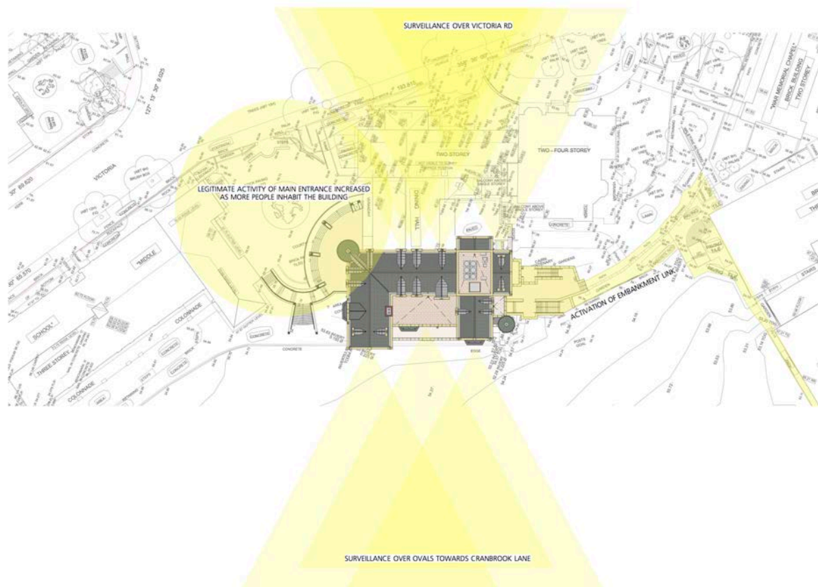
Fig 2: Diagram indicating increased natural surveillance around the proposed Stevenson Library

The objectives of natural surveillance and sightlines is to encourage buildings and the public realm to be designed to maximise the potential for public surveillance. This shall be achieved by providing unimpeded sightlines, particularly along pedestrian ways, as well as improving natural surveillance through increased legitimate use of spaces. As the proposed renovations allow the Stevenson Library to be used for a whole range of programs and functions, during and outside of typical school hours, natural surveillance and legitimate activity is increased as more people inhabit the building and space around it. The proposed Stevenson Library fronts the main entrance way, provides sightlines over the oval across the campus, as well as overlooking Victoria Rd. Refer Fig 2