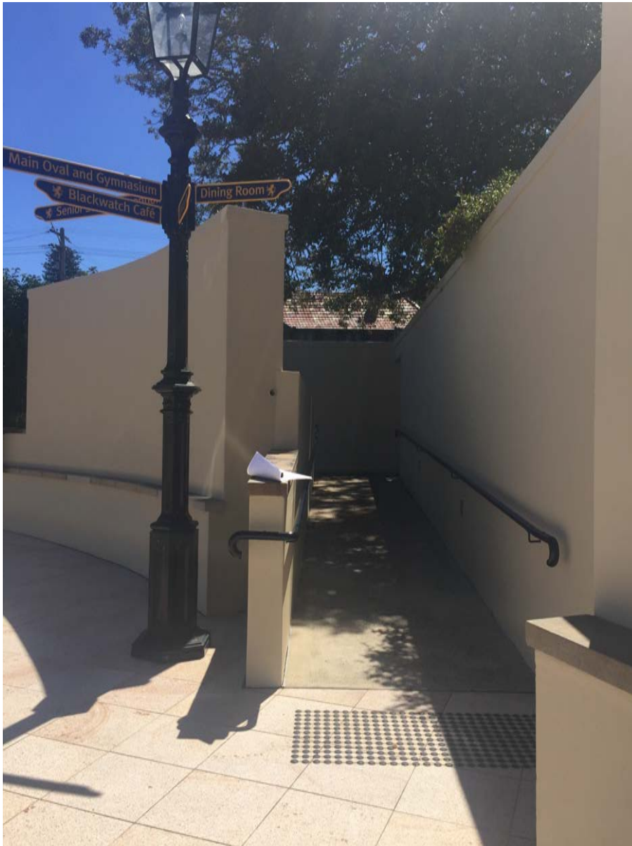
Fig 3: Existing unobstructed, well-lit way-finding post surrounding the Stevenson Library

The objectives of signage are to provide clear direction for people undertaking day-to-day activities, as well as creating a greater sense of safety through knowledge of location and direction. Signage indicating safe routes, destinations, facilities and amenities will be provided at key intersections. Signage will be legible through the use of strong colour, clear contrast, standard symbols and simple graphics. All signs shall be illuminated at night and unobstructed by vegetation growth.