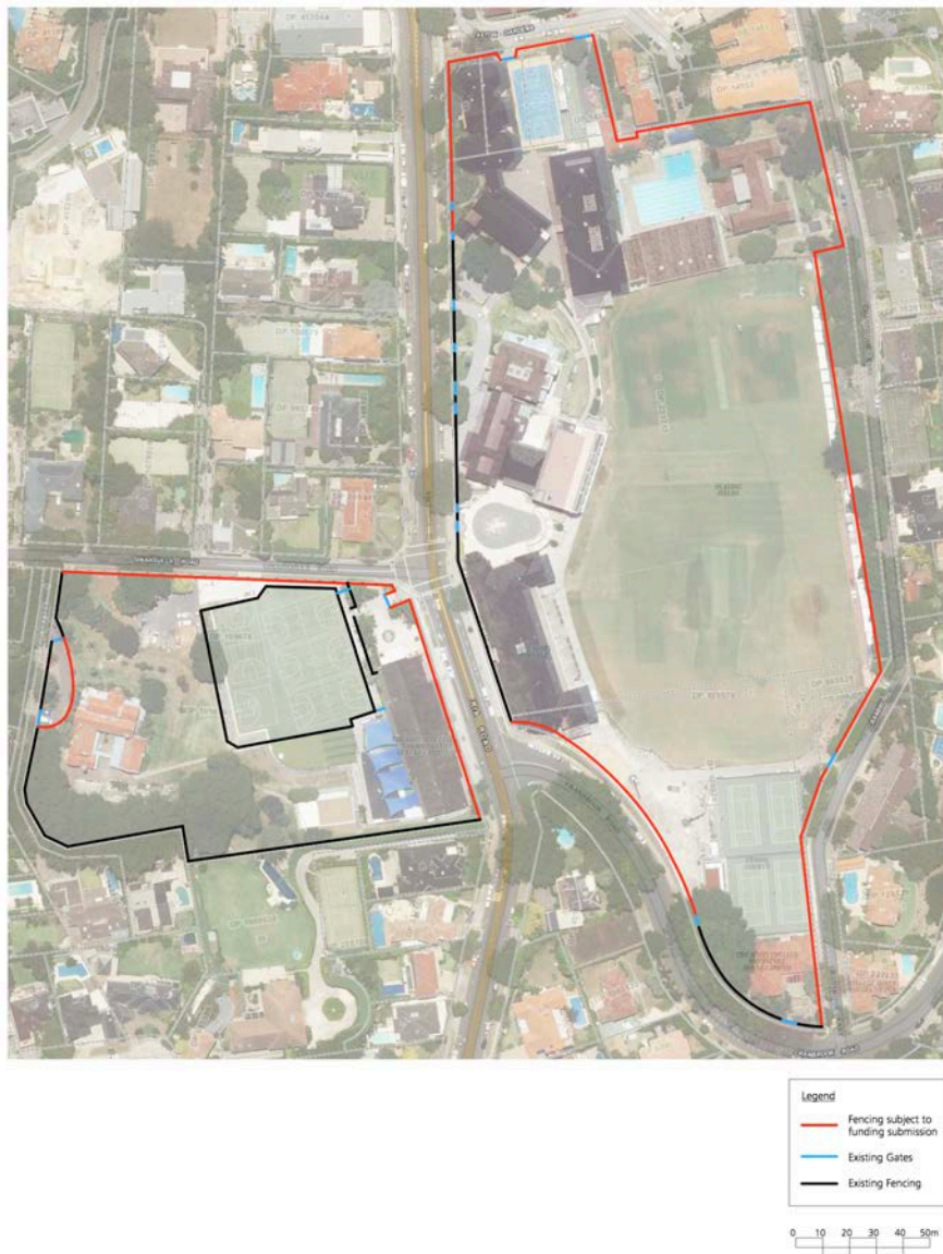
Fig 4: Diagram illustrating the Secure Schools Program, including a network of fences

The proposed Stevenson Library is located within the greater Scots College Campus, which currently has a Secure Schools Program in place. The secure schools program includes fencing around the entire campus, with controlled and restricted entrances and gates – refer Fig 4. Access to the Stevenson Library will be predominately via the main quadrangle, which is an already heavily occupied area, with passive security from the Main School Building and admin offices. Furthermore, Access Control + Intruder Detective systems, including CCTV systems and alarms, are currently in place in buildings around the college, and shall also be installed within the proposed Stevenson Library.