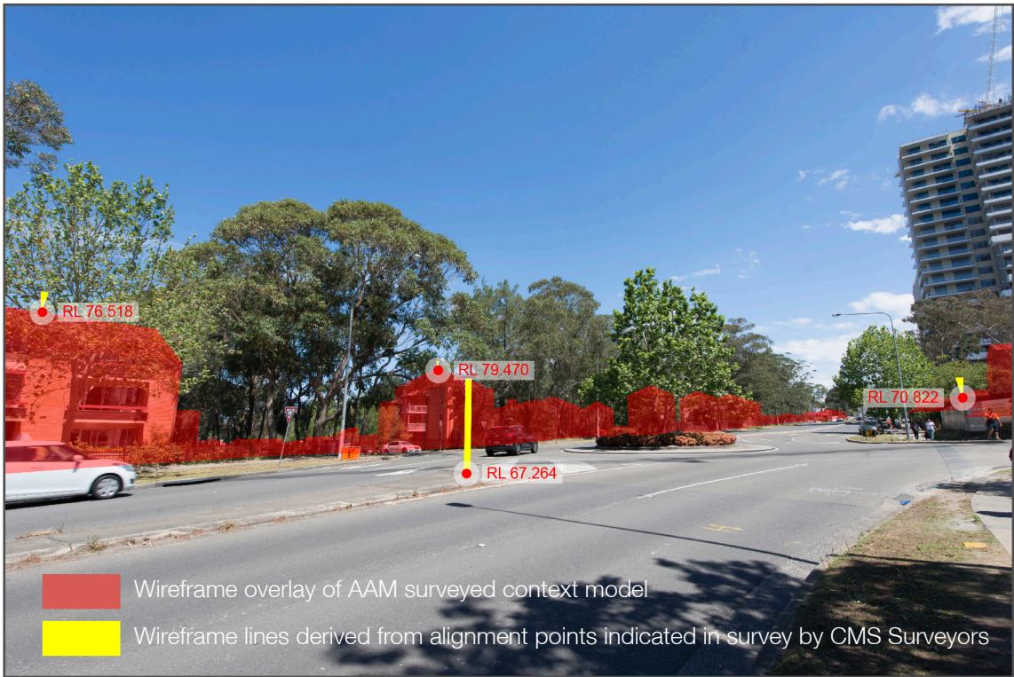
Original photo with wireframe overlay of surveyed elements