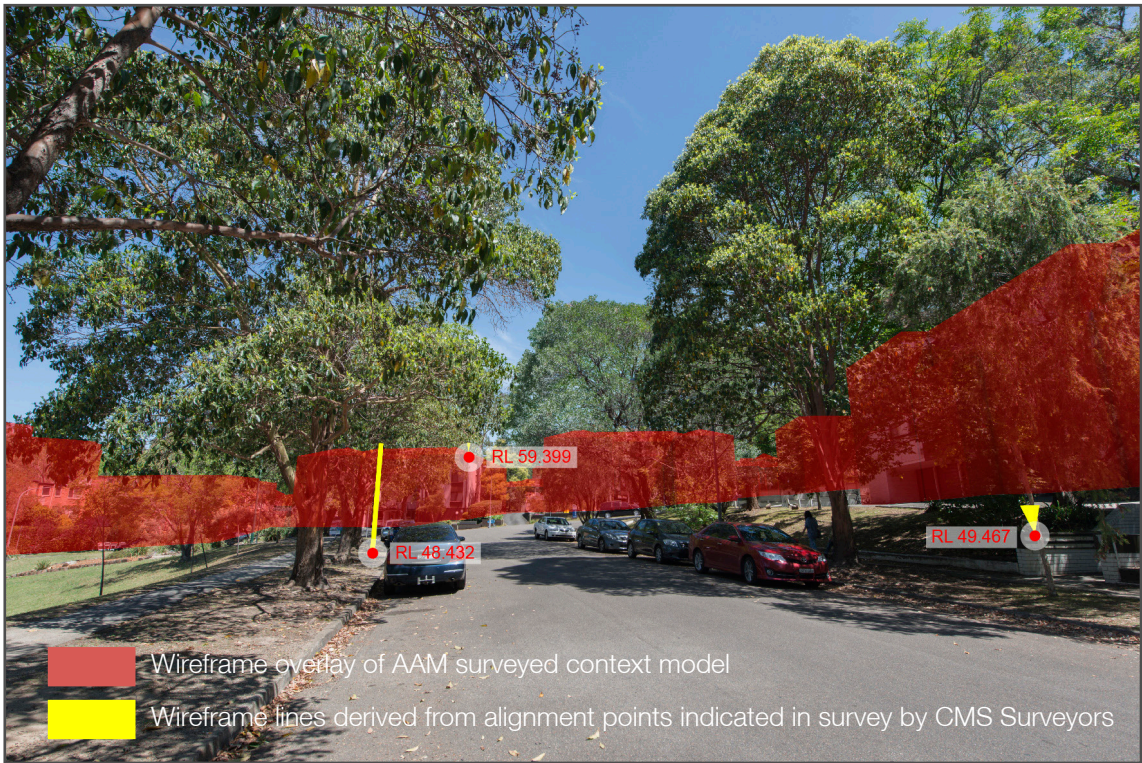
Original photo with wireframe overlay of surveyed elements