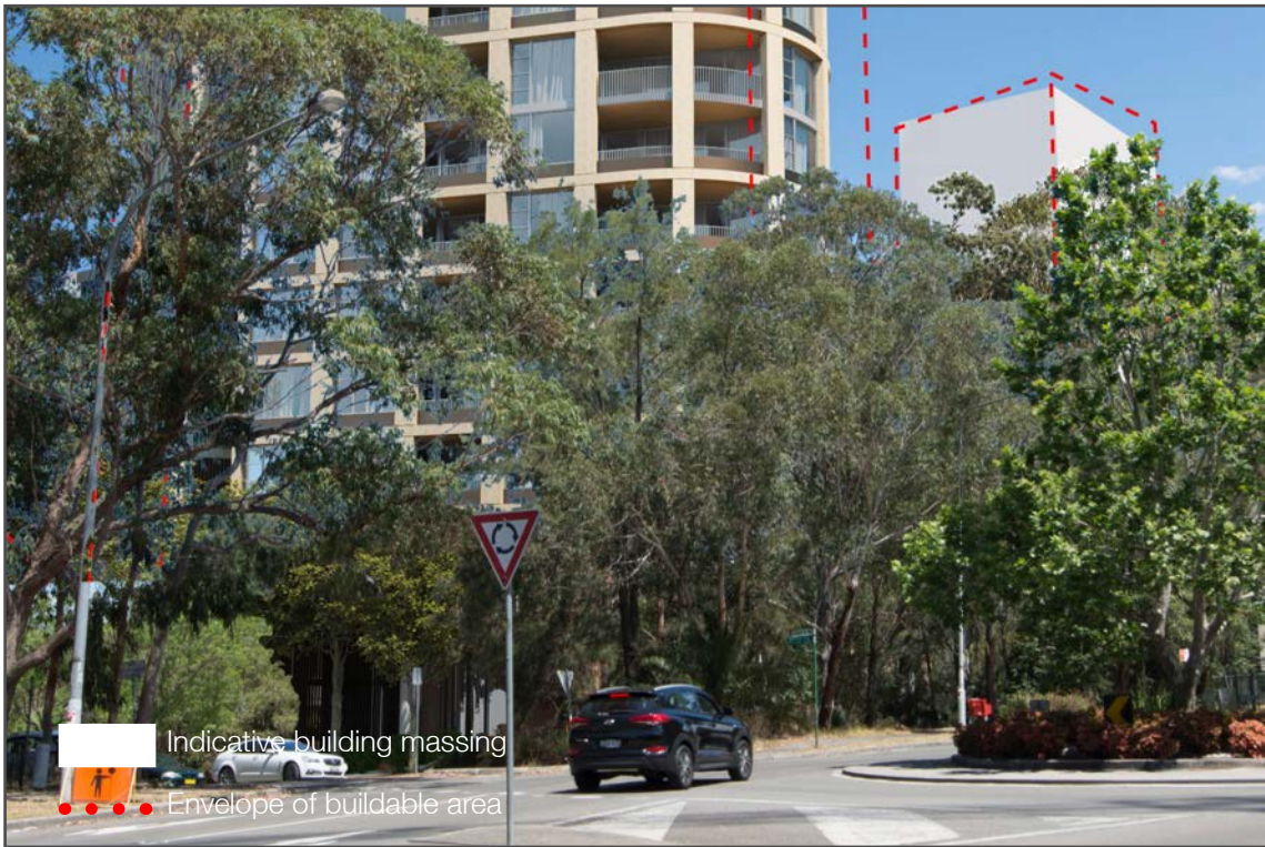
50mm crop of photomontage of indicative building massing