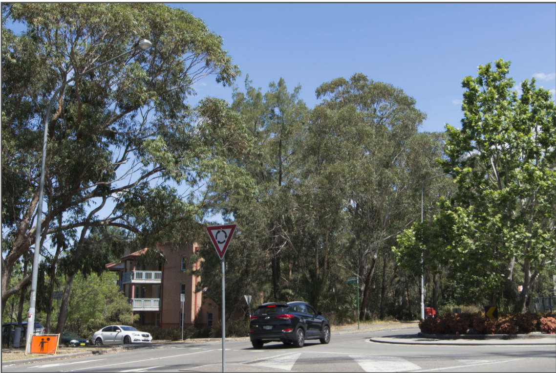
50mm crop of original photograph