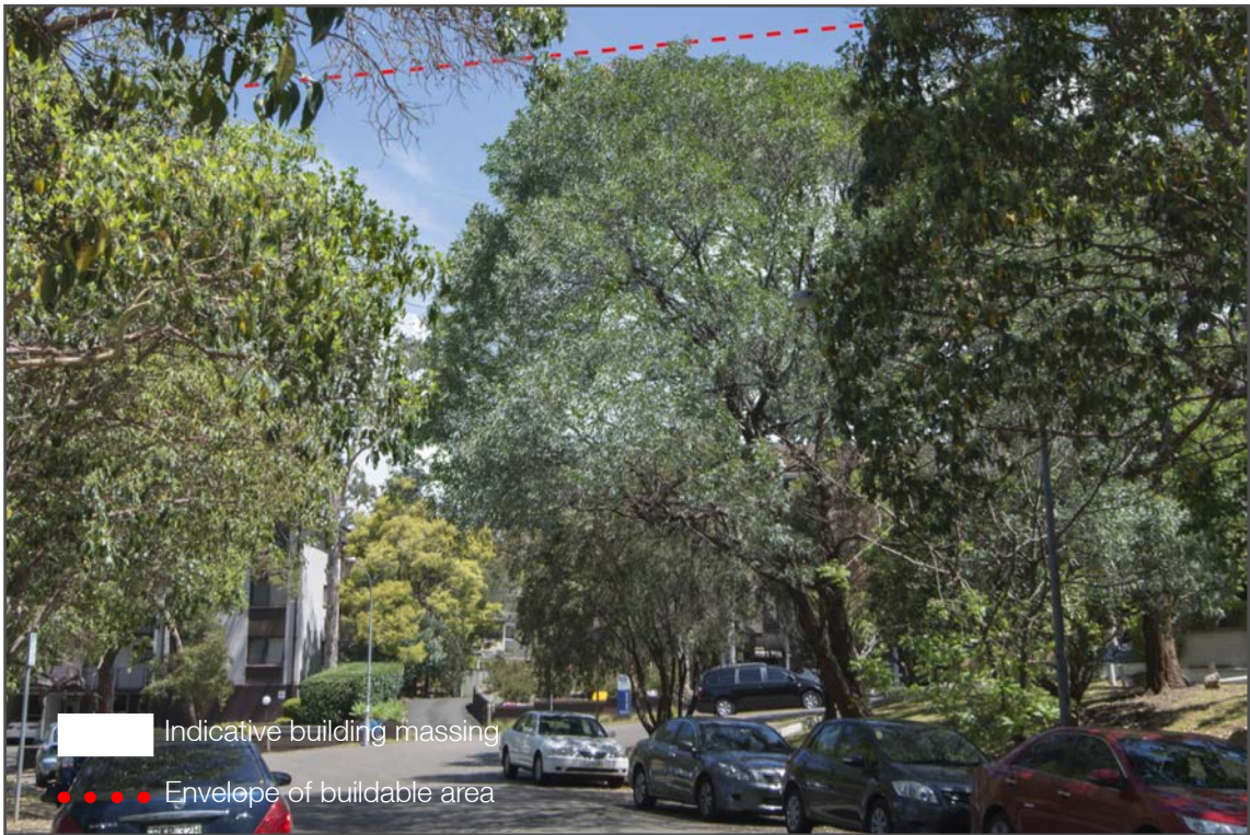
50mm crop of photomontage of indicative building massing