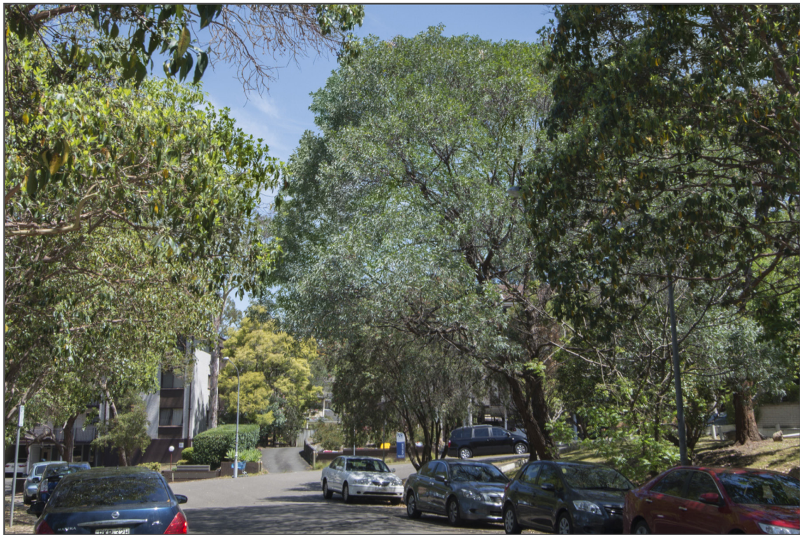
50mm crop of original photograph