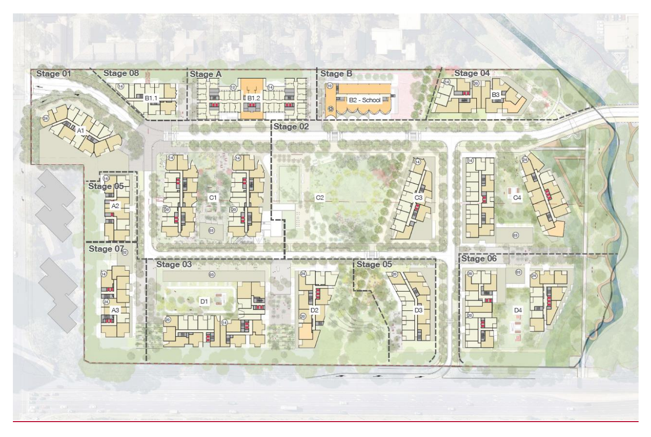
Figure 2- Ivanhoe Estate Masterplan