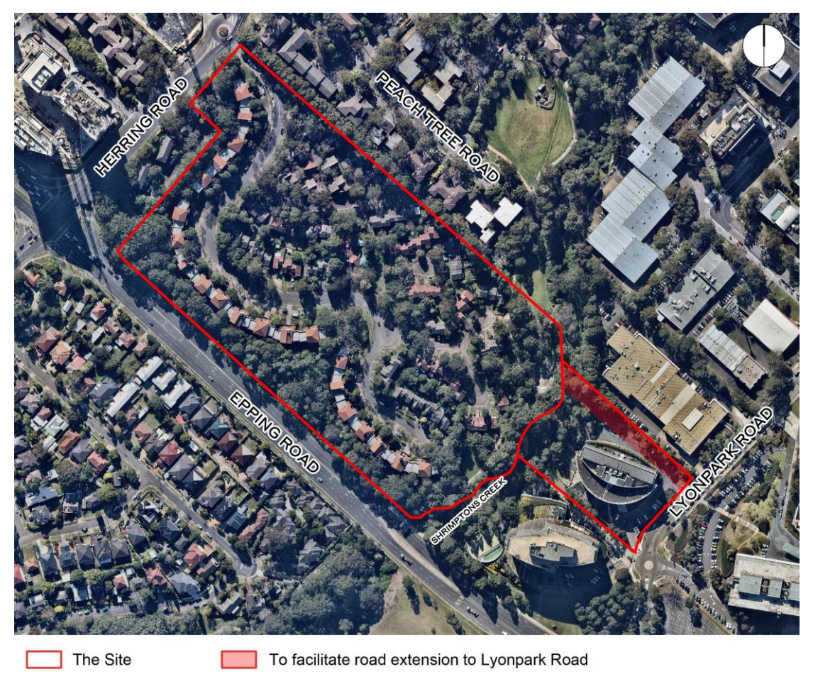
Figure 1- Ivanhoe Estate site