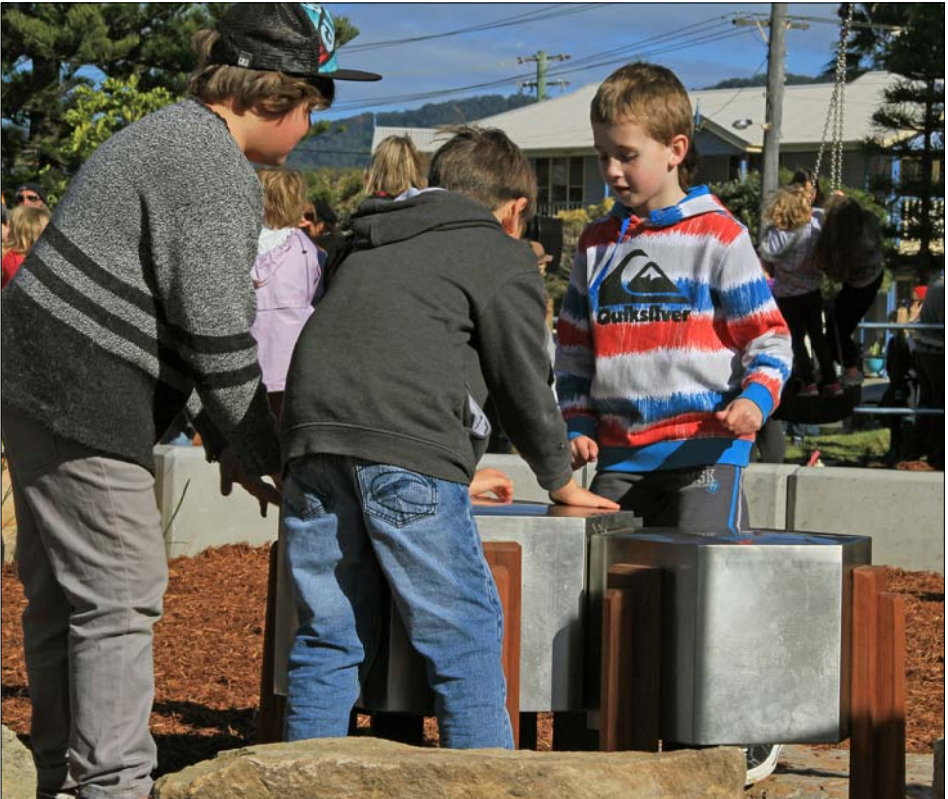
ENGAGING MUSICAL INSTRUMENTS