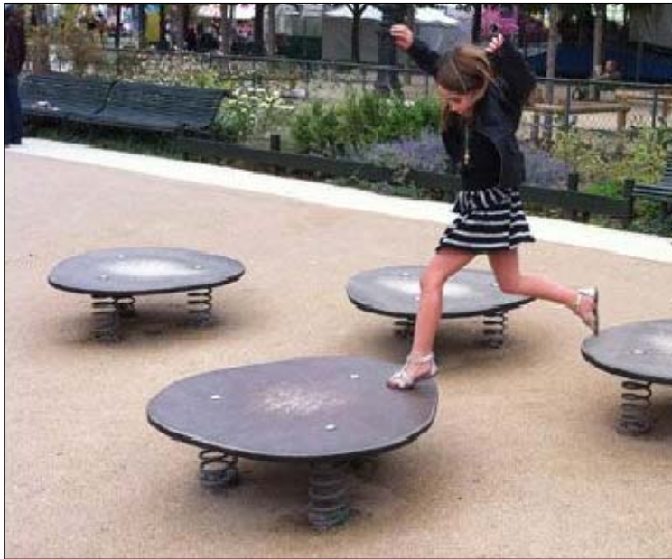
BALANCING AND JUMPING