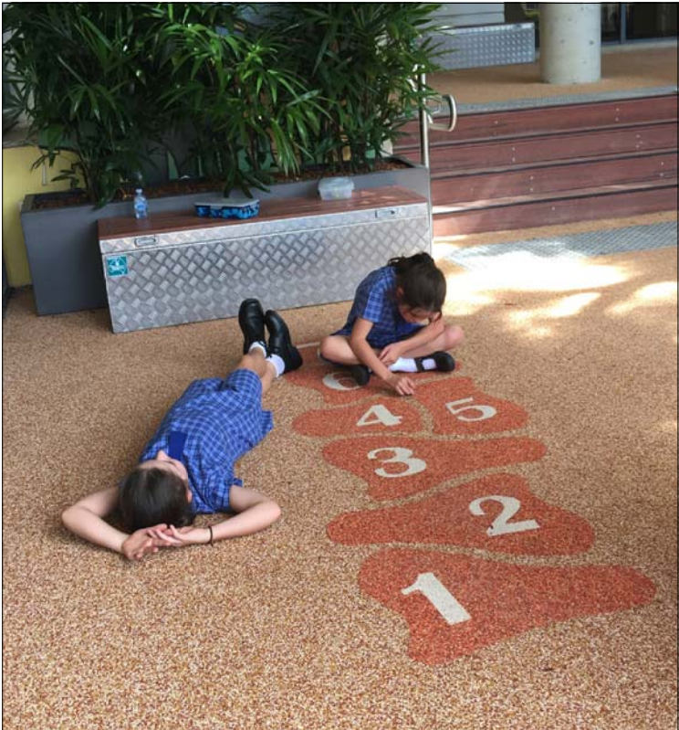
HOPSCOTCH PATTERN IN RUBBER