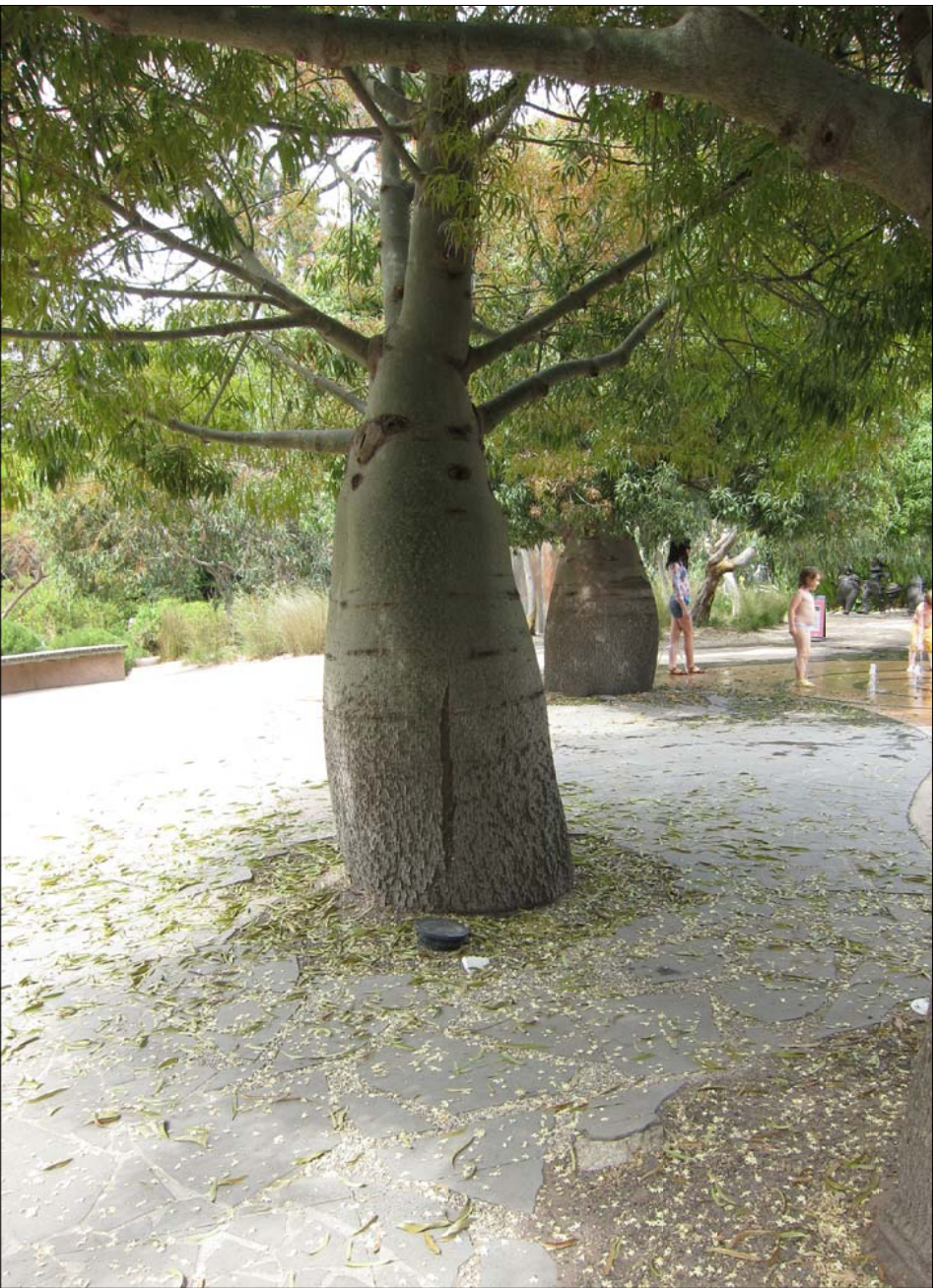
BOTTLE TREES, A DROUGHT TOLERANT INLAND TREES