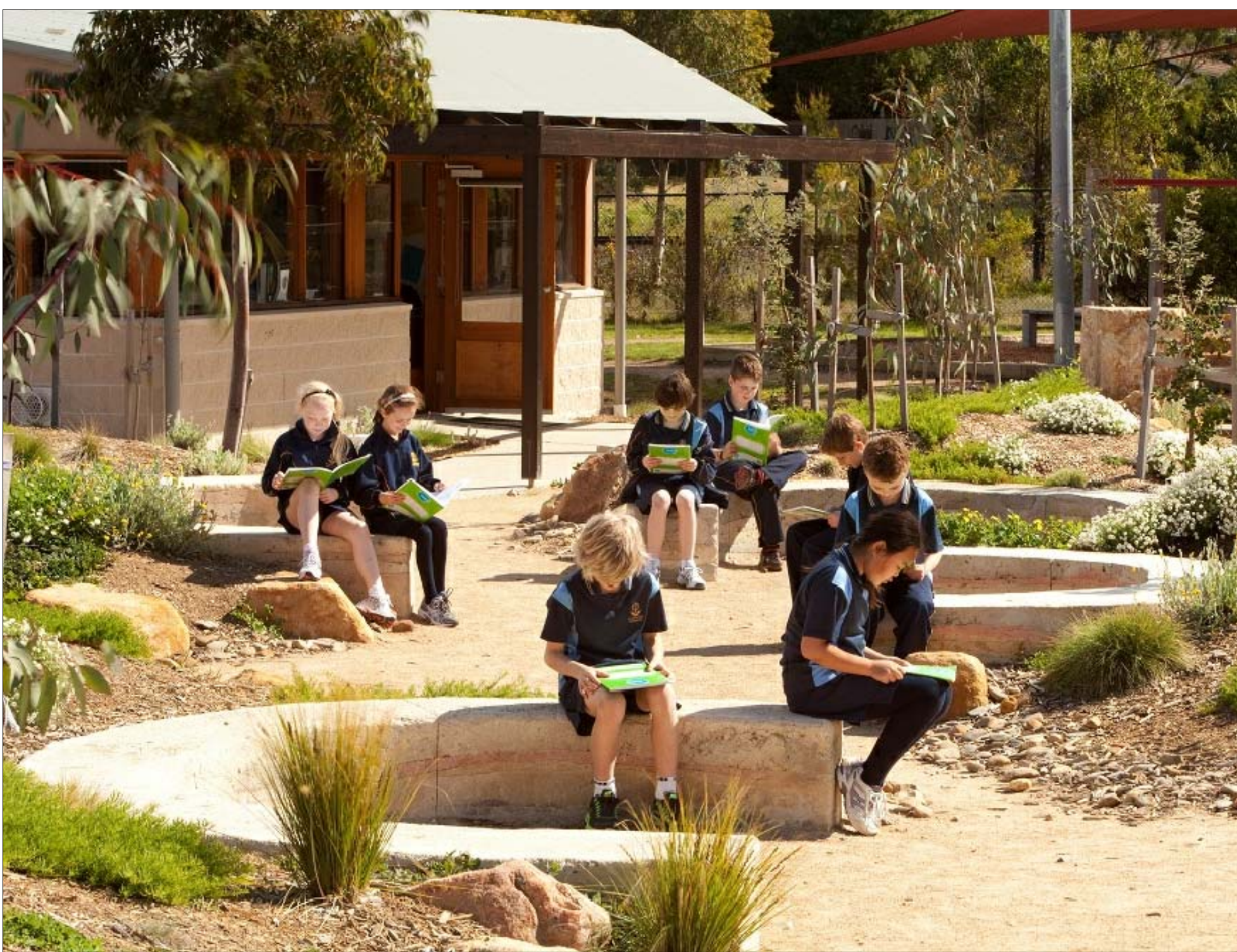
INFORMAL OUTDOOR LEARNING AREAS