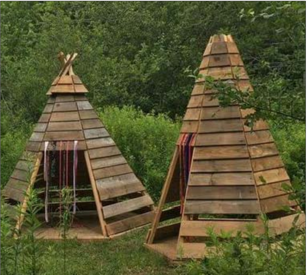
SMALL CUBBIES OR TEPEES FOR ROLE PLAY AND RETREAT