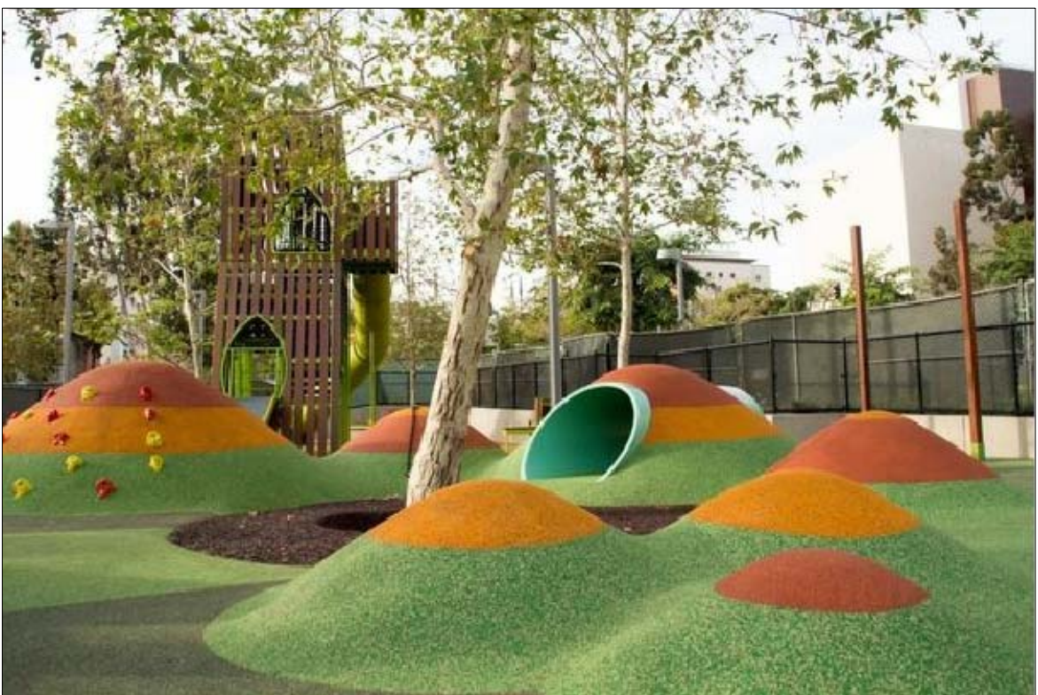
MOUNDS AND TUNNELS TO CHALLENGE