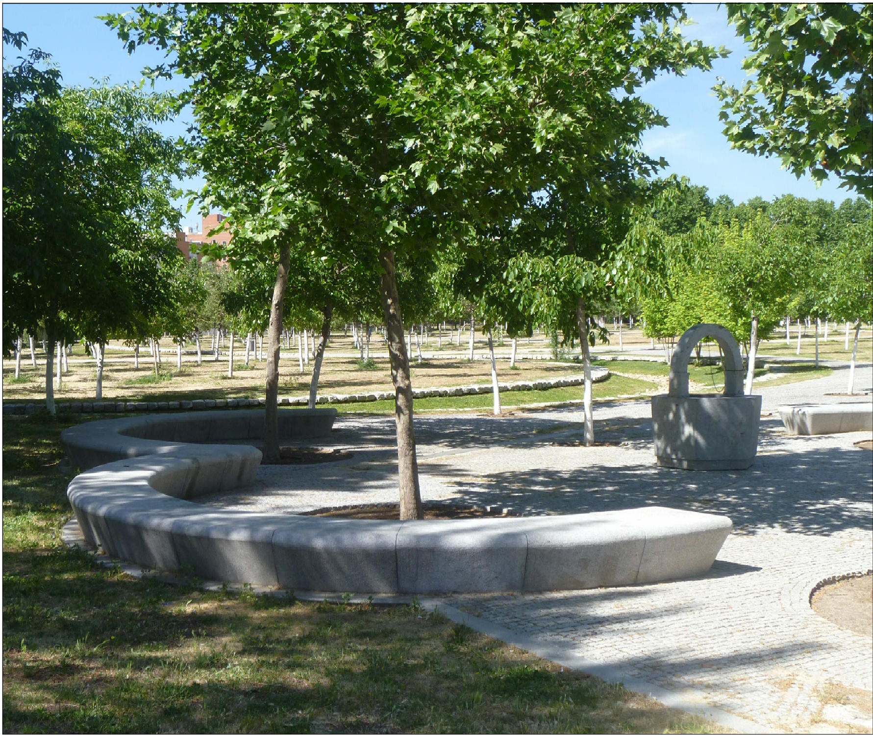
SHADED SEATING AREAS UNDER TREES