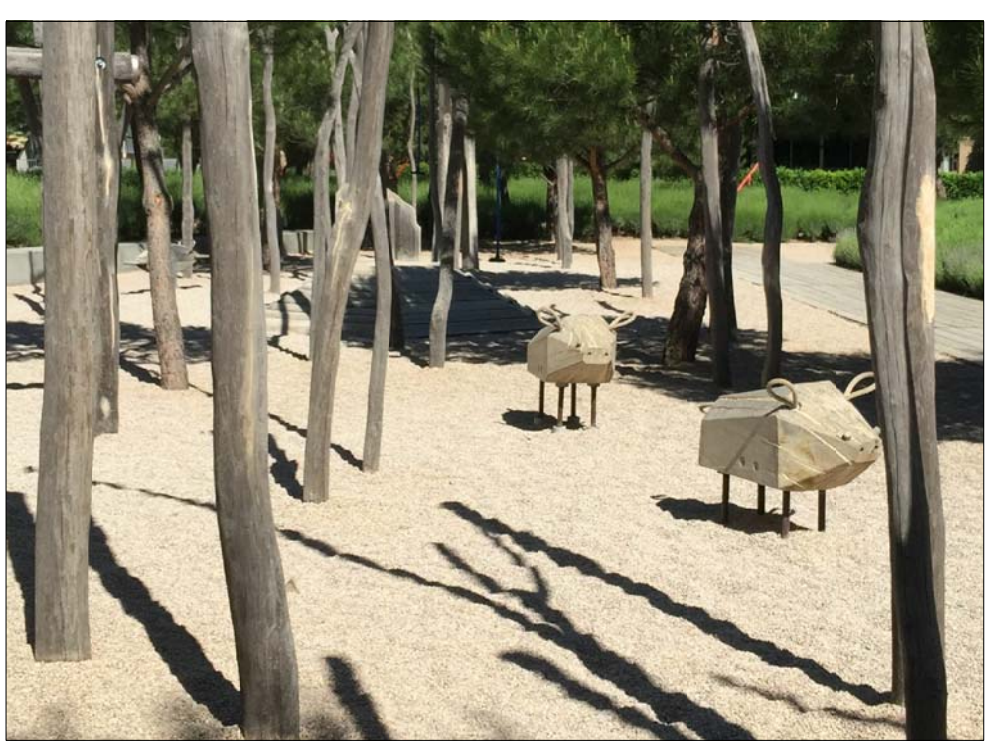
SITE SPECIFIC ART AND HANGING UPSIDE DOWN