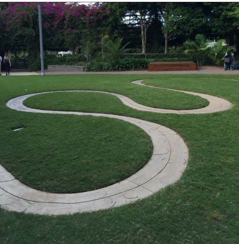
VARIETY OF SURFACES SPARKING IMAGINATION