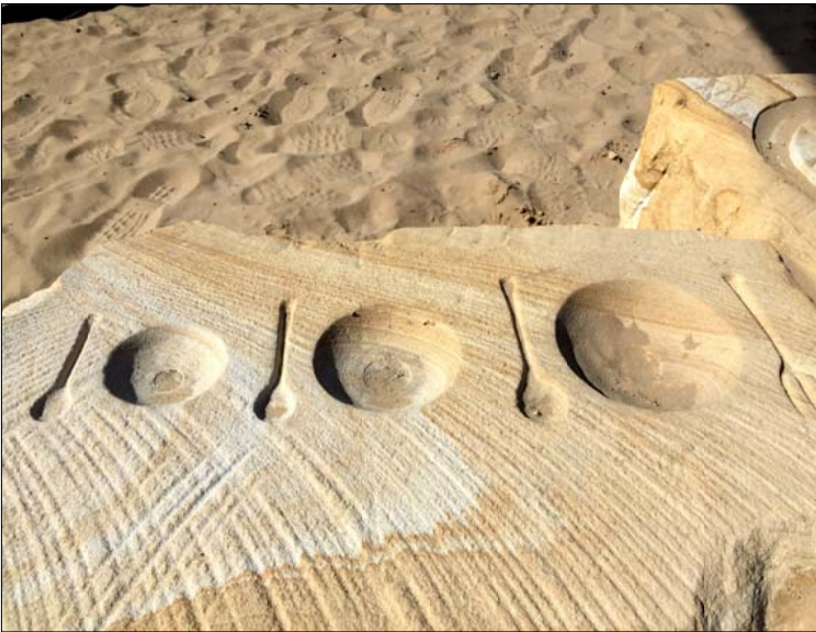
SAND PLAY AND INTRICATE FEATURES