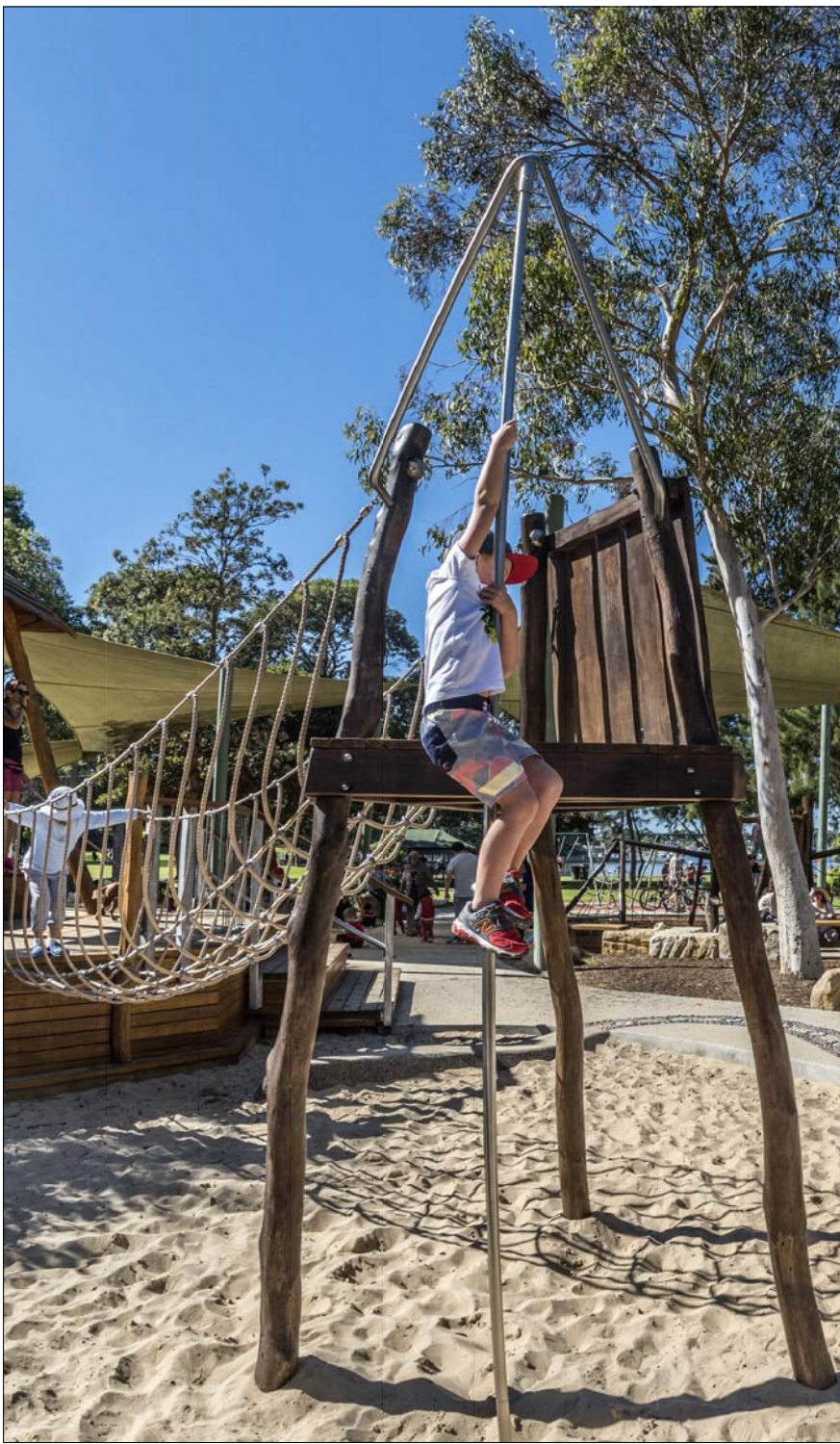
CHILDREN LOVE CLIMBING