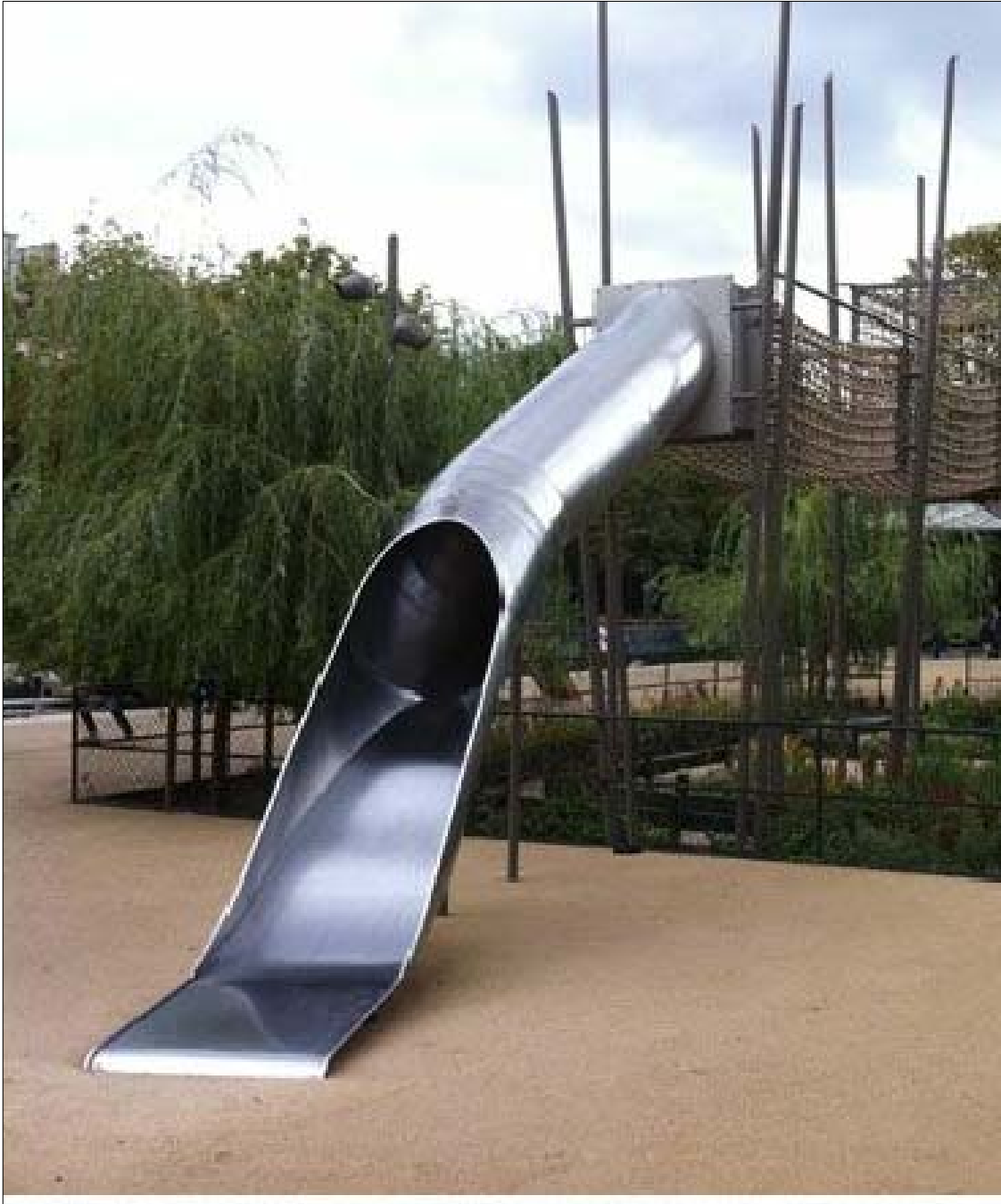
LARGE SLIDE AS ACCESS FROM FIRST FLOOR CLASSROOMS