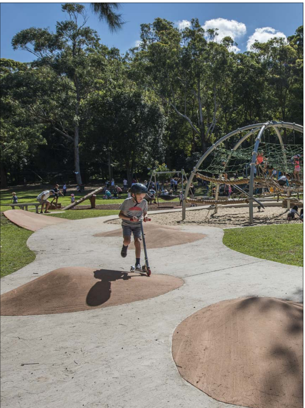
CIRCUIT BIKE TRAILS