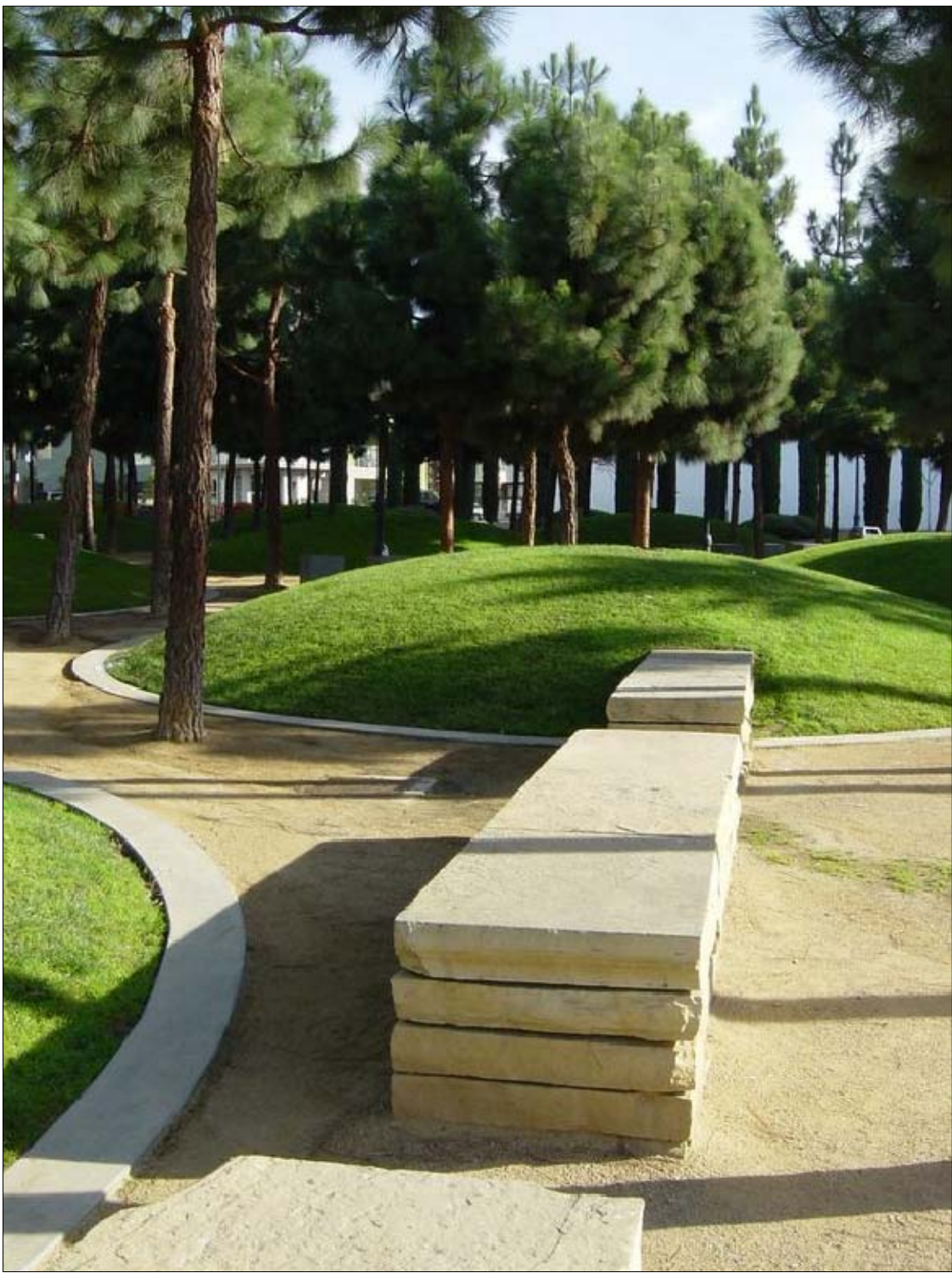
MOUNDS FOR PLAY