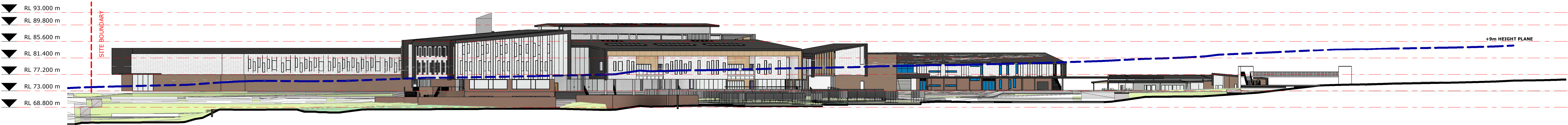
3 SITE ELEVATION_SOUTH 1 : 500