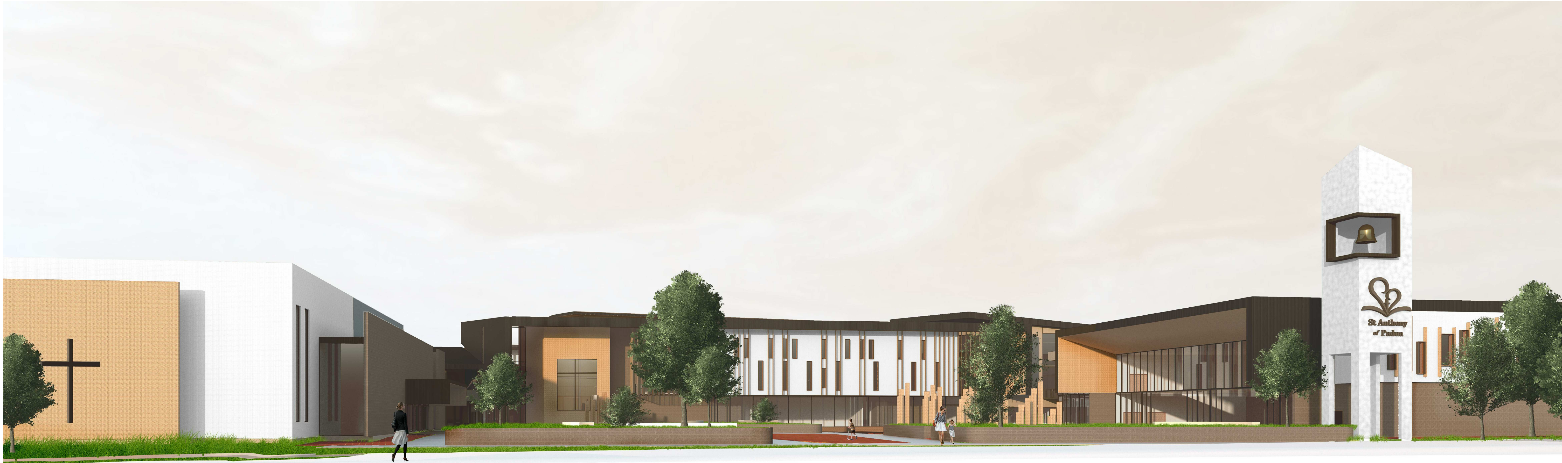
PERSPECTIVE - PIAZZA_WIDE