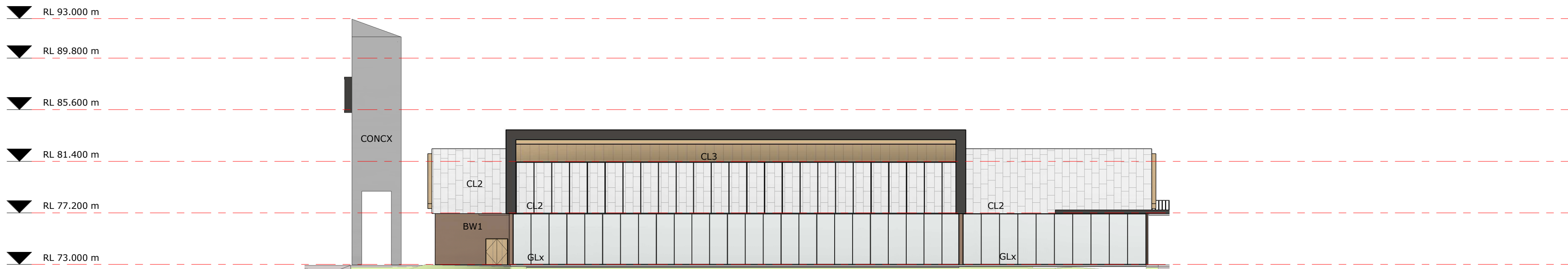
4 HALL - ELEVATION_ WEST 1 : 250