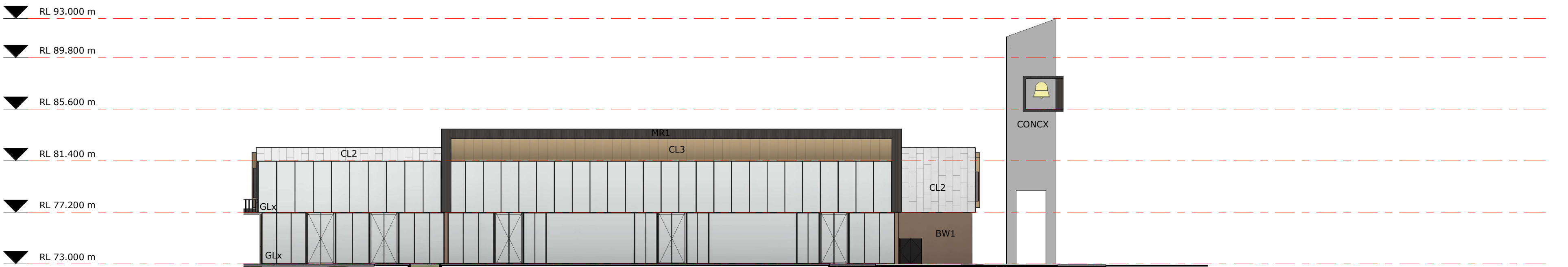
2 HALL - ELEVATION_ EAST 1 : 250